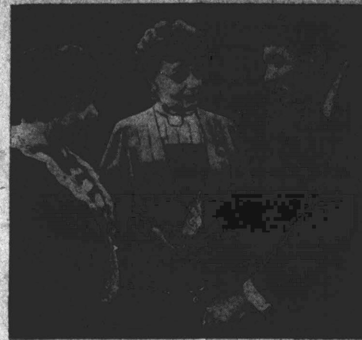
Josephine Hull, Jean Adair try to console their nephew Cary Grant in "Arsenic and Old Lace" at the Pitt Tuesday-Wednesday.