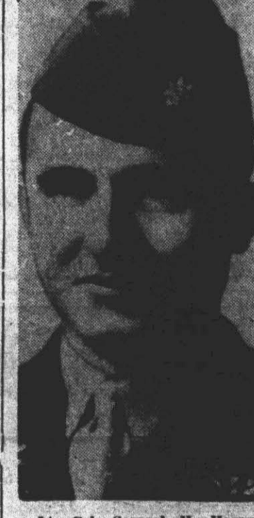
Lt. Col. Samuel H. Hogan (above) led 438 men of "Hogan's task force" which escaped through enemy lines in Belgium after six days of battling a German force surrounding them.

On the Eo Valley front Eighth Army troops continued to move forward north of Spa, capturing several localities against strong enemy resistance.