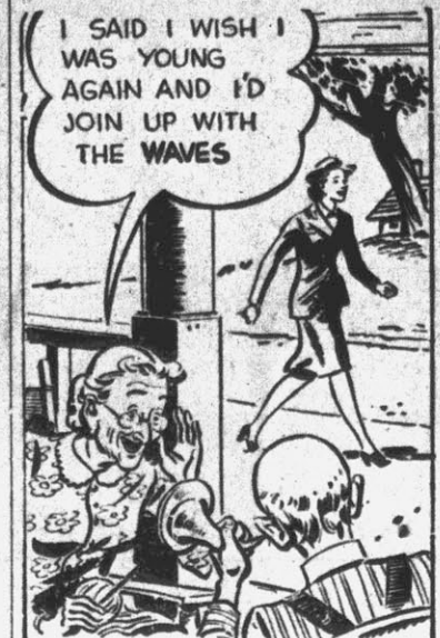
WAVES perform vital Navy jobs. Without them, manpower demands of the armed forces would be much more severe.

her, it is better she disappear. Then you not get her, anyway. You are cause of all the trouble." "Why, I'll—" Jason stopped suddenly. Kilani had made a slight movement as if to signal with her hand. Before Jason could turn he felt a hard, round object pressed against the small of his back. The muzzle of a pistol. He turned slowly and found himself face to face with Melikal, captain of the palace guards! To Be Continued