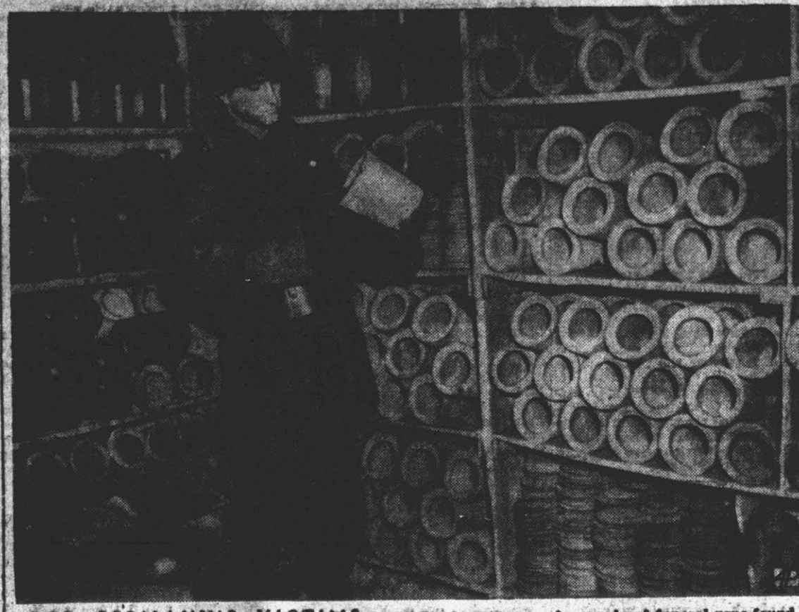
FOR GERMANY'S VICTIMS - A soldier inspects one of a supply of funeral urns found when Allies captured a German concentration camp in Schirmeck-Natzwiller area of France.