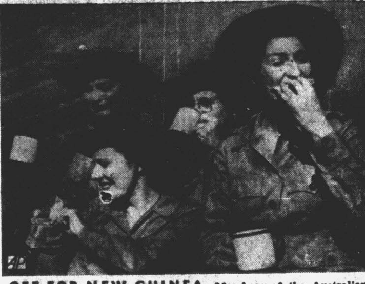
OFF FOR NEW GUINEA - Members of the Australian Auxiliary Medical Women's Service pause for a snack in Sydney, N. S. W., before leaving for the New Guinea front.