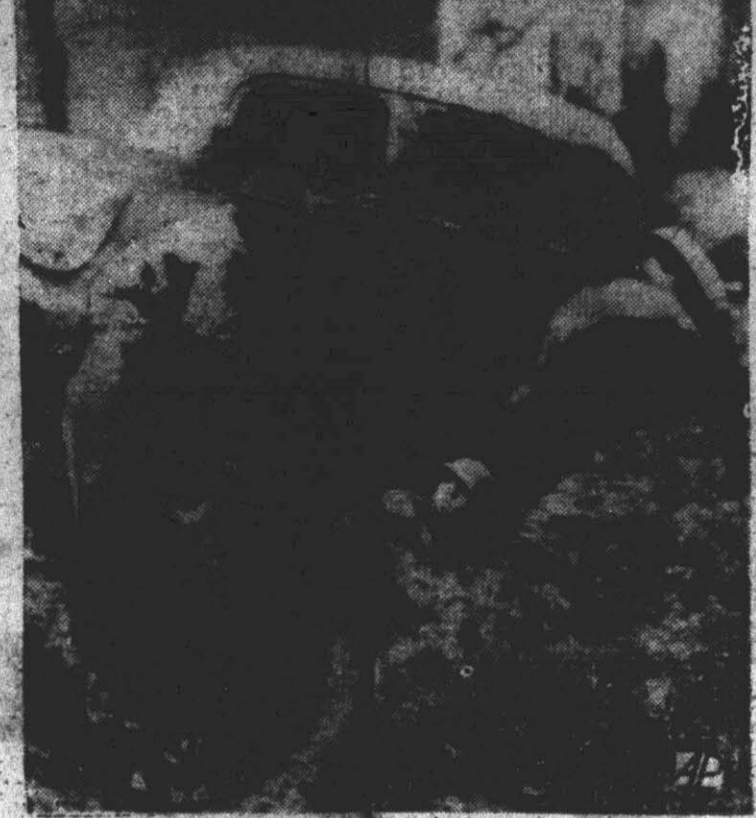
A French infantryman with rifle holds at bay a wounded German officer in a ditch on the outskirts of Belfort, France, after a French machine gun unit had fought the car loaded with enemy troops. Three dead Germans were taken from the vehicle.