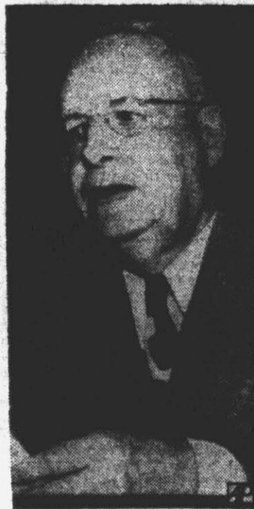
Former Gov. James M. Cox of Ohio, the 1920 Democratic presidential nominee, is shown posed before the microphones at Dayton prior to his nationally broadcast speech in behalf of the Roosevelt-Truman ticket.