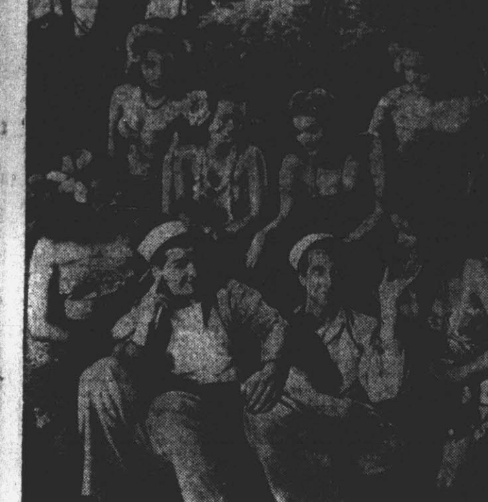
Eddie Bracken and Gil Lamb wonder if they're dreaming—scene is from musical "Rainbow Island" opening at the Pitt Tuesday.