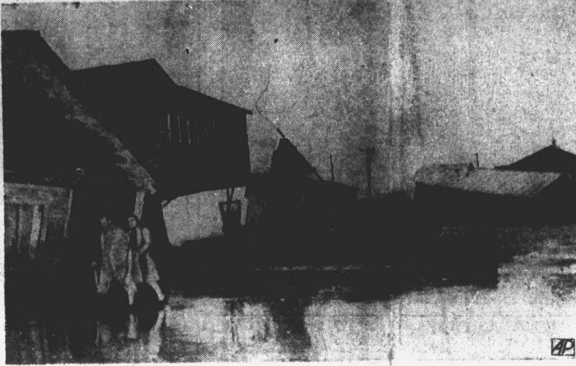
Some 50 cottages were smashed by waves and high winds at Fernandina Beach, Fla., below Jacksonville, by the 100-mile an hour hurricane that swept across Florida. This general view shows a number of the wrecked beach homes.