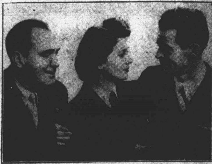
Pat O'Brien, Ruth Hussey, Robert Ryan co-starred in "Marine Raiders," opening Sunday at the Pitt.