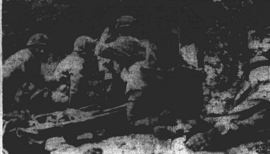
British paratroopers, operating in the Arnhem area before they were forced to withdraw, man a six-pounder anti-tank gun against a German self-propelled gun only a short distance away. The British finally were forced to leave the sector, leaving their wounded behind. This is a British official photo.