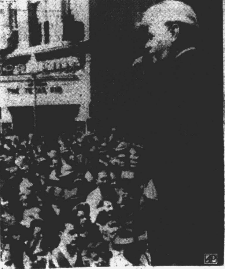
His hair mussed, Gov. John W. Bricker of Ohio, republican vice presidential nominee, addresses a crowd in Mitchell, Ind., during a stop September 9 while en route to French Lick, Ind. There, Bricker declared that the Republican party would "re-establish liberty."