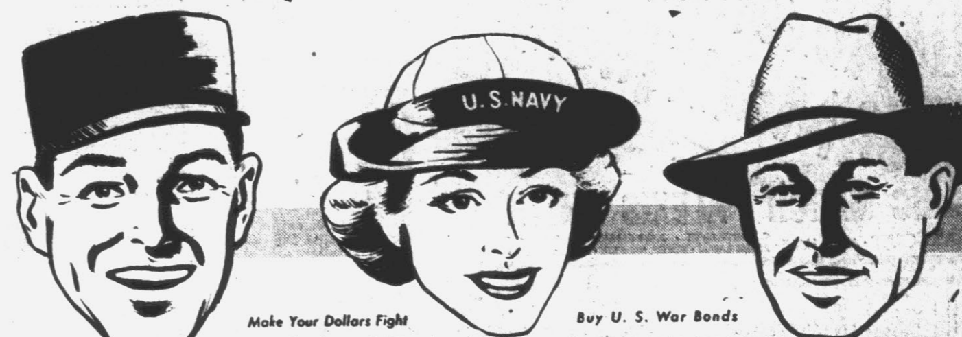
Make Your Dollars Fight