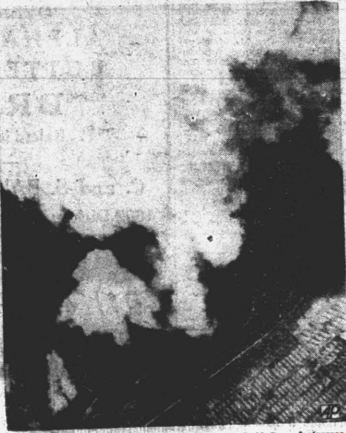
Huge clouds of smoke roll up as bombs from B-29 Superfortresses fall on the Shouwa steel works at Anshan, Manchuria, in a raid July 28. Anshan is Manchuria's largest industrial city. This is the first photo of the raid.