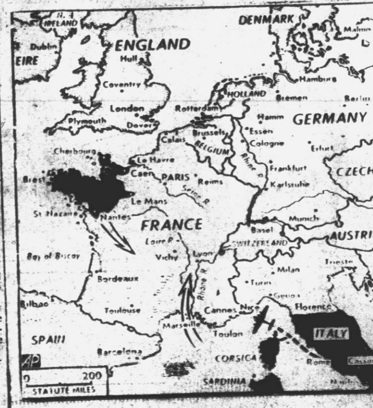
French, British and American forces swarmed ashore on a 70-mile front on the southern coast of France (arrow) at dawn today following intensified aerial assault that paved the way for the new invasion. Another American spearhead (arrow left) has smashed across the Loire river and is driving southeastward toward a junction with the new invasion forces. Meanwhile the news of the capture of the Mass American and British forces have been checked a trap on between 100,000 and 200,000 Nazi troops.