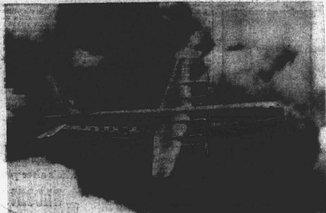
NEW LIBERATOR LINER —Designed as a postwar luxury airliner, Consolidated Vultee's new Liberator liner (above) has numerous features of the Liberator bomber (B-24).

Mr. Roosevelt said simply that while he respects and likes Wallace as a friend and personally would vote for his renomination if he were a delegate, the convention itself must make the decision.