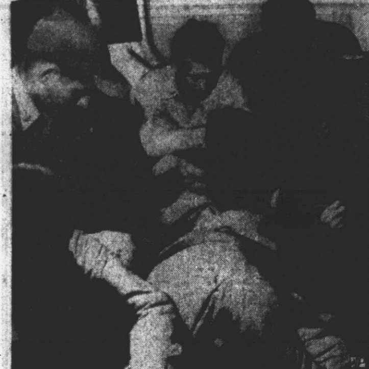
EAGER LISTENERS —Aboard an aircraft carrier in the Pacific, U. S. Navy pilots listen over the radio to a radio-telephone conversation between fellow fliers making a raid against Japanese-held Tinian in the Marianas chain.