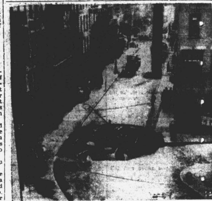
NO, NOT A BOMB —A water main break and gas explosion, not enemy action, made this hole in the paving at Mott and Pell streets, in the heart of New York's Chinatown.