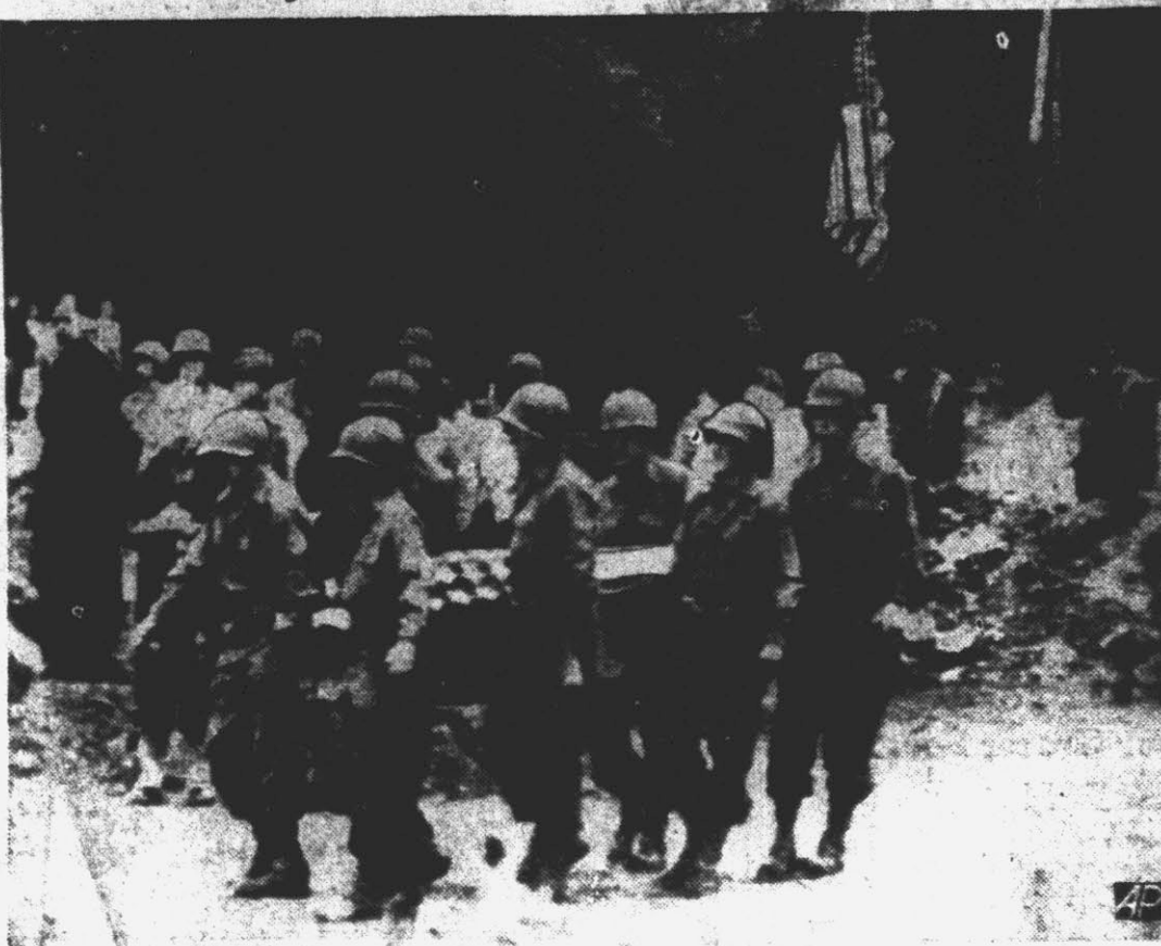
GI pallbearers carry the flag-draped casket of Brig. Gen. Theodore Roosevelt to his grave in the military cemetery at St. Mere Eglise in the Normandy invasion sector.