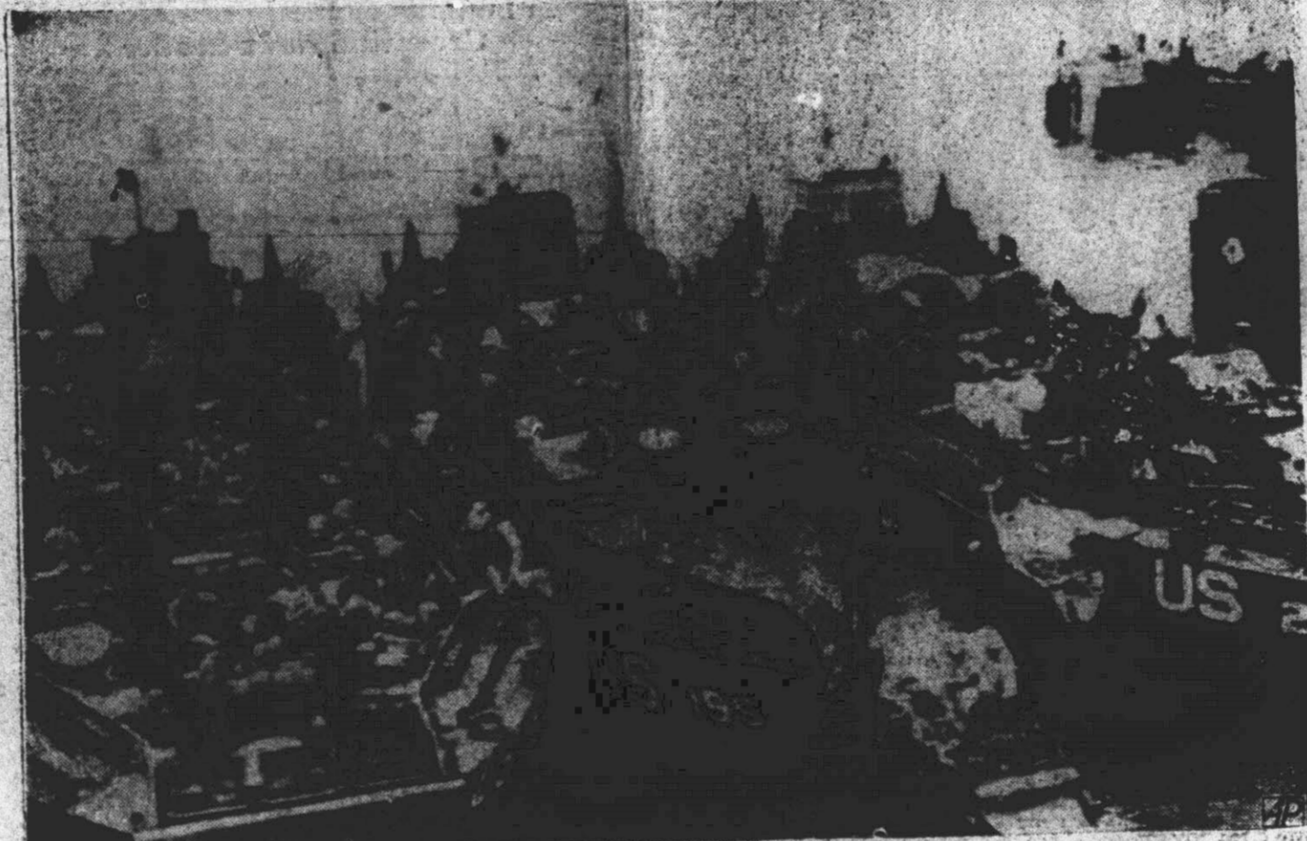
LCT's are loaded with half tracks and other armored vehicles by American troops just before heading for the D-day invasion on the French coast June 6.

For the moment, let's temper our enthusiasm with caution.