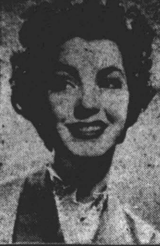
Marsha Hunt plays the dynamic heroine's part in "None Shall Escape," showing at the Pitt Thursday-Friday.