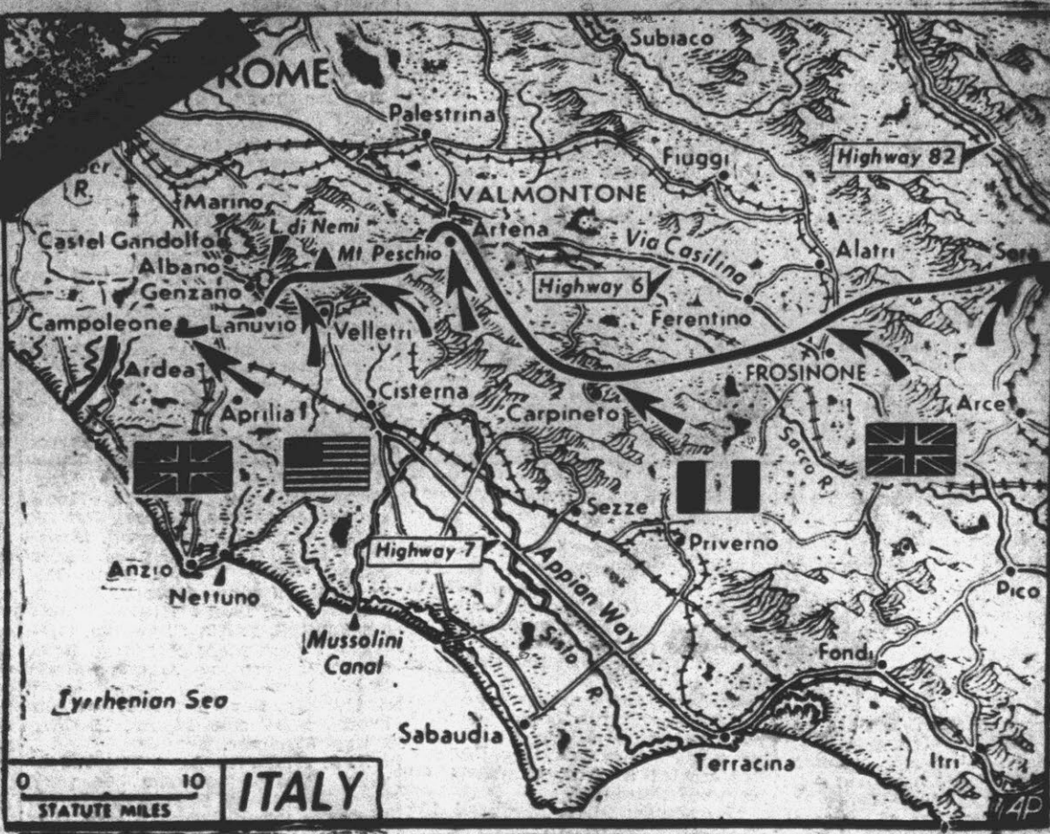
The arrows on the above map indicate Allied drives along the Italian front, which culminated in the capture of Rome by the Fifth Army yesterday, and today the victorious armies were pursuing the fleeing Nazis northward, while the British armies continue to close in from the east.