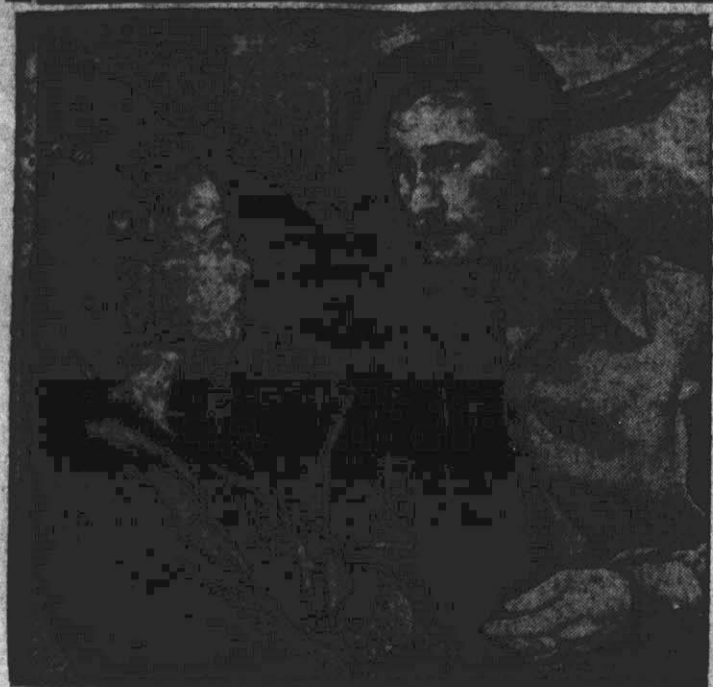
Errol Flynn and Faye Emerson in scene from the gripping story "Uncertain Glory," playing Sunday, Monday at Pitt Theatre.

DOES STINT—Silent screen star Constance Talmadge does her bit by working as dietician's aide for the Red Cross. Here she weighs used fat at a New York hospital.