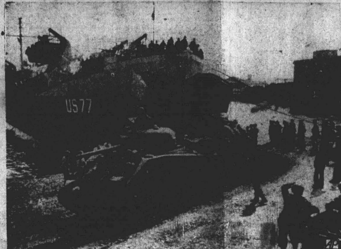
Tanks of an armored regiment roll onto the beach from the jaws of an LST in the Anzio harbor, adding strength for Allied forces on the Italian beachhead, where Lt. Gen. Mark W. Clark has established a Fifth Army advanced command.