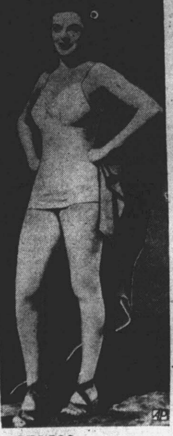
ACTRESS—Screen actress Marguerite Chapman dons bathing suit and sandals and gets all ready for the beach.

When disorder of kidney function permits poisonous acids to remain in your blood, it may cause nagging backache, rheumatic pains, leg pains, loss of pep and energy, grating up nights, swelling, stiffness under the shoulders, headaches and dizziness. Frequent or scanty passages with smarting and burning sometimes show there is something wrong with your kidneys or bladder. Don't wait! Ask your druggist for Doan's Pills, used successfully by millions for over 40 years. They give happy relief and will help the 15 million of kidney tubes flush out poisonous waste from your blood. Get Doan's Pills.