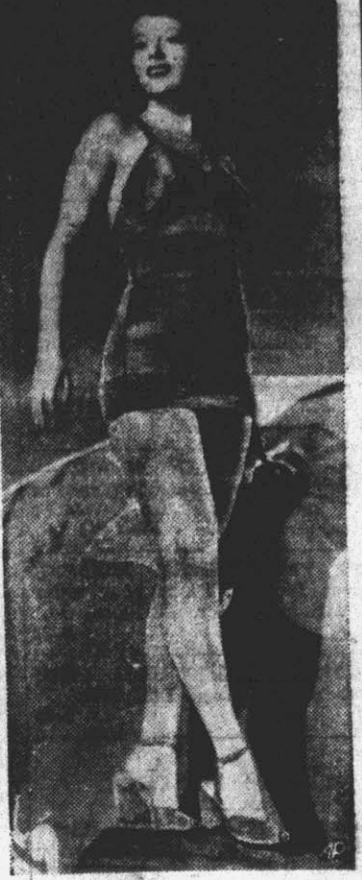
BATHER—Something snappy for the beach is modeled by Eveslyn Keyes, young movie actress