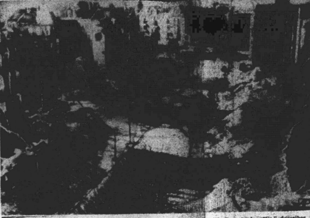
The caption accompanying this picture, supplied by the Swedish picture magazine "Se," describes it as a view of Berlin bomb damage along the Aschaffenburgstrasse, looking toward the Finger Platz, a southern section of the city. (AP Wirephoto via radio).