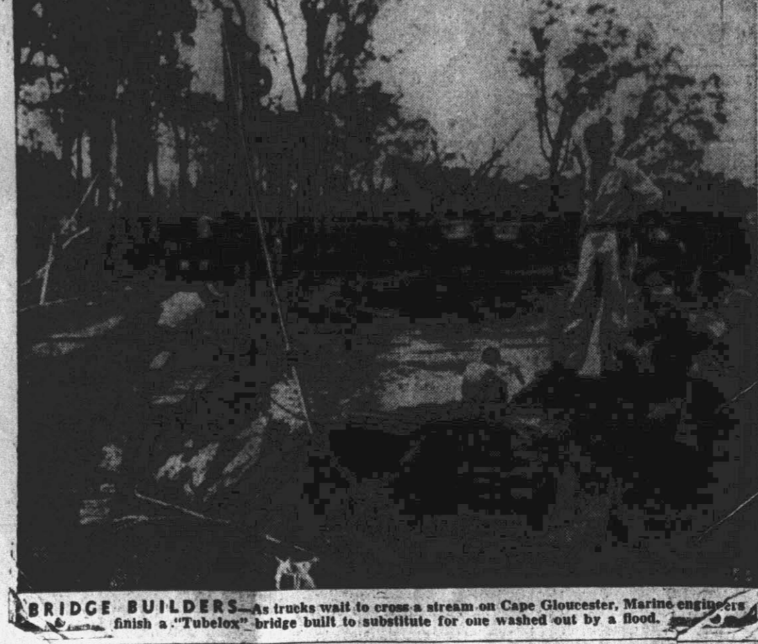
BRIDGE BUILDERS - As trucks wait to cross a stream on Cape Gloucester, Marine engineers finish a "Tubelox" bridge built to substitute for one washed out by a flood.