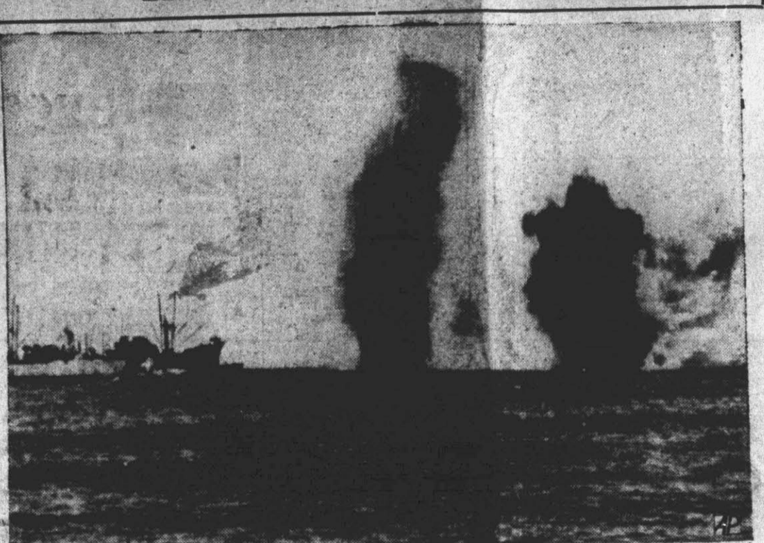
Bombs from German fighter bombers explode near an Allied supply ship, riding at anchor off the Anzio beachhead while discharging cargo.