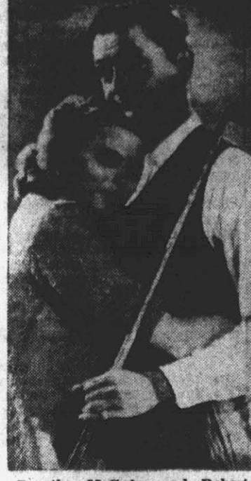
Dorothy McGuire and Robert Young take feature roles in "Claudia" opening Thursday at the Pitt Theatre.

Am Car Fdy 35 1/2 Am Roll Mill 13 1/2 Am Smelt and Ref 37 A T and T 158 3/4 Am Tob B 58 1/2 Anacosta 28 1/2 Arm III 36 1/2 A C L 5 1/2 Atl Ref 28 1/2 Aviat Corp 4 1/2 Baldwin 19 1/2 B and O 7 1/2 Barnsdall 16 1/2 Beth Stl 58 Boeing Airpl 15 Borden 29 1/2 Budd Mfg 6 1/2 Burl Mills 28 Bur Add Mach 12 1/2 Cannon Mills 44 Case J I 35 1/2 Caterpil Trac 47 1/2 Ches an dO 46 1/2 Chrysler 112 1/2 Coca Cola 39 1/2 Coml Credit 15 1/2 Coml Solv 34 1/2 Cont Can 56 1/2 Corn Prod 5 1/2 Curtiss Wright 5 1/2