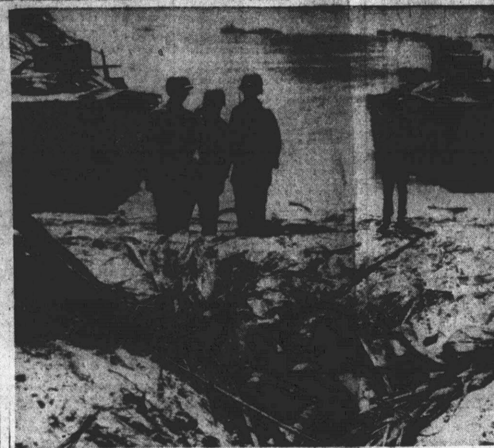
Bodies of three Japanese soldiers, who attempted to block the advance of U. S. forces on Engebi Isle in Eniwetok atoll of the Marshalls, still smoke after a flame thrower has passed on. Other soldiers with their amphibious tanks (background) look over the scene..