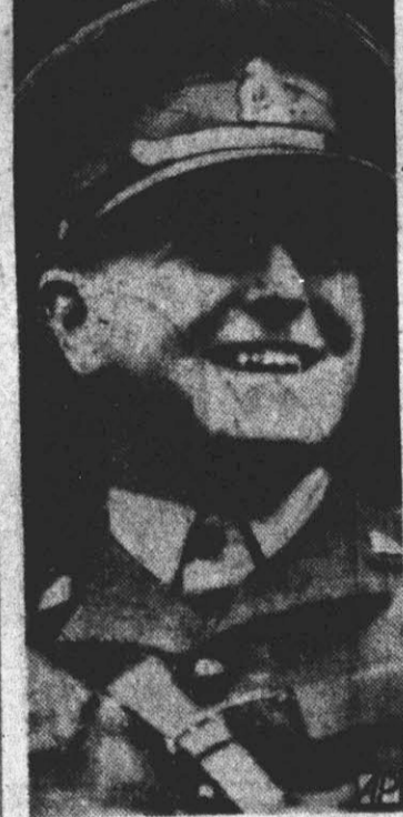
Capt. Randolph Churchill, (above), son of the British Prime Minister, was reported in London as conferring with Marshal Josip Broz (Tito), Yugoslav guerrilla leader after presumably parachuting into Yugoslavia.