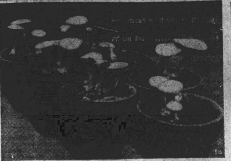
POTTED MUSHROOMS —Sydney, Australia, mushroom expert Raymond Mas grows mushrooms in pots to prove they do not need darkness and damp weather. Five weeks after planting he puts moist cloth over pot each day.