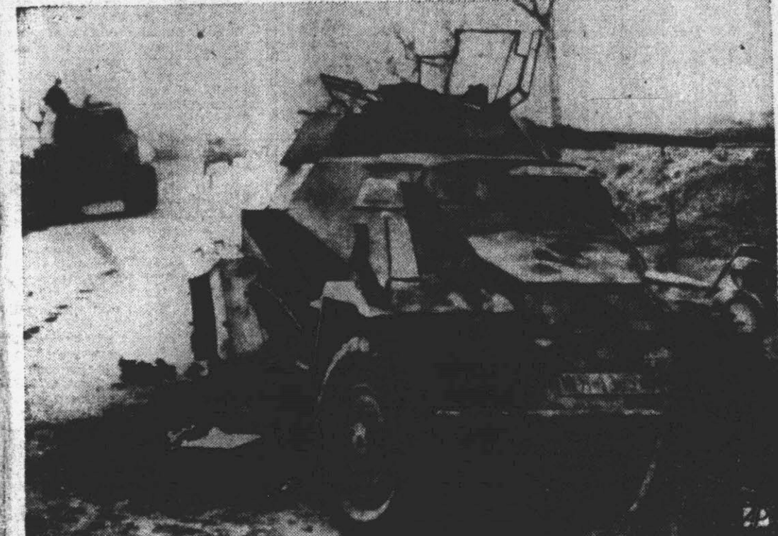
A knocked-out German armored car (right) stands at the side of a road near Anzio, Italy, in the Allied beachhead area south of Rome, as British tanks roll by on the other side. Bitter fighting continues in the sector. This is an official British picture.

Evidence Of The Bitter Fighting Near Anzio