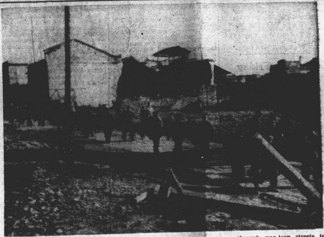
A long line of residents of Changteh, Hunan province, China, returns through war-torn streets to rebuild their homes after Chinese troops had recaptured the city from the Japanese, December 9, 1943.