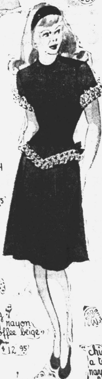
she said "yes" —a two-piece, american beauty rayon crepe, pink, blue, and pale gold. sizes 9 to 15 $14.95