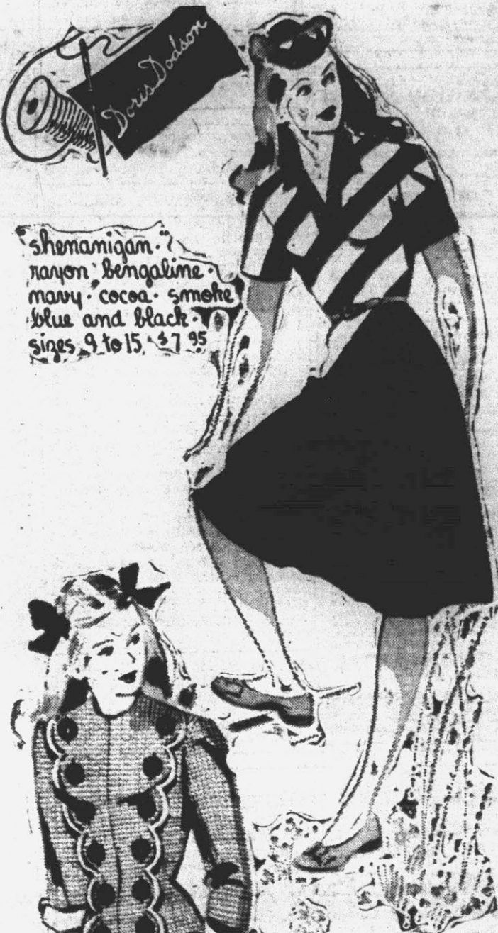
shemamigan —rayon, bengaline, navy, cocoa, smokes, blue and black. sizes 9 to 15. $7.95