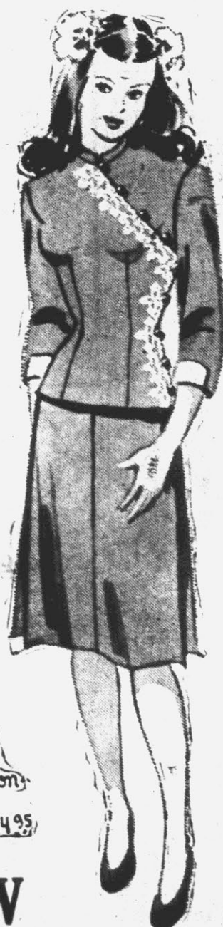
china maid —a two-piece, rayon flannel, gold, red, melon, and aqua. sizes 9 to 15 $14.95