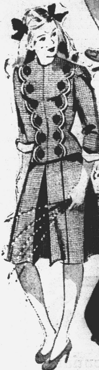
spring forecast —a two-piece, rayon shantung, black and white check. sizes 9 to 15 $8.95