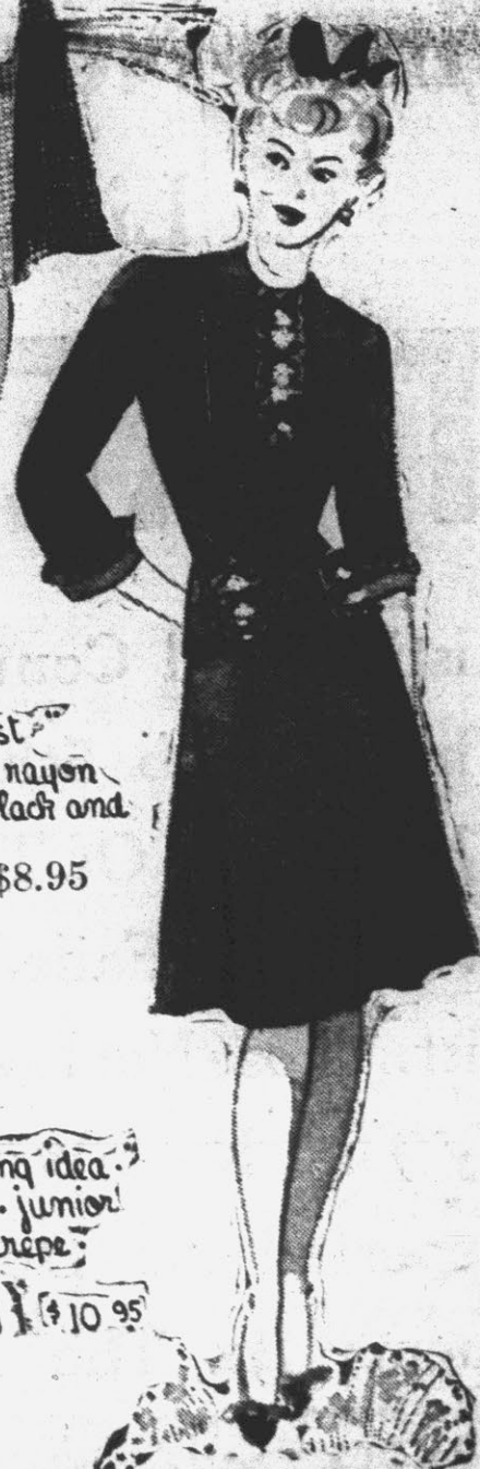
the new spring idea —a two-piece, junior miss rayon crepe, navy only. sizes 9 to 15 $10.95