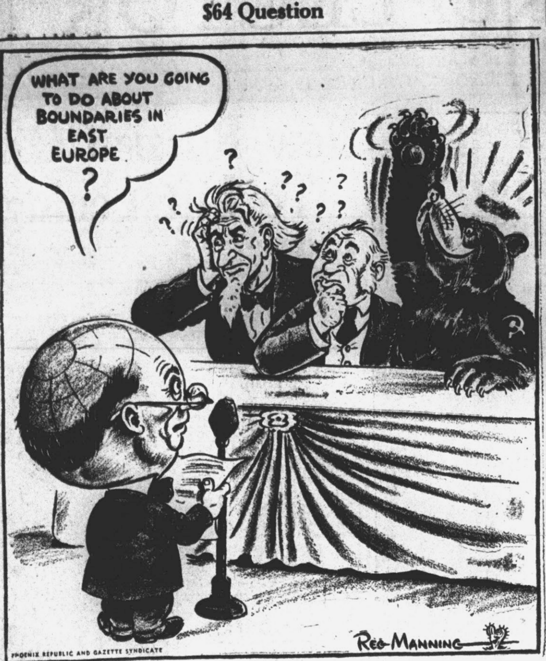
PHOENIX REPUBLIC AND GAZETTE SYNDICATE

But the Justice Department will tell you that the Dies probes had a lot to do with the recent indictment of 30 men and women accused