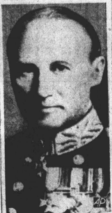
Admiral Sir Bertram Ramsay (above), has been appointed commander-in-chief of naval forces in Gen Dwight Eisenhower's forces being organized to open a western front against Germany.