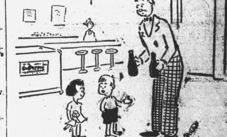
"I hope you're not telling me that you've joined the W.A.C.'s just so I'll buy you this Dr. Pepper as a farewell gesture."