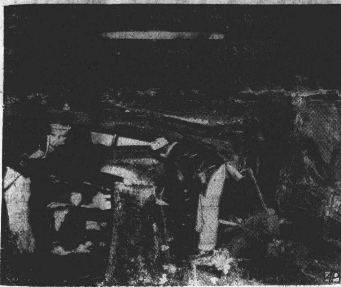
Two Georgia state guardsmen search the end of an overturned coach for survivors after two persons were killed and 21 injured in the derailment of the Seaboard railroad's fast passenger train, the Sun Queen, near Seak, Ga. Three coaches turned over on their sides and five others were derailed. The train was enroute from Florida to New York.

The trains were crowded with holiday travelers. Scattered about the wreck scene were packages in Christmas wrappings, army blouses, marine coats and broken Christmas toys. One spectator reported seeing a white satin dress and white veil, evidently the wedding dress of some passenger. After the first derailment some of the passengers built bonfires of newspapers to stop two southbound freight trains. They frantically endeavored by the same means to warn the northbound engineer, without succeeding. Many of the service men were en route to their homes for the holidays. Those who were not injured pitched in and helped in the rescue work and declined to board a relief train sent from Florence, S. C. From army bases in the area, ambulances, wrecking crews, doctors, nurses and medical units sped to the scene before dawn. Laurinburg-Maxton air base sent a detachment of 40 men with acetylene torches and jacks and it was their work which opened the way for the rescue of many trapped under the steel wreckage. One railroad official said an automatic warning device on the parallel