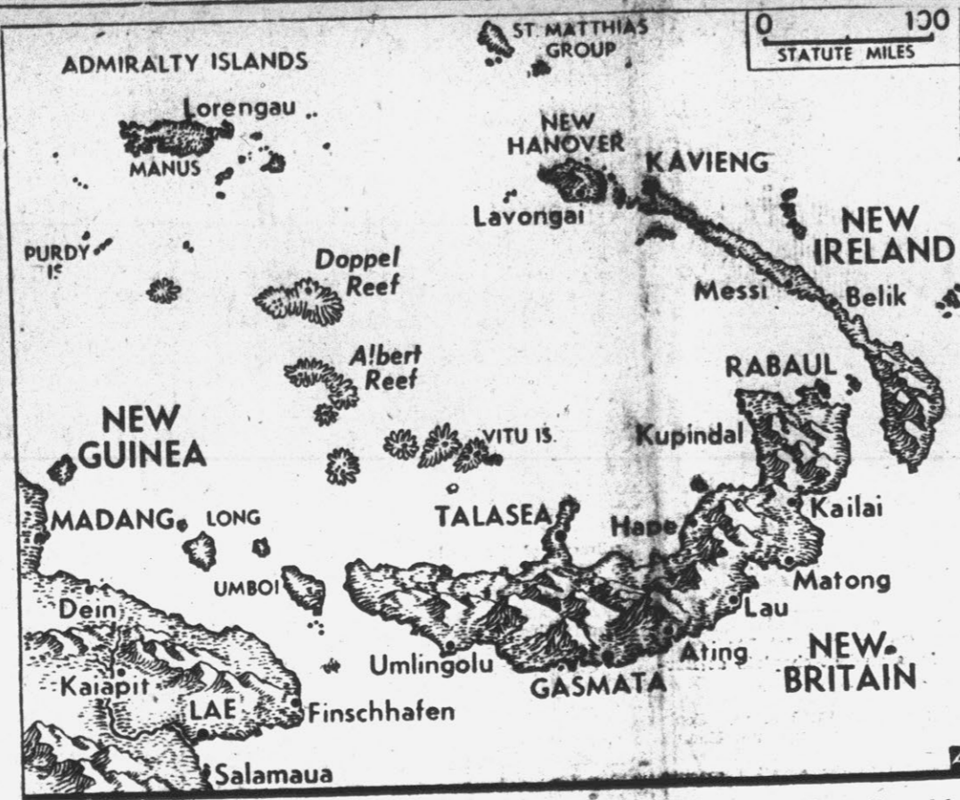
American forces have invaded New Britain, Japan's major island east in the South Pacific and have successfully established bridgeheads for a drive against the main Jap base at Rabaul. The landings took place on the Arawe peninsula at the southwestern end of the island 250 miles from Rabaul.