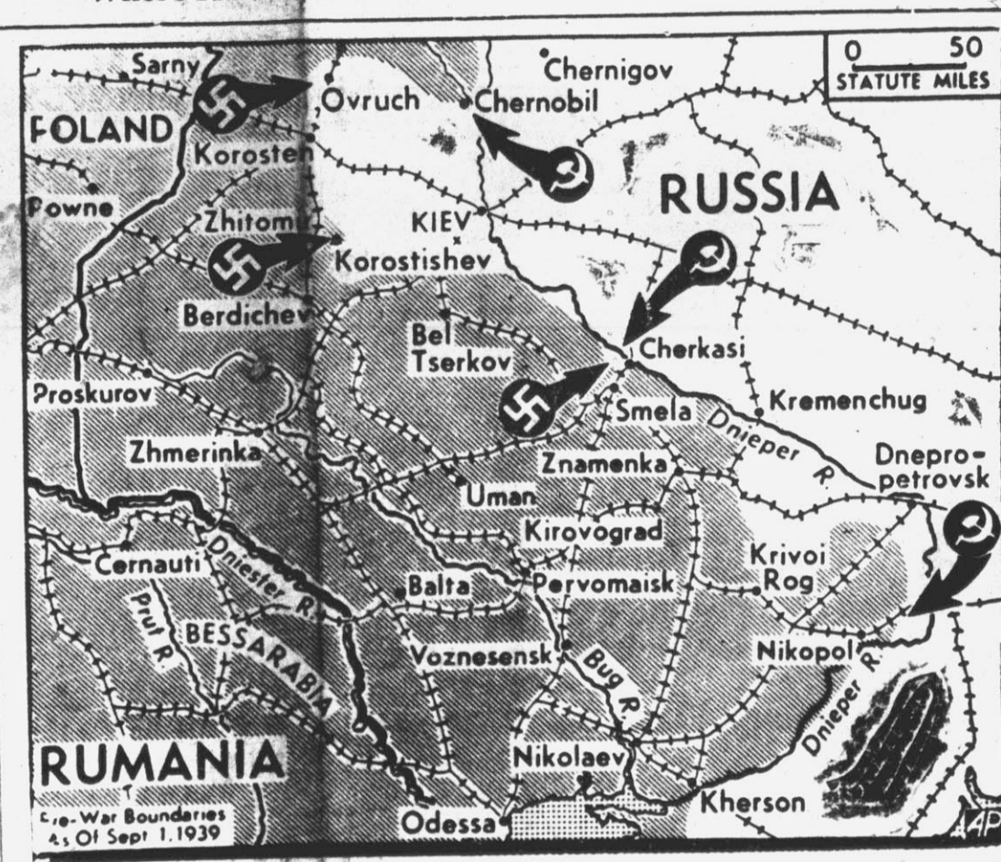
In an effort to stem the advance of the Russians, German forces launched powerful counterattacks against the Reds at Ovruch in the Korostishev area where they captured Zhitomir Friday and the Kaski Reprits from Moscow, meanwhile, said Soviet troops were pressing attacks at Cherkasi, a Chernobil area southwest of Chernigov, and in the Dnieper bend north of Nikopol. The Reds have made a steady advance since launching their present attacks last June.