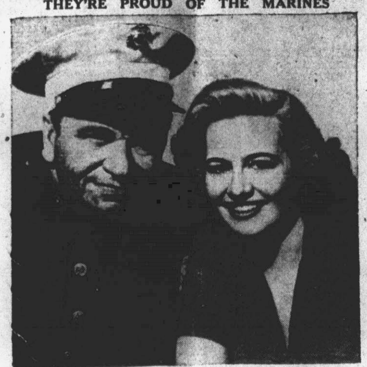
"Salute To The Marines" filmed in technicolor, opens Sunday at the Pitt. Wally Beery has the role of a Leatherneck with 30 years of service and Marilyn Maxwell plays as his daughter.