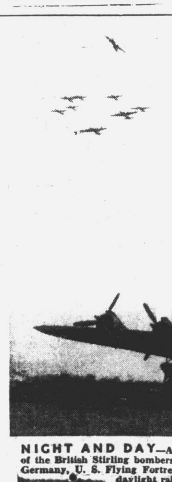
NIGHT AND DAY—At an air field in England where one of the British Stirling bombers rests following a night foray over Germany, U. S. Flying Fortresses peel off for a landing after a daylight raid on the Reich.

Ten Per Cent OF YOUR INCOME should be going into U.S. War Bonds and Stamps