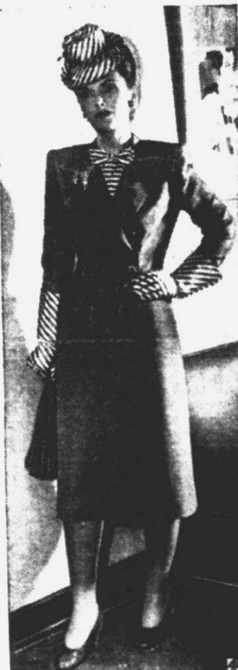
ENSEMBLE—Anita Colby, model and screen actress, wears a smart ensemble of periwinkle blue shantung suit with gauntlet gloves, postilion hat and blouse of purple and white taffeta.