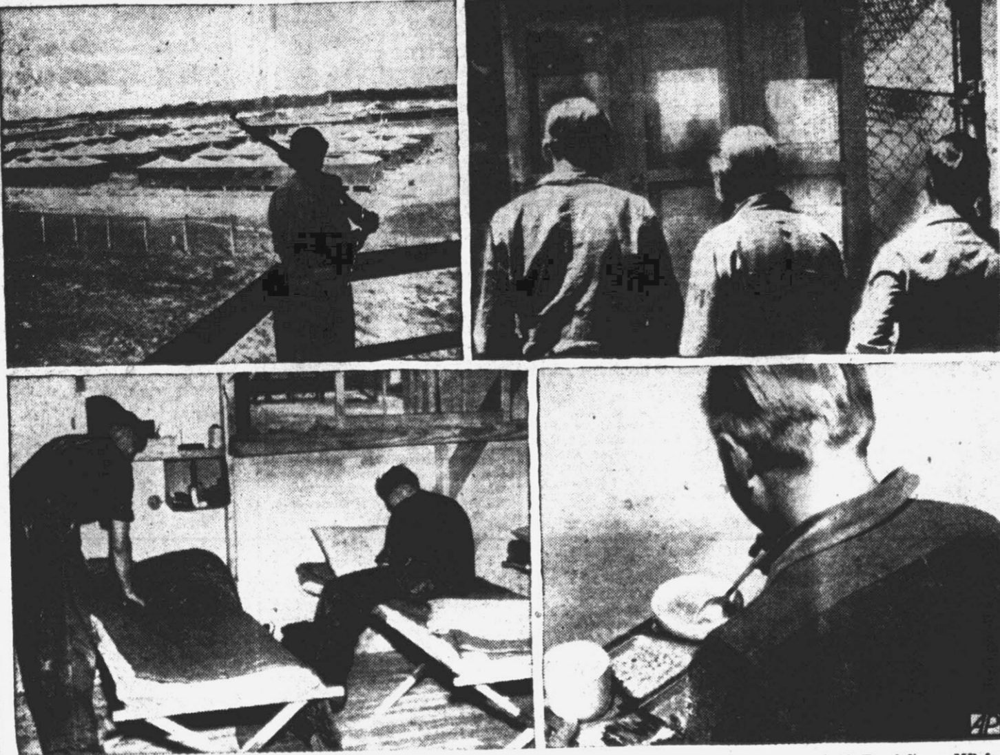
Here are scenes from some of the prison camps in 17 states in which 36,000 Axis prisoners of war are now held. Top left: an MP from his watch-tower outside the high fence around the internment camp at Camp Chaffee, Ark., keeps a watchful eye on the compound. Top right: Three prisoners at Angel Island, Calif., study the bulletin board on which all messages are posted in German, Italian and Japanese. Bottom left: German prisoners of war at Camp Breckinridge, Ky., make up bunks in their barracks. Bottom right: A captured Axis prisoner partakes of a hearty meal at Angel Island. War Department regulations bar all pictures showing recognizable faces of war prisoners.