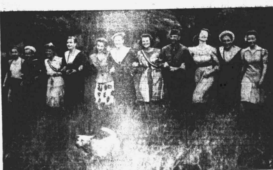
COMPANY FRONT — With a puppy leading the way, French sailors, a U. S. soldier and sailor, and some pretty girls stroll at a party for service men at Brookline, Mass.