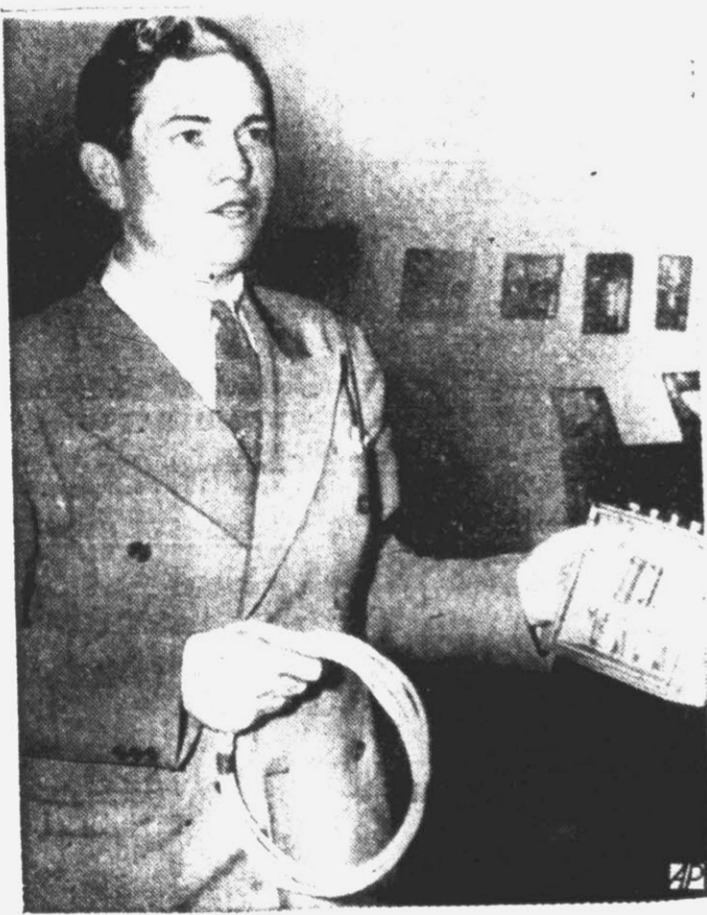
Pat Coon, (above), special assistant to the U. S. attorney general, holds a circuit box and some wire cable, government exhibits in its case in federal court at Fort Wayne, Ind., against five employees and the Anaconda Wire and Cable Co., charged with conspiracy to defraud the government through manufacture of defective war material. Coon said 20 witnesses told of a system of hidden "circuit boxes" which, they said, fooled government inspectors.