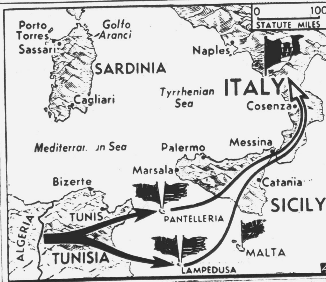
Following up bombardment from the air and sea, Allied forces (arrow) at week's end (June 12) occupied the Italian island of Lampedusa, and thus gained one day after the fall of Pantelleria (arrow) another other Trans-Mediterranean stepping stone in a possible invasion path (open arrow) across Sicily and into Italy. Lampedusa and Linosa, two smaller Italian islands have also been occupied.