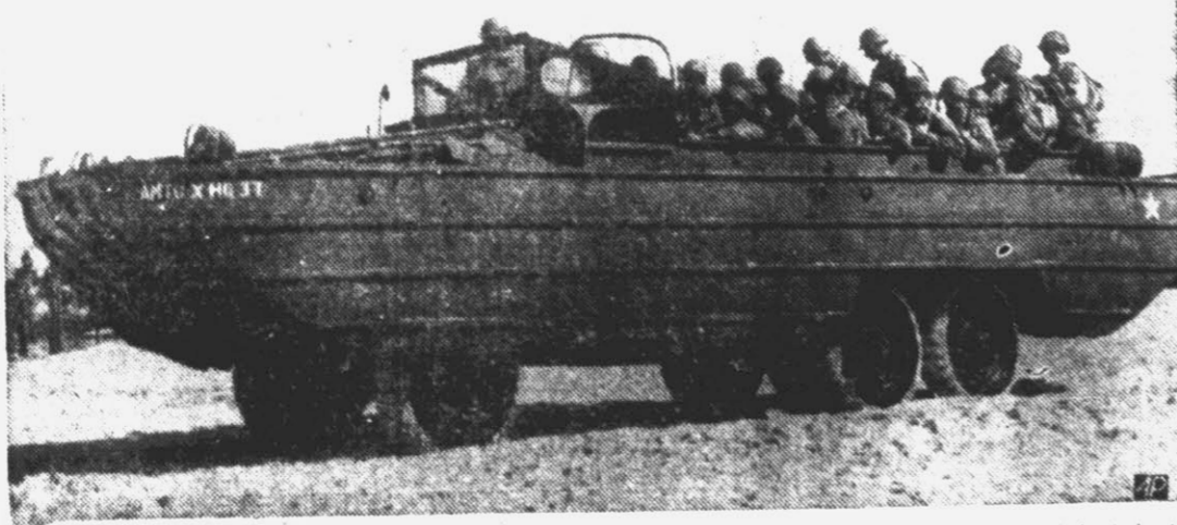
This is the U. S. Army's new 2 1/2-ton amphibious troop-carrier truck cruising along (at top) in the water off Carrabelle, Fla., and (at bottom) the vehicle demonstrates its land-going aptitude with a run along the beach sands. The 3rd Amphibian Engineer Command of Camp Gordon Johnston, formerly Camp Carrabelle, put the truck through its paces during this demonstration.