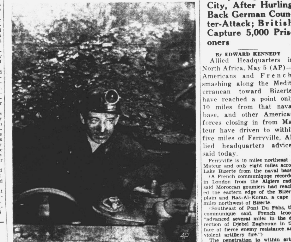
For the first time since work was stopped by the strike of miners, a train of mine cars, all heavily laden with coal, rolls out of the Clover Fork mine near Harlan, Ky., May 3. The motorman, piloting the long train, was among the first in that area to return to work.

French And Americans Now Within Artillery Range of Key City, After Hurling Back German Counter-Attack; British Capture 5,000 Prisoners