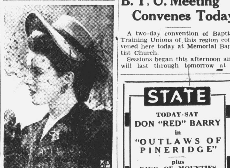
SUIT BONNET —This light suit bonnet of soft grey flannel has fine-meshed diamond-patterned veiling. Ear clips matching the corsage branch of diamonds and