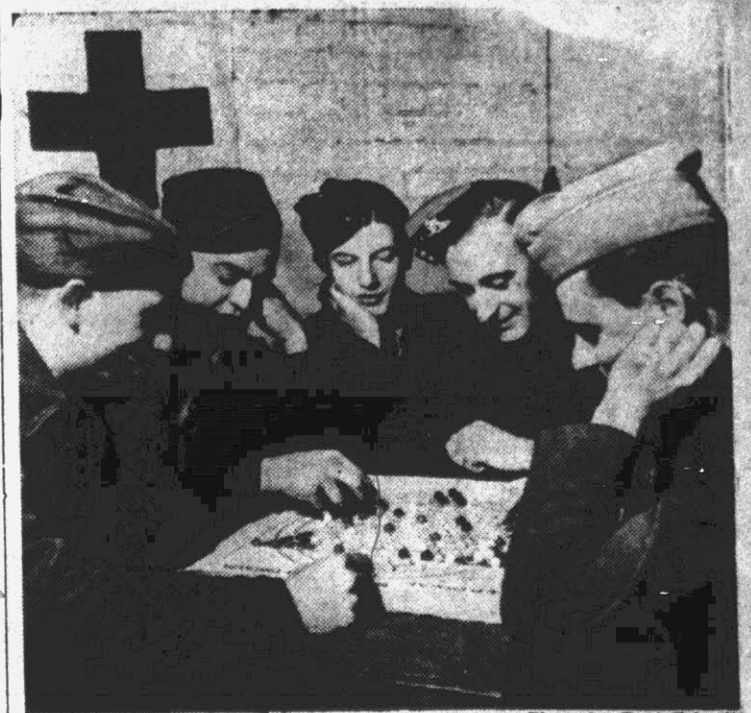
TIME OUT FOR PLAY—United Nations soldiers find relaxation from war over a game of Chinese checkers at a Red Cross club in Great Britain. Scenes like this are duplicated daily at Red Cross service clubs in Australia, the southwest Pacific islands, Iceland, and numerous other places where U. S. troops are stationed.

CORNER-STONE LAYING AND RALLY DAY POSTPONED The Corner-Stone laying Rally day at Pitt county Training school in Grimesland scheduled for the third Sunday in March will be the first Sunday in April. This will give a longer time for the schools and communities to get their quota that was planned for the bus. This program was postponed due to bad weather. It is hoped that a greater effort on the part of our