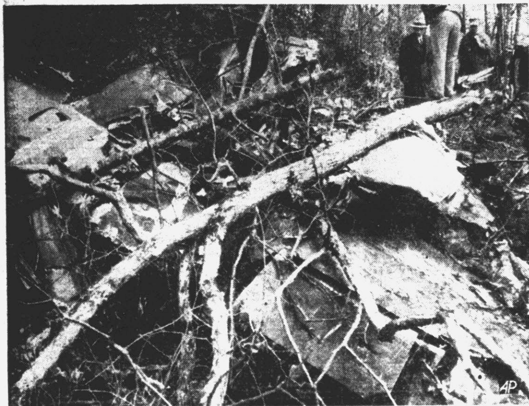
A 16-year-old mountain boy discovered this wreckage of an army bomber, missing 12 days from the Greenville Air Base, scattered in an isolated mountainside area 22 miles north of Walhalla, S. C. Spectators view the wreckage, among which was found the bodies of the plane's five crew members. The plane disappeared on a routine flight March 10.