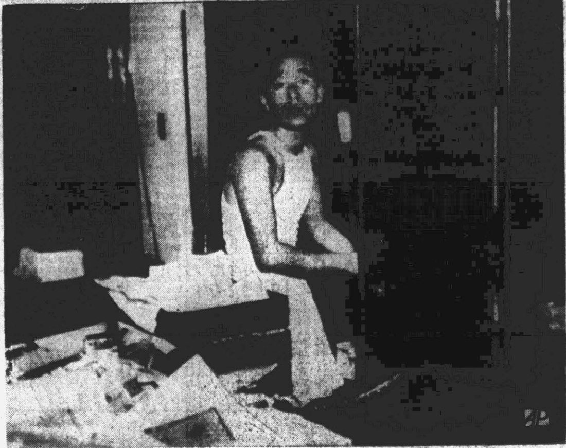
The above picture, titled "Caught With Pants Down," was good enough to gain a first place tie in the first national newspaper contest conducted by the Associated Press newspapers. George Kotalik, a Chicago Times staff photographer, entered the usual photo, which shows an attaché of the Japanese consulate in Chicago, clad only in his underwear, as he was surprised in the act of cleaning out papers from a cabinet on the day of the Pearl Harbor attack.