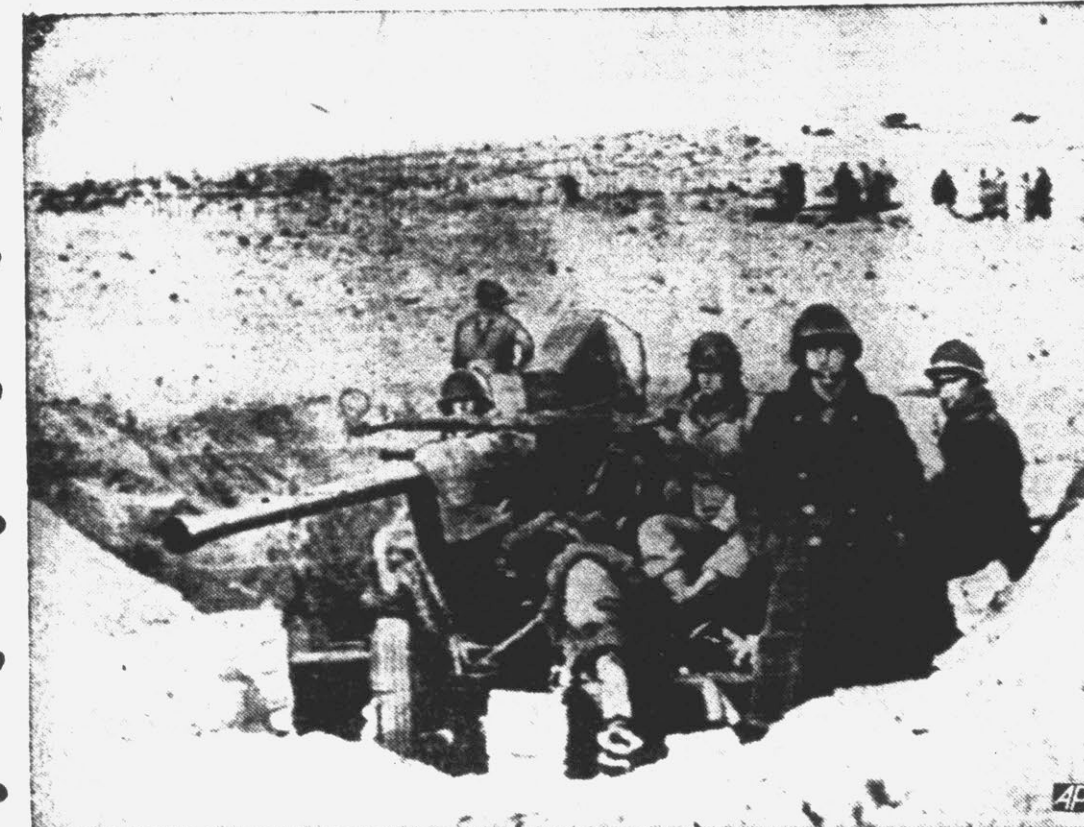
This picture of a U. S. gun crew was made during the Allied drive on Gafsa March 17-18 and is one of the first transmitted by a newly opened U. S. Army Signal Corps radiophoto circuit linking Algiers and the War Department at Washington. Transmission time from Algiers to Washington was seven minutes.