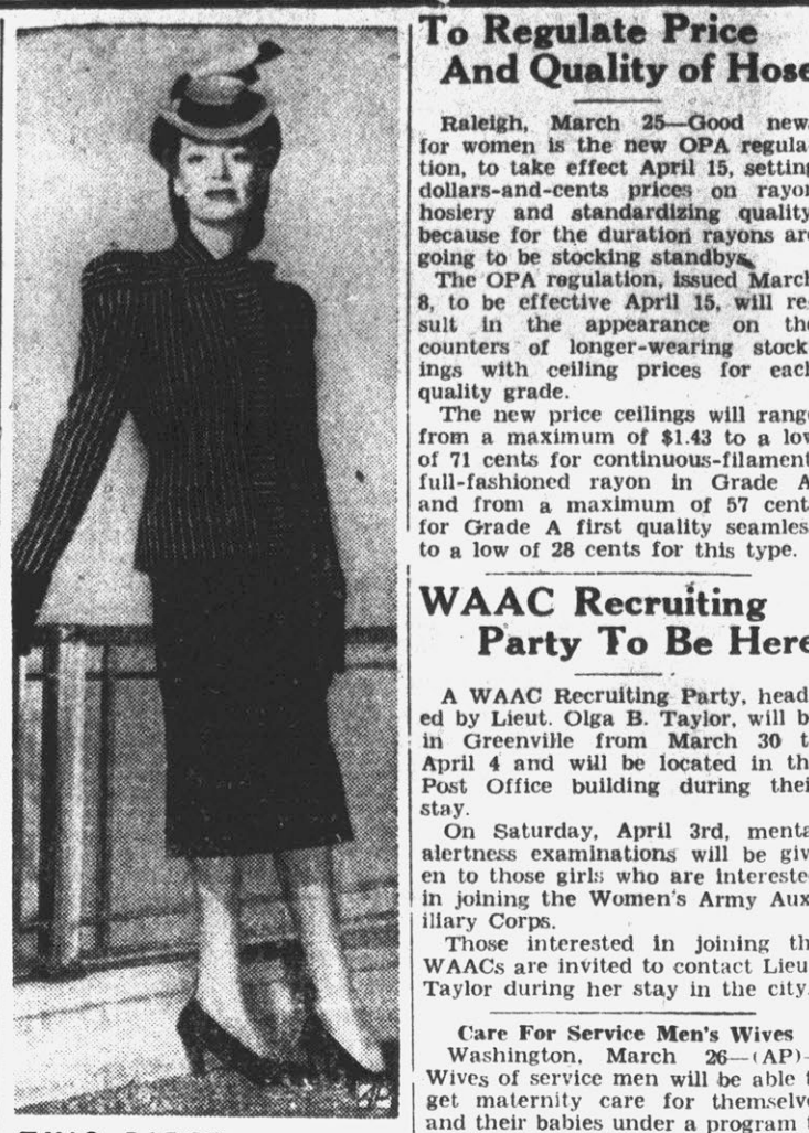
TWO PIECE —This two-piece outfit of black and white striped woolen jacket and black woolen skirt was shown with a spring collection in New York City.