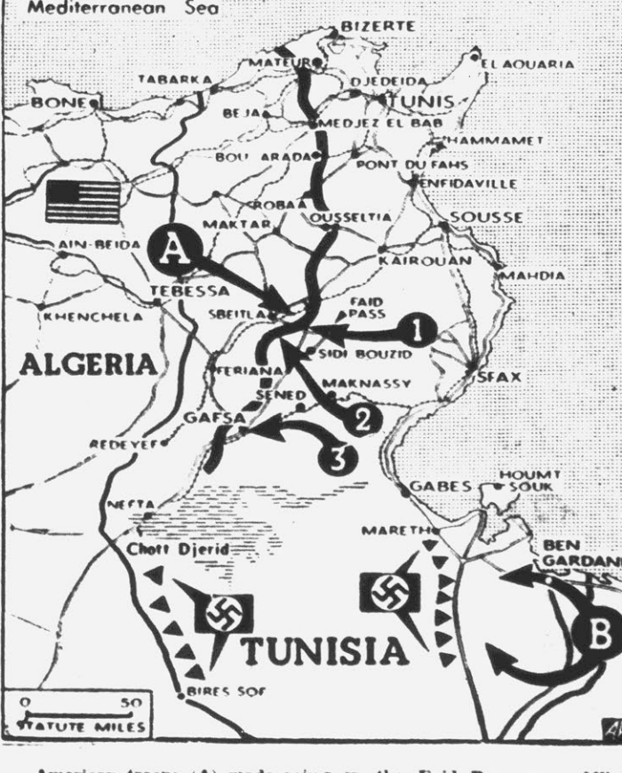
American troops (A) made gains in the Faid Pass area, Allied Headquarters in North Africa announced after acknowledging German columns had earlier made some gains near the pass (1), pushed beyond Sidi Bouzid (2), and seized Gafsa (3). The British Eighth Army (B) pressed beyond captured Ben Gardane into Tunisia, threatening the southern anchors (symbols) of the Axis corridor. Heavy black line is the approximate front.