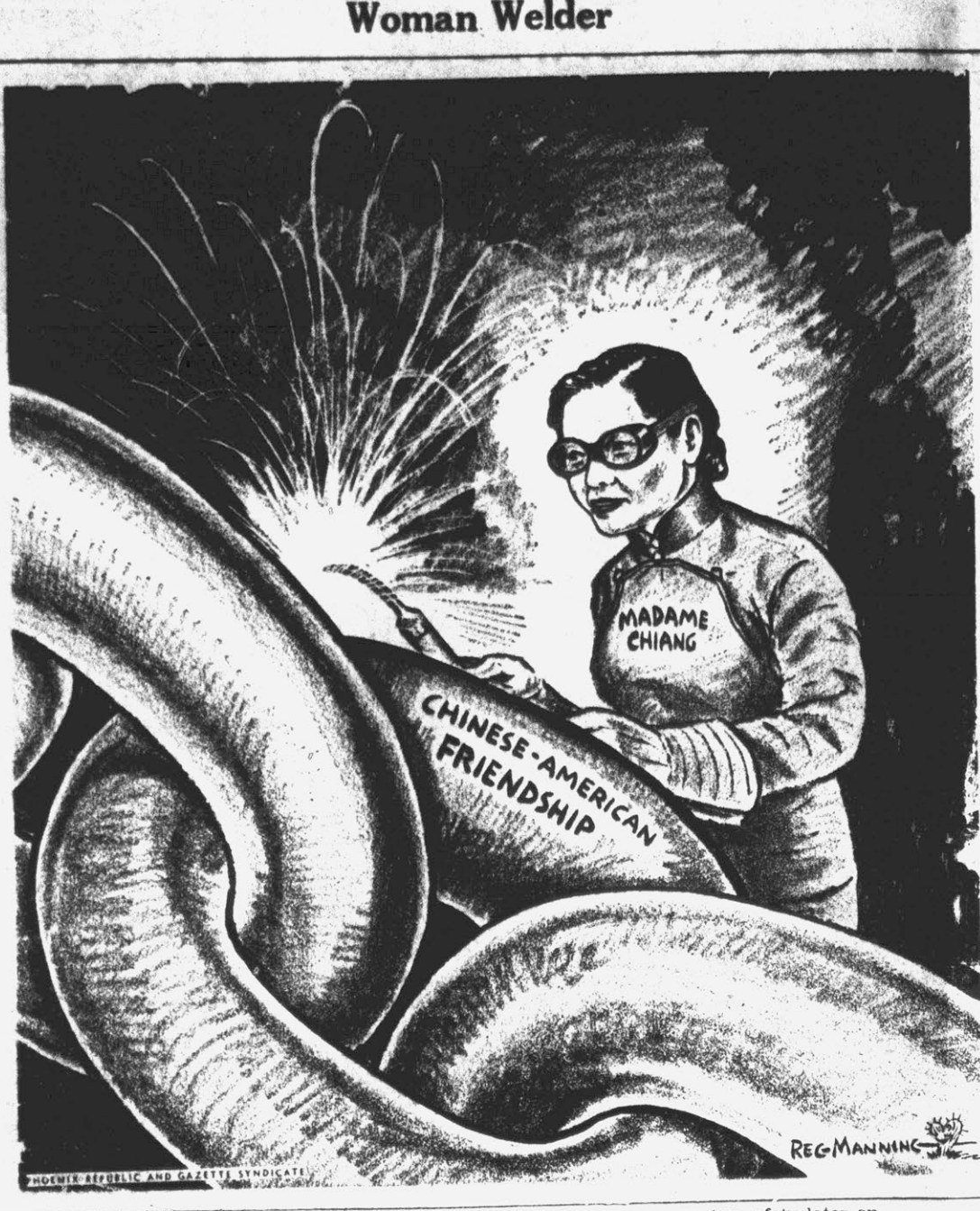
Woman Welder. The Associated Press is exclusively entitled to use for publication of all news dispatches credited to it or otherwise credited to this paper and also the local news published herein.

Recent news stories warn of wage increase demands by coal miners, railroad employees, and others.