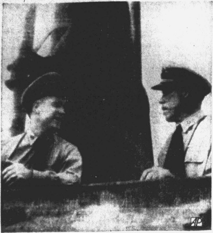
Lt. Cmdr. Dudley W. Morton of Miami, Fla., (right) commanding officer, and Lt. Richard H. O'Kane of Durham, N. H., on the bridge of their submarine, the U. S. S. Wahoo, after their return to Honolulu where they reported sinking two combat ships and six auxiliaries. One of the ships, the y said, carried from 1,500 to 6,000 Jap troops, and was one of those bagged after a 14-hour chase of a Jap convoy of four ships, all of which the sub sank.