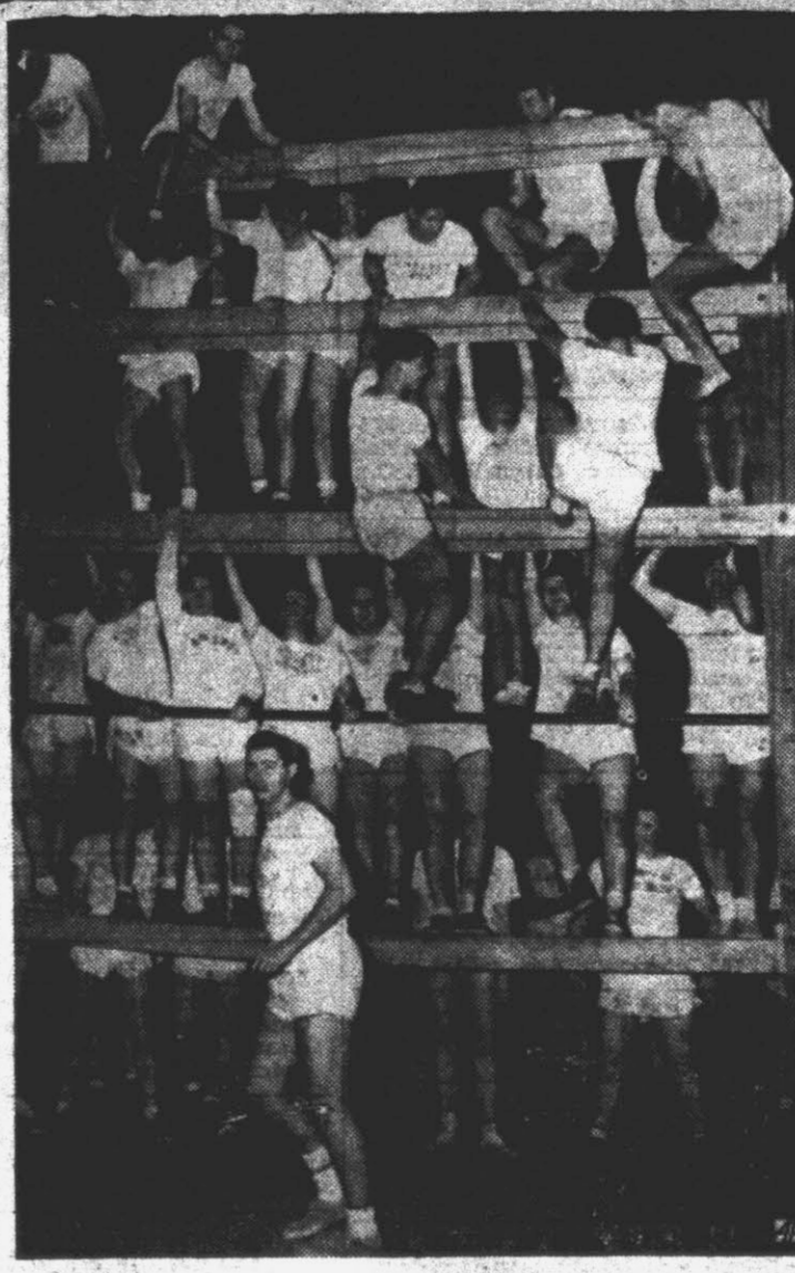
TOUGHENING UP —Future pilots for Uncle Sam's Naval air arm toughen up on this scaling ladder at Amherst, Mass.