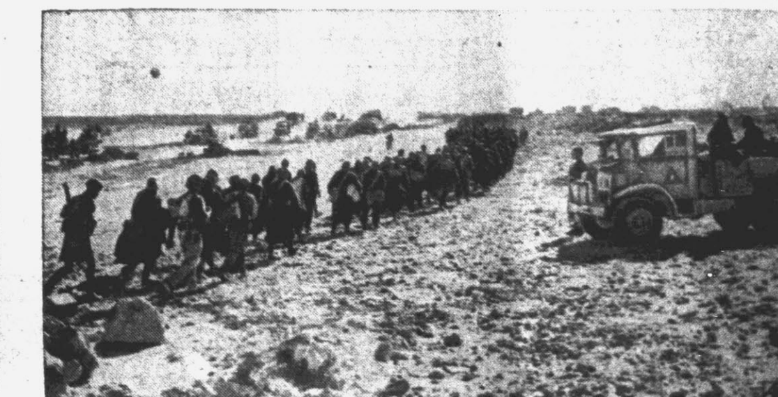
THE ROAD BACK—Weary Axis prisoners of Rommel's army trudge toward the rear after being captured by advancing British troops in Libya.