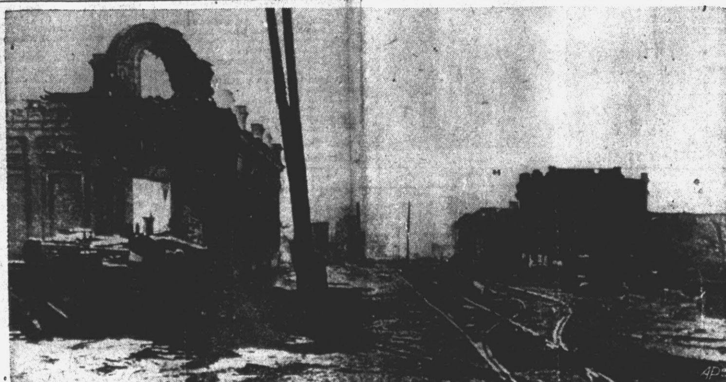
Except for two German soldiers beside a wrecked tank at the left this section of Stalingrad presented a scene of lifeless desolation when a Nazi photographer made this picture in October. Since that time, the Russians have begun their current offensive and are reported gradually pushing the Germans westward. This picture reached the United States via neutral Portugal.