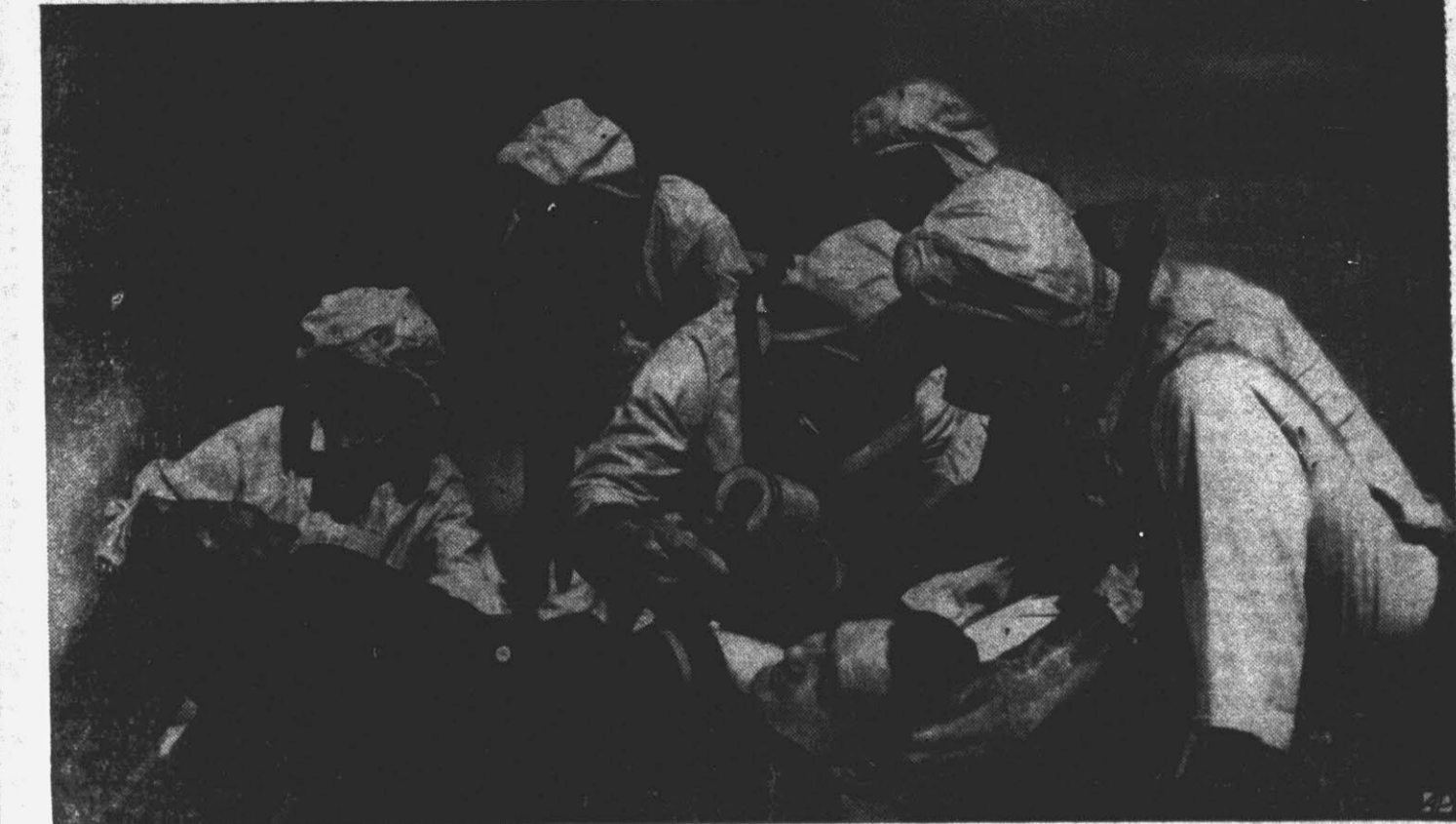
PRACTICE RESCUE IN CHEMICAL WARFARE—Against a background of smoke Coast Guard officers wearing protective clothing, gas masks and rubber gloves, demonstrate rescue work during chemical warfare training.