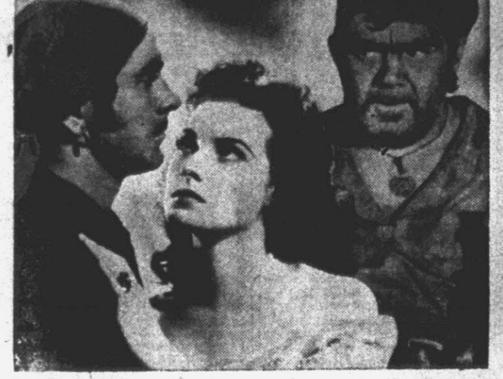
Scene from Rafael Sabatini's "Black Swan" pictures Tyrone Power, Maureen O'Hara and Thomas Mitchell. Film opens at the Pitt Sunday.