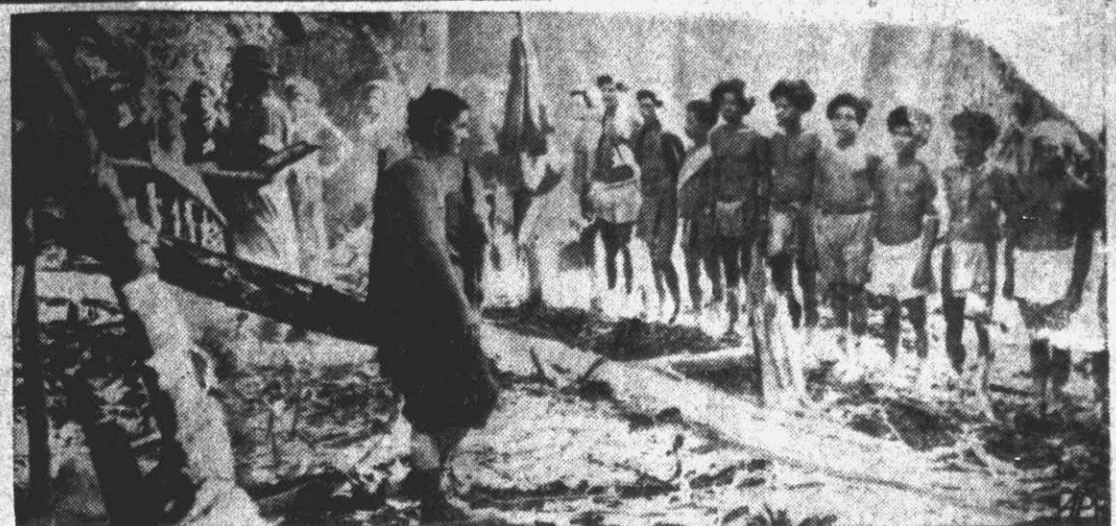
EVERY DAY IS PAYDAY—For these New Guinea natives lined up at the end of a day's work for the American army every day is payday. They help fight the Japs.