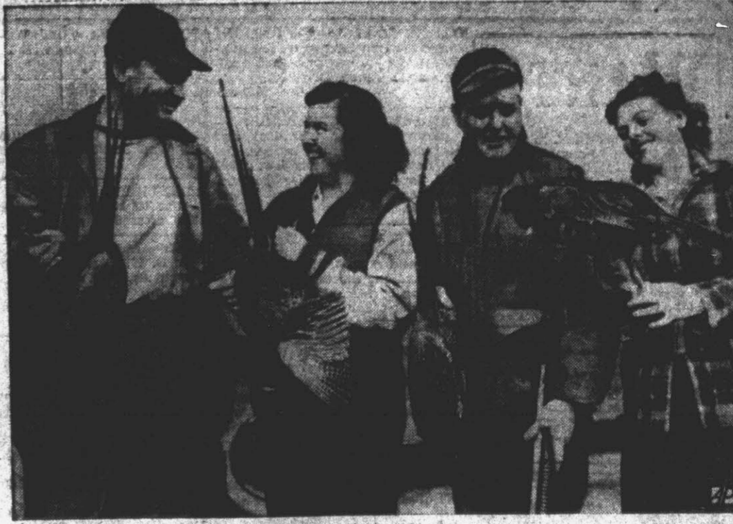
BASEBALL HELPS THEIR AIM — Giants' Johnny Mize and Phil's St Johnson show pheasants shot in Illinois to wives. Left to right: Mize, his wife, Johnson, his wife.

Hitler's Lines . . . (Continued from Page One) igation port on the Don river, and the railroad station of Krivomyskaya, few miles southeast of Kalach. Kalach is about 50 miles west of Stalingrad.