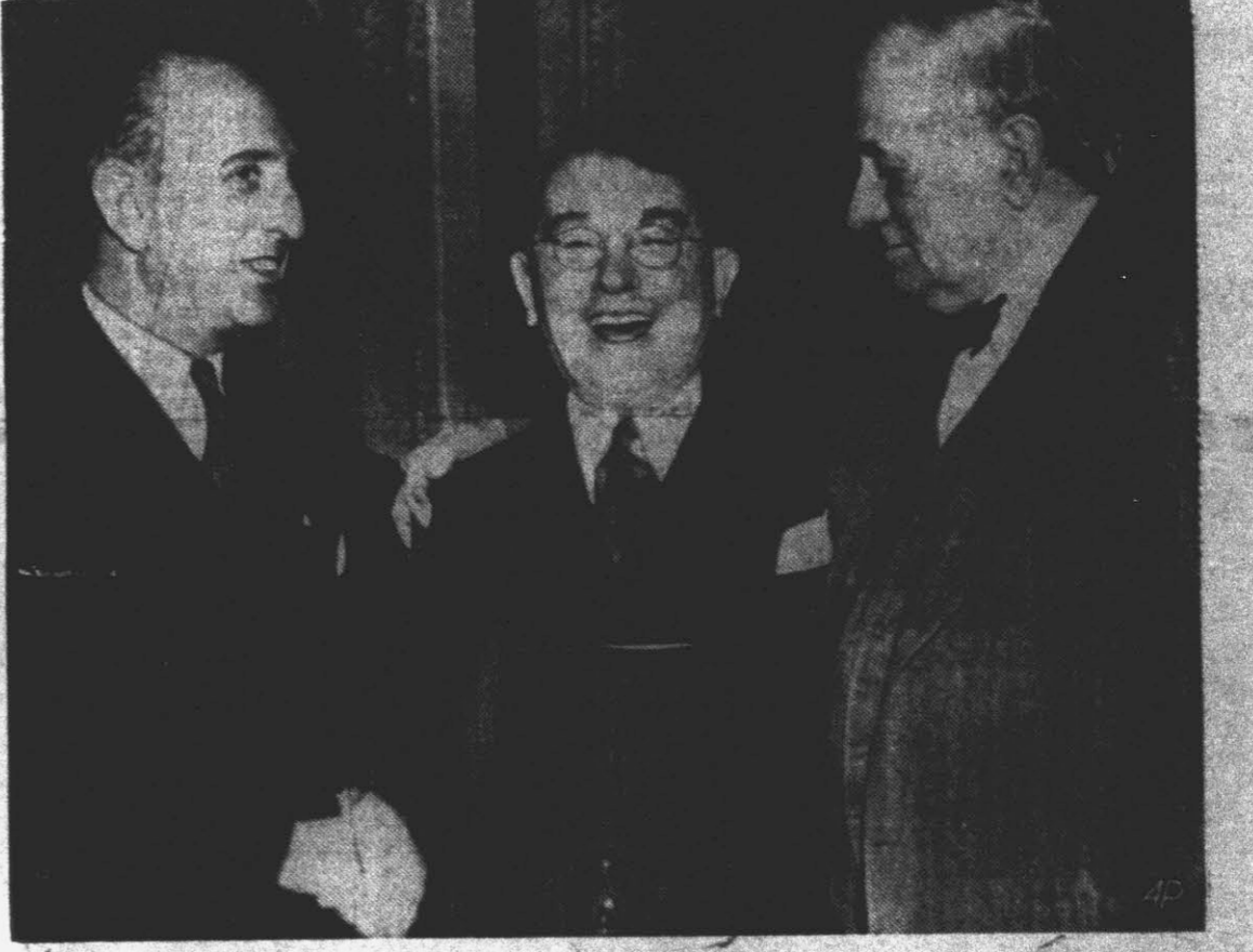
Senators Richard B. Russell (left), Democrat of Georgia; Kenneth McKellar (center), Democrat of Tennessee; and Tom Connally (right), Democrat of Tex., meet in Washington and chuckle over the success of their tactics which again prevented senate action on the anti-poll tax bill. Russell and Connally spearheaded the onslaught on the bill by the southerners. McKellar bitterly assailed Senator Barkley of Kentucky, senate majority leader, for his stand on the bill, and withdrew his recommendation that Barkley be appointed to the United States Supreme Court.