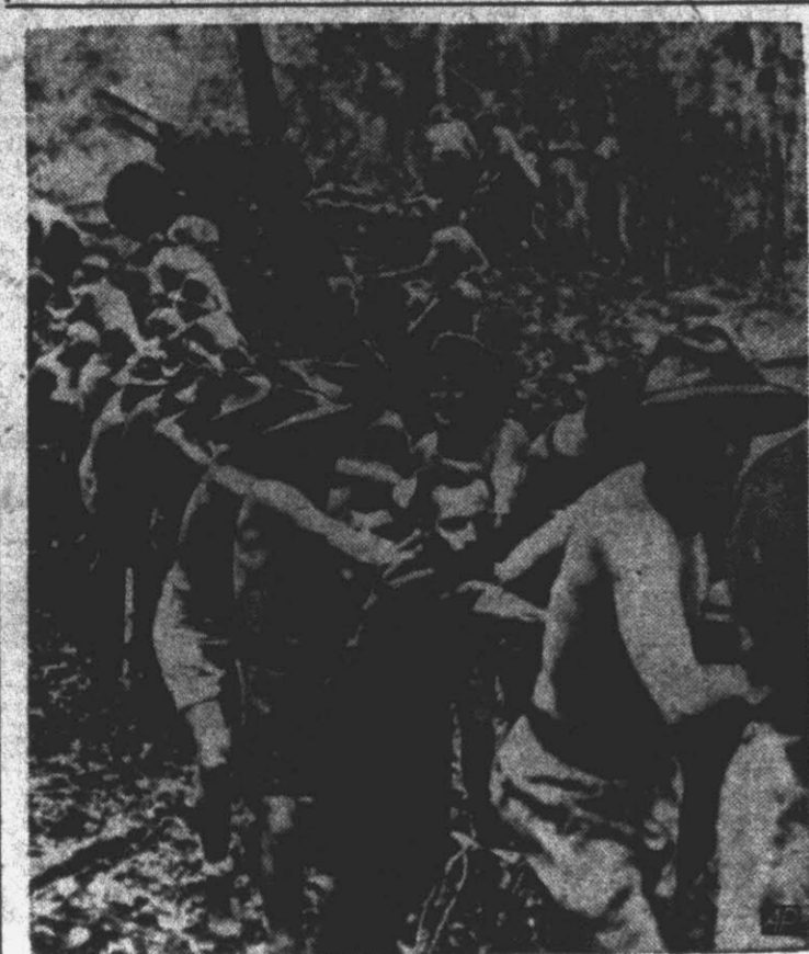
Moving heavy guns through the New Guinea jungle is a tough chore for Allied troops advancing toward the main Japanese base at Buna. Here, Australian soldiers tug on a line attached to an artillery piece as they work their way through the undergrowth. Another gun is in the background.