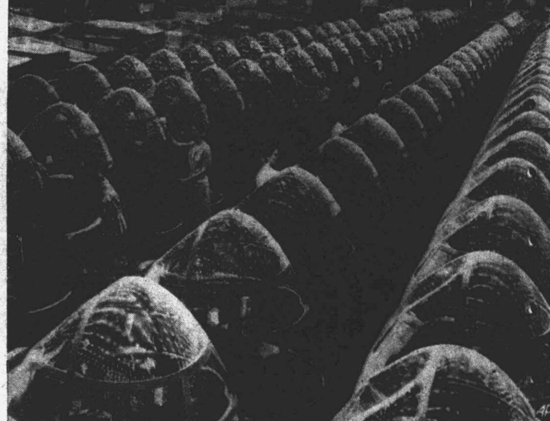
SHINY NOSES —Women workers in a Long Beach, Calif., aircraft plant tackle a new aspect of an old problem—shiny noses. They polish airplane noses.