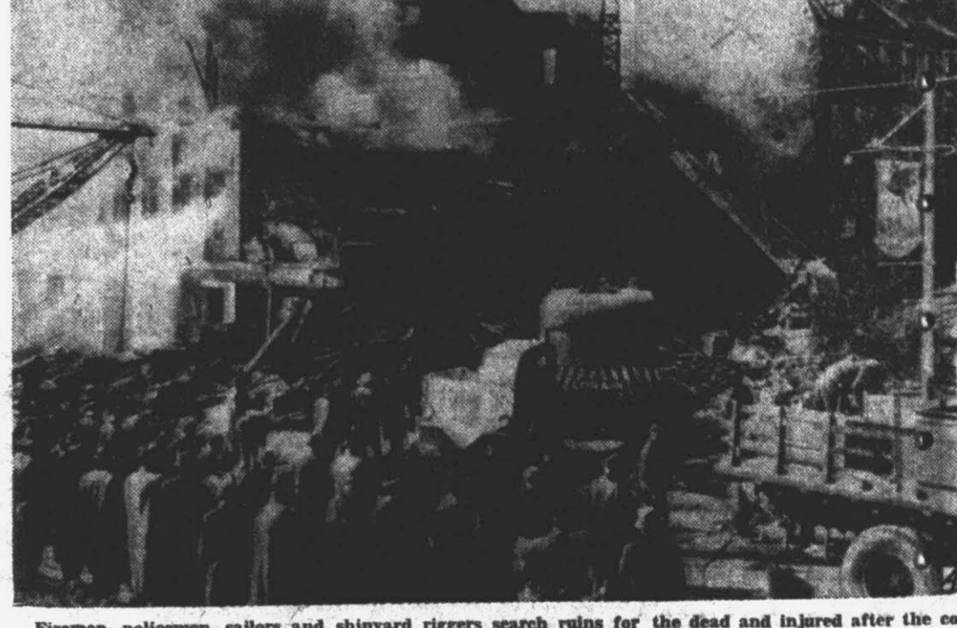
Firemen, policemen, sailors and shipyard riggers search ruins for the dead and injured after the collapse of a wall during a five-alarm fire in the Lyceum building at Boston, Mass., in which six firemen lost their lives and about 30 persons were injured. The roof also collapsed.