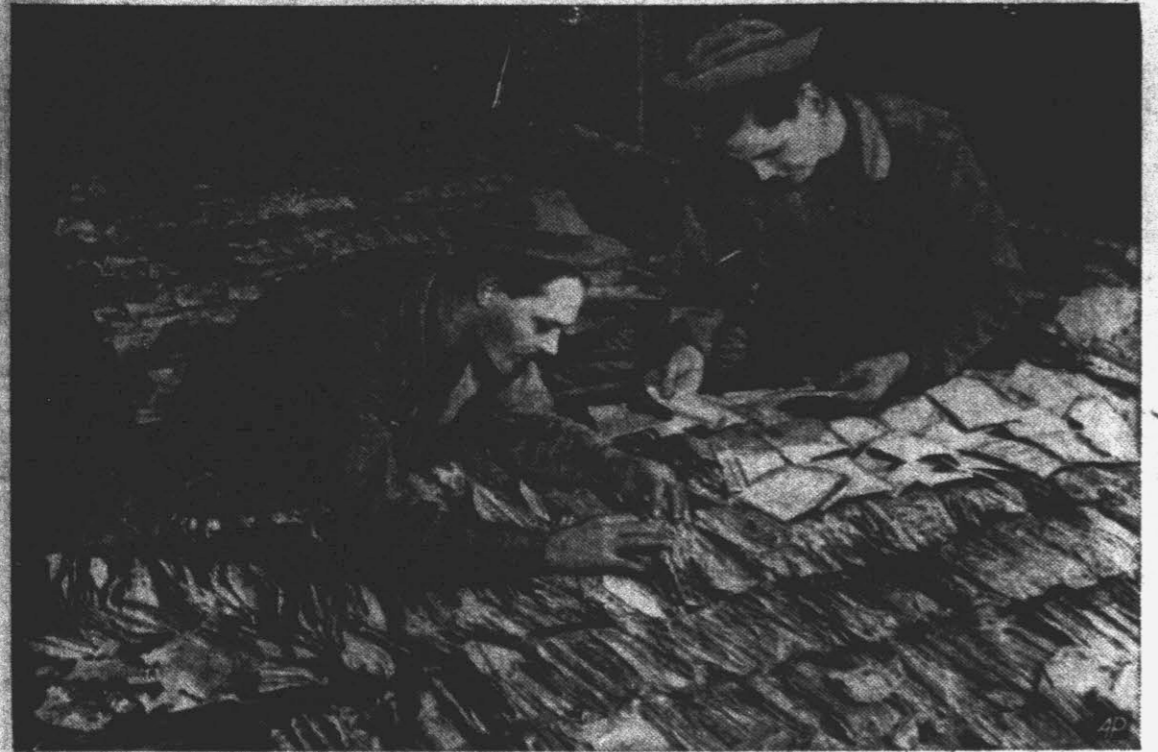
DRYING OUT PLANE-WRECKED MAIL —Two soldiers at the Port of New York embarkation Army post office dry out mail recovered from the sea after a plane crash.

A triple drive against Axis forces in north Africa is developing. One prong of the British push in Libya (striped arrows) by-passed Bengasi, which the Axis have abandoned, and reached Antelat to cut German and Italian stragglers between Bengasi and Agedabia. The main body of Gen. Rommel's Axis army headed for El Aghella (1) where he may try to make a stand. From Algeria, the American and British forces (shaded arrows) were advancing along the coast, and vanguards had smashed forward to within 30 miles of Bizerte and Tunis, last Axis strongholds in northern Tunisia. Meanwhile, Allied units also approached Tunis from Tebessa. A third prong of the American-British drive from the west headed across Tunisia toward Tripoli. The third drive in the general pincer campaign was being made by a strong force of Fighting French (black and white arrow), reported moving toward Tripoli from the Lake Chad area in French Equatorial Africa. Allied planes from Malta raided Tunis and shot down a plane over Sicily.