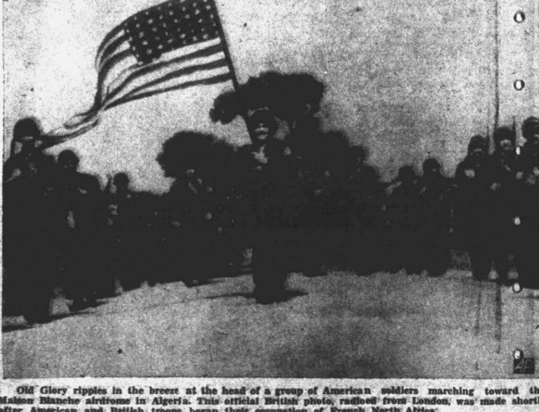
Old Glory ripples in the breeze at the head of a group of American soldiers marching toward the Makton Blanche airfield in Algeria. This official British photo, radioed from London, was made shortly after American and British troops began their occupation of French North Africa.