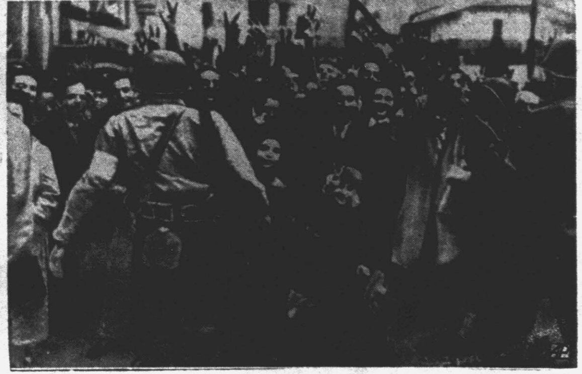
Residents of Algiers in French North Africa greet American soldiers with smiles and the "V for Victory" sign upon arrival of the troops at the opening of their campaign against Axis forces. This picture was radioed from London.