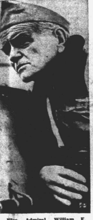
Vice Admiral William F. Halsey (above) commanded the United States Navy force which defeated and routed a Jap armada in the Solomons. Twenty-three Japanese ships were sunk. Here, Halsey peers from the bridge of his ship somewhere in the Pacific.