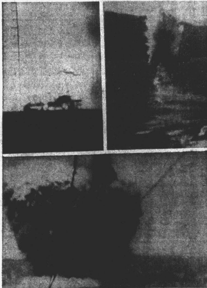
These three unusual pictures were made from British submarines attacking Axis supply lines at sea. Upper left: An Axis tanker, listing, is seen through the periscope of the British submarine which torpedoed her. The ship sank soon afterwards. Upper right: A torpedoed Axis ammunition ship, photographed from the conning tower of a British submarine at the moment she was struck by the torpedo. Note the wake of the torpedo. Bottom: An Axis ammunition ship explodes after being torpedoed. The submarine, from which this picture was taken, had come to the surface to attack the ship with shell fire if the torpedo had failed to do its work.