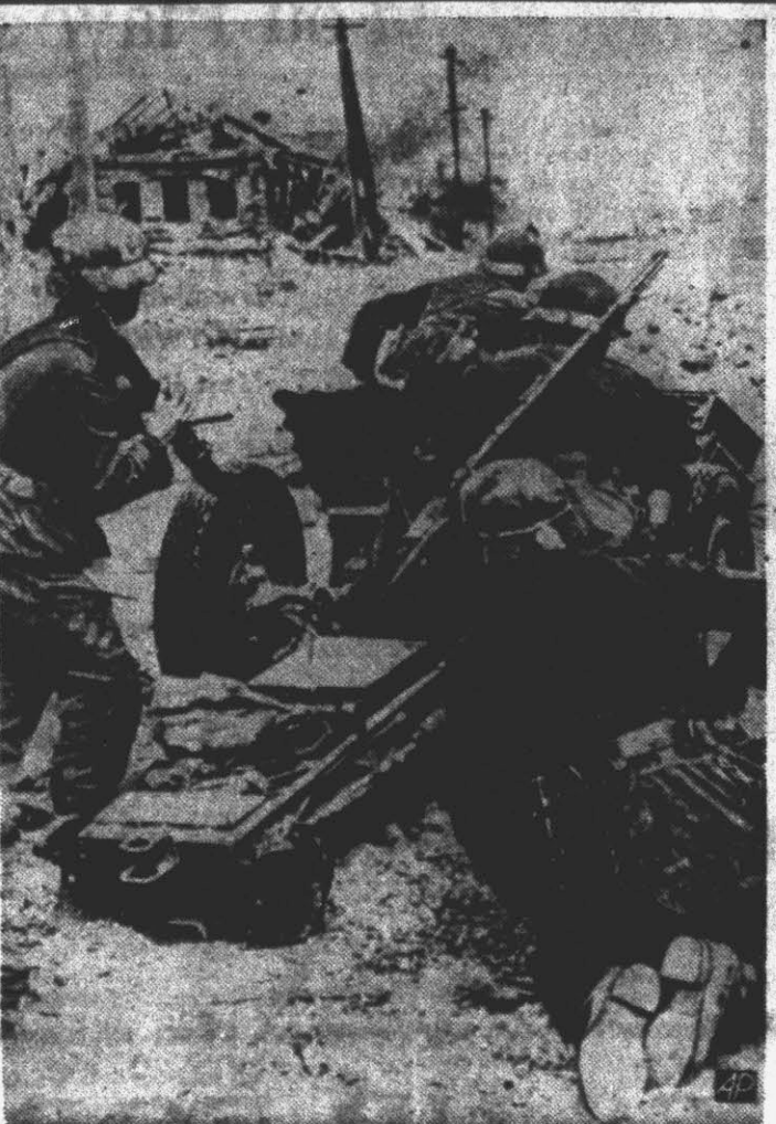
German soldiers move a light infantry gun to a forward position in the Stalingrad sector, according to the German caption accompanying this picture which reached the United States through neutral Portugal. Late dispatches report Russian troops beating off German attacks while besieged Stalingrad while a frigid wind swept across the Steppes.