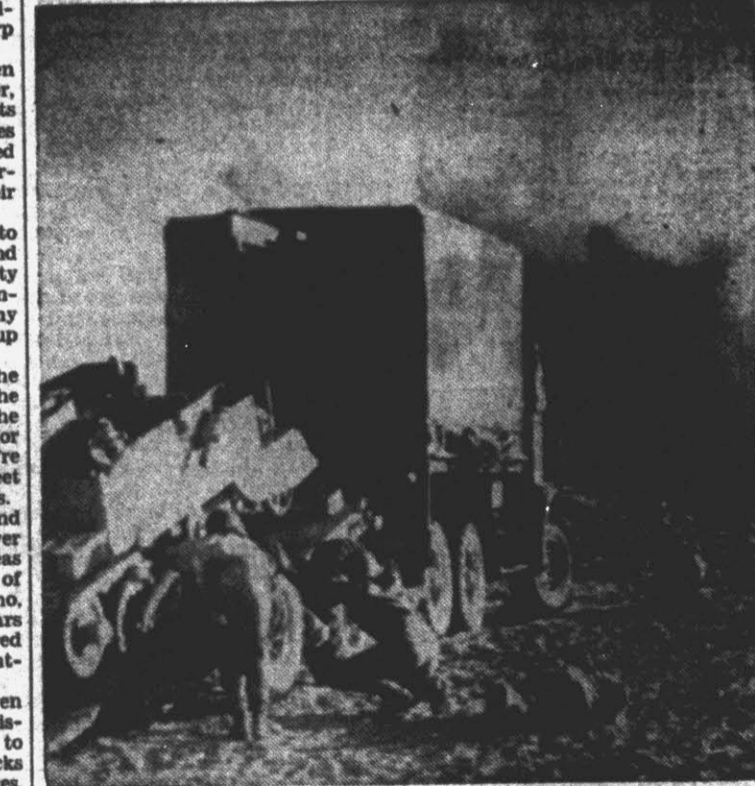
As a shell explodes nearby, a salvage crew of the Australian forces in Egypt rescues a damaged gun carried for rushing to the rear for a quick repair job. Photo was made just before current victorious drive opened.