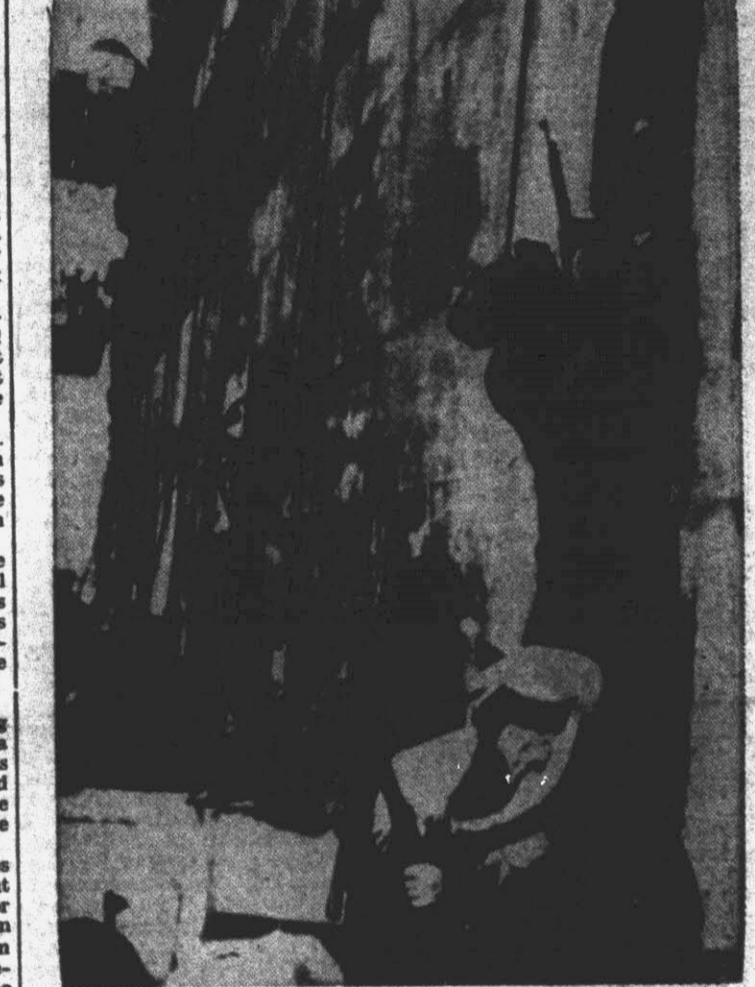
Carrying full packs, American troops board a transport at an embarkation point somewhere in Great Britain, their destination French North Africa.