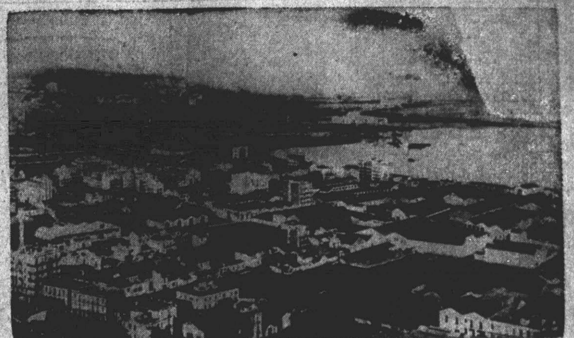
This is a view of the waterfront of Algiers, capital of Algeria, one of the French territories in northwestern Africa, which has surrendered to American forces. Algeria borders the Mediterranean and Sunday was reported to be one of the focal points of the greatest United States efforts of the war to date.