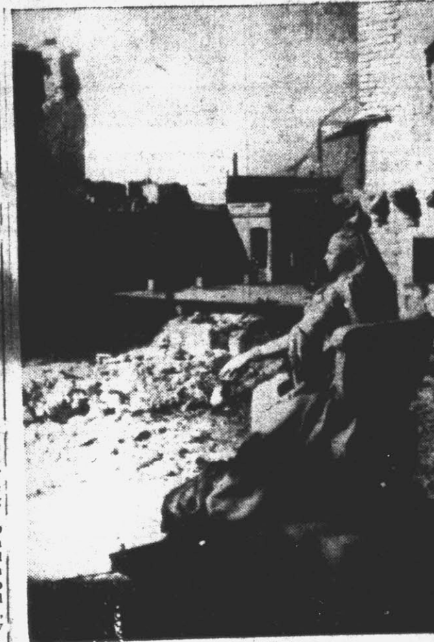
Untouched by bombs which have laid surrounding buildings in ruins, the statue of Great Britain's Queen Victoria, a symbol of England's empire, sits serene in Valletta square in Malta. Malta has withstood more than 2,000 Axis air raids and is still going strong.