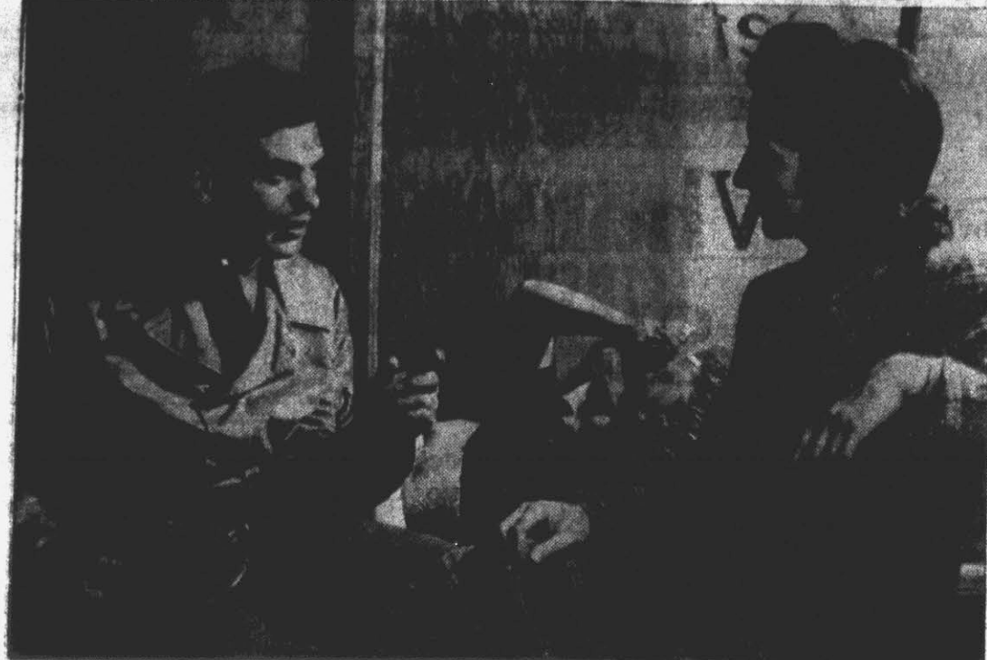
Sometimes it is not the soldier, but his sick wife, who needs a friend, who has followed him to a camp town where she knows no one. But the soldier knows where to go for help in time of trouble. There is always the director of the USO club, who will listen and give valuable advice. USO is seeking $22,000,000 to operate 900 clubs and units next year.