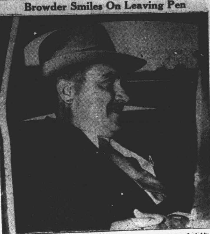
Communist party leader Earl Browder leans back comfortably in an automobile as he leaves the Federal penitentiary in Atlanta—a free man—his prison term cut short by President Roosevelt. The President's commutation came after Browder had served approximately 14 months of a four-year sentence for passport fraud.