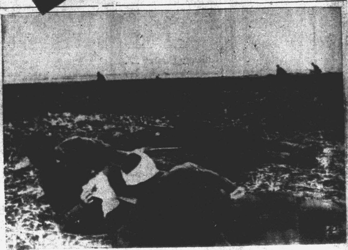
Moscow sources described this radiophoto as showing a Russian infantry attack in the "Kharkov direction." The woman facing the camera in the foreground is identified as Nurse Olga Ustupova, credited with rescuing 43 wounded men from battlefields. Here, she is attending another wounded soldier. The picture was radioed from Moscow May 18.