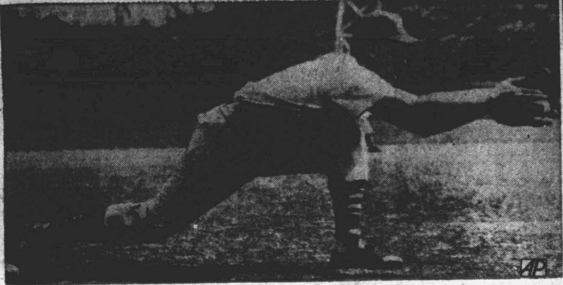
Bob Elliott, who broke into baseball six years ago at Savannah, Ga., demonstrates his technique in stretching for a wide one at third after he was assigned to that spot with the Pittsburgh Pirates by Manager Frankie Frisch. He was moved in from the outfield. Besides sparking fielding, Elliott has smacked three homers and two triples in nine games.