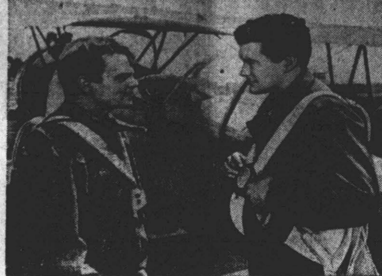
James Cagney and Dennis Morgan are shown here as members of the Canadian air force in the technicolor production "Captains of the Clouds" opening Sunday at the Pitt.