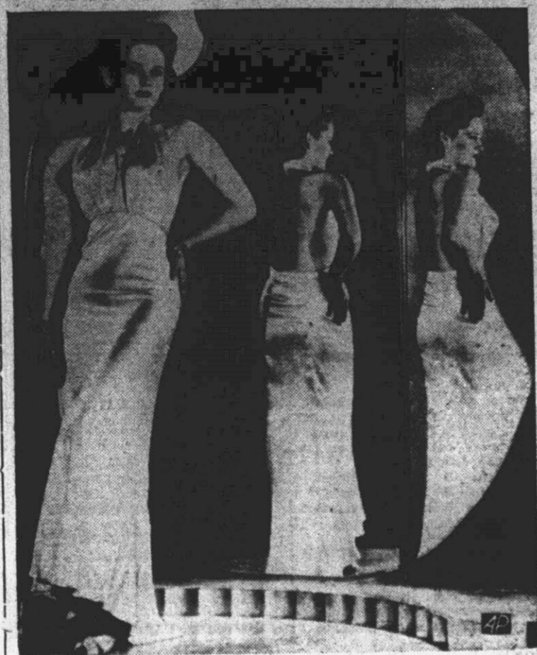
Posing before a double mirror to display all angles, film actress Alexis Smith shows it's possible to dress for the evening and at the same time conserve material in conformity with war time shortages. Her gown was styled by M'rs. Anderson, Warner brothers studio stylist to use only 17 and a quarter yards of goods instead of the seven usually required.