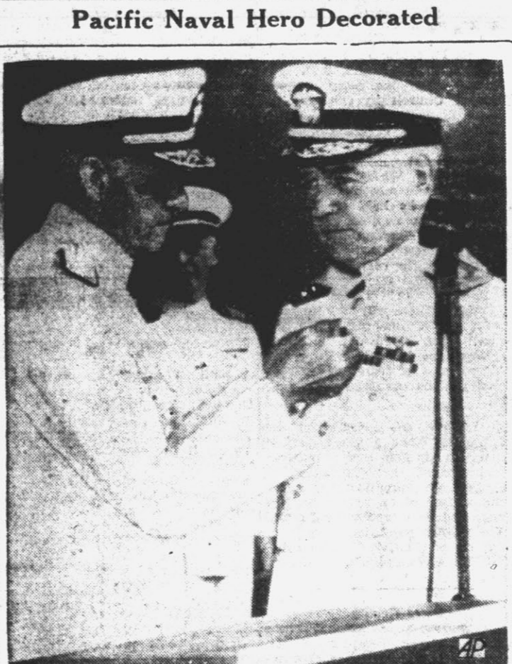
Vice Admiral W. F. Halsey (right) led the U. S. naval force that attacked the Japanese-held islands of Wake and Marcus, striking within 200 miles of Tokyo. He stands aboard an aircraft carrier at Pearl Harbor while Admiral Chester Nimitz (left) pins on his chest a distinguished service medal for leading earlier raids on Jap bases in the Gilbert and Marshall Islands.