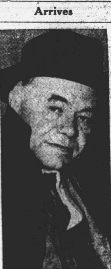
Unannounced and traveling since last Beaverbrook, the British lease-lend co-ordinator, arrived in Washington by plane on a mission that may have far-reaching effects on the world's battlefields. He is leaving the airport in an automobile.