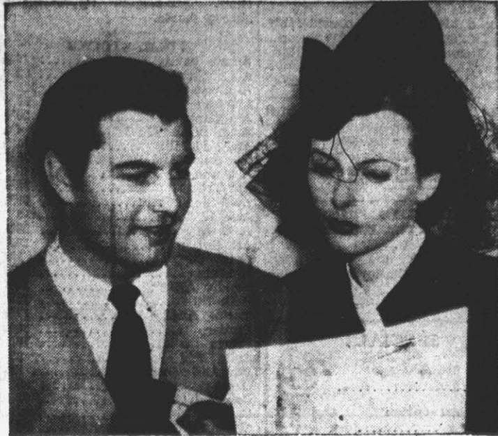
Hedy Lamarr of the movies and George Montgomery, who came to Hollywood from a Montana ranch, announced their engagement, but the date of the wedding is not yet set. They are pictured as he visited her recently on a film set.