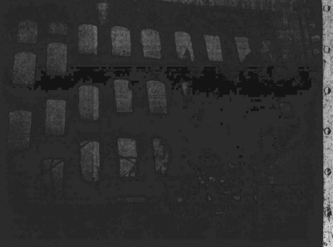
Only the walls were left standing after fire swept through the Melvin Hall apartment house at Lynn, Mass., leaving 13 persons dead, 21 in hospitals and eight others missing. Firemen with ladders can be seen entering the ruins in search of bodies.