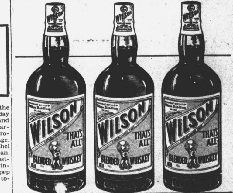
Wilson Distilling Co., Inc., Bristol, Pa. Blended Whiskey, 66.9 proof 70% grain neutral spirits