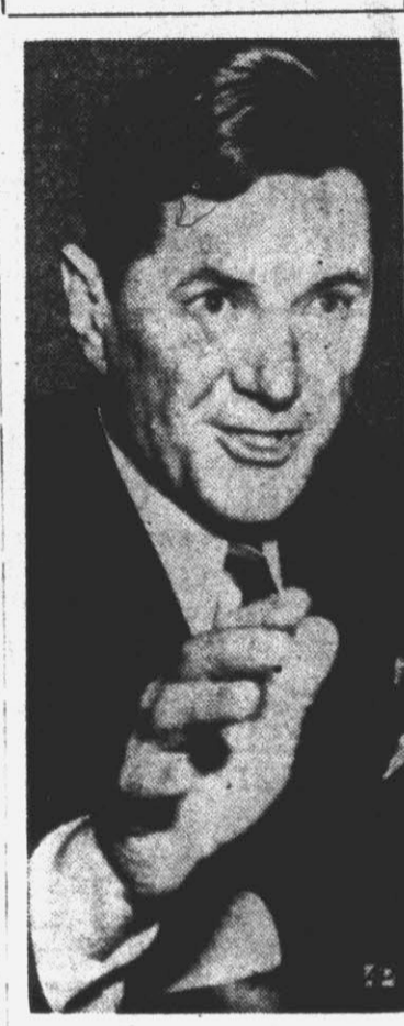
South Carolina's new United States senator, Burnet R. Maybank, appeared before a senate judiciary sub-committee in Washington, November 23, and testified in support of a bill by Senator Tom Connally (D-Tex.) to authorize the government to take over defense plants tied up by labor disputes.