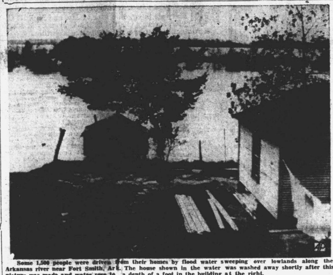
Some 1,500 people were driven from their homes by flood water sweeping over lowlands along the Arkansas river near Fort Smith, Ark. The house shown in the water was washed away shortly after this picture was made and water rose to a depth of a foot in the building at the right.