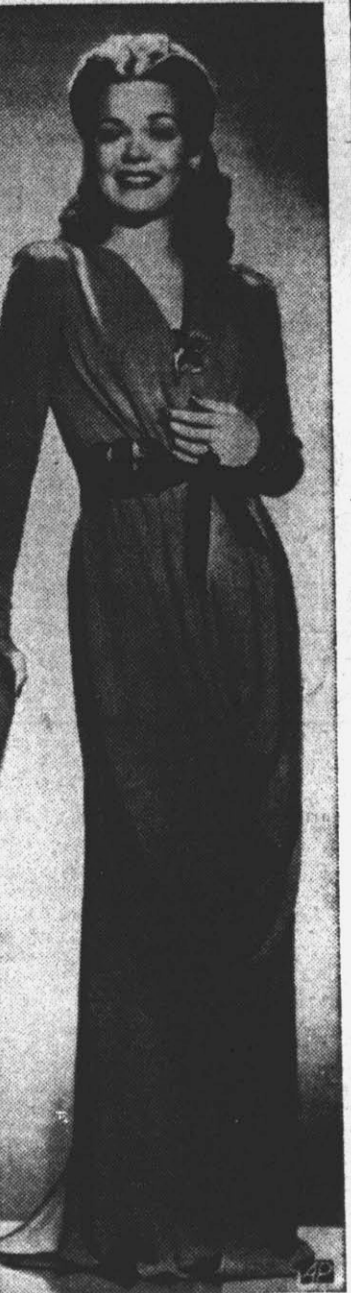
MODISH—In this long-sleeved robin's egg blue formal worn by Jane Wyman, graceful front drapery is an interesting detail. Gold kid belt ties with wide grosgrain ribbon.

derland. There was adventure galore on the trip to Treasure Island with Jim Hawkins and Long John Silver, and being marooned on a lonely island with the Swiss Family Robinson was actually fun. There is no end to the exciting experiences of the Campfire Girls and the over Boys. History and geography were most interesting, when stories of people and places studied were dressed up in bright picture books. Books are good companions for every boy and girl.