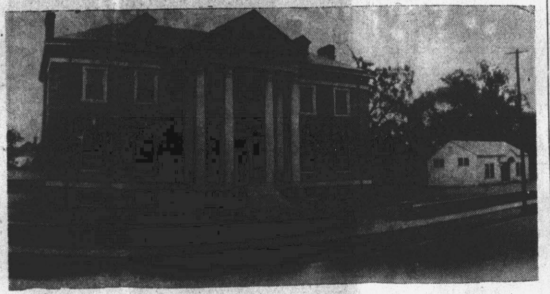
Pictured above are Greenville's Sheppard Memorial Library and the small library building used for some time prior to and during the erection of the present handsome library building.