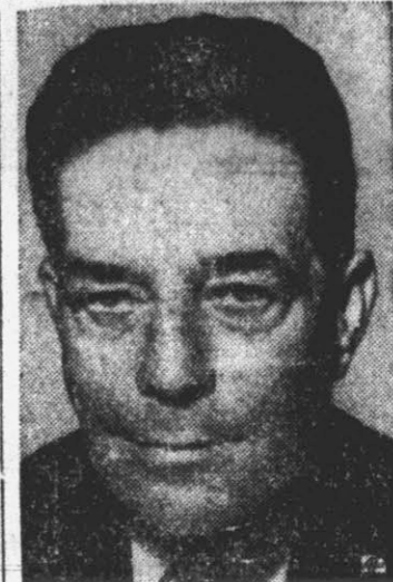
WATCHES—As camp controller general of the U.S., Lindsay Carter Warren's job is to see that government money moves straight down the legal line chalked by Congress.

But they are not going to be easy to find. Greenland has many thousands of miles of coastline. Much of it is merely shown on a map. Depths of harbors, ice conditions, are not generally known. The United States coast guard recently sent expeditions up that way. They reported back that winter cruising around Greenland was not any more hazardous than anywhere else in the North Atlantic, except for the need for a constant lookout for