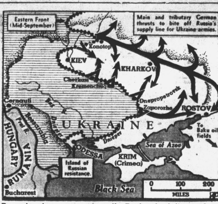
Progressive pincers movement—can the Russians break it up and save their oil fields?

short. Both the Russian and German armies need rest. Neither may be capable of a sustained offensive just now, like the beginning Nazi drive, or a counter offensive such as the Russians have started in the center. As a matter of fact, slow progress of the Russian counter punches indicates that the drive is more of an attempt to relieve pressure elsewhere than the start of a fullfledged counter-attack.