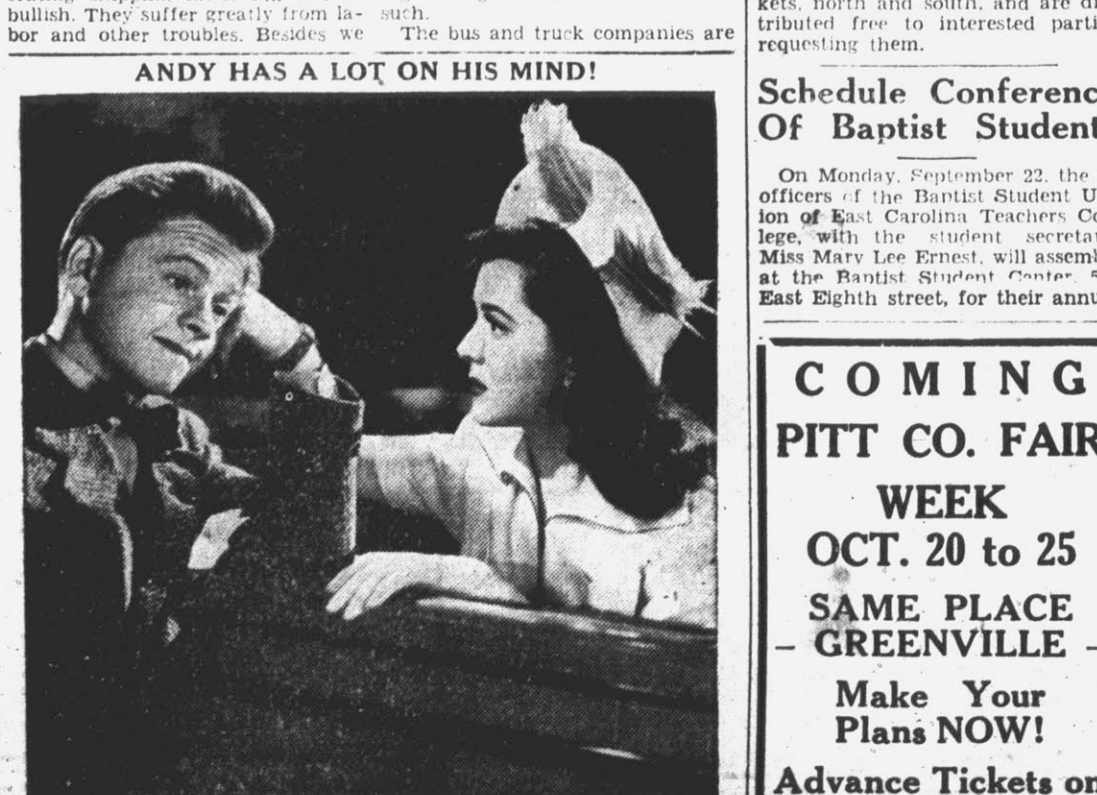
He's off to Broadway and Judy's right on his trail in "Life Begins for Andy Hardy," with the Hardy family, opening Pitt Sunday.