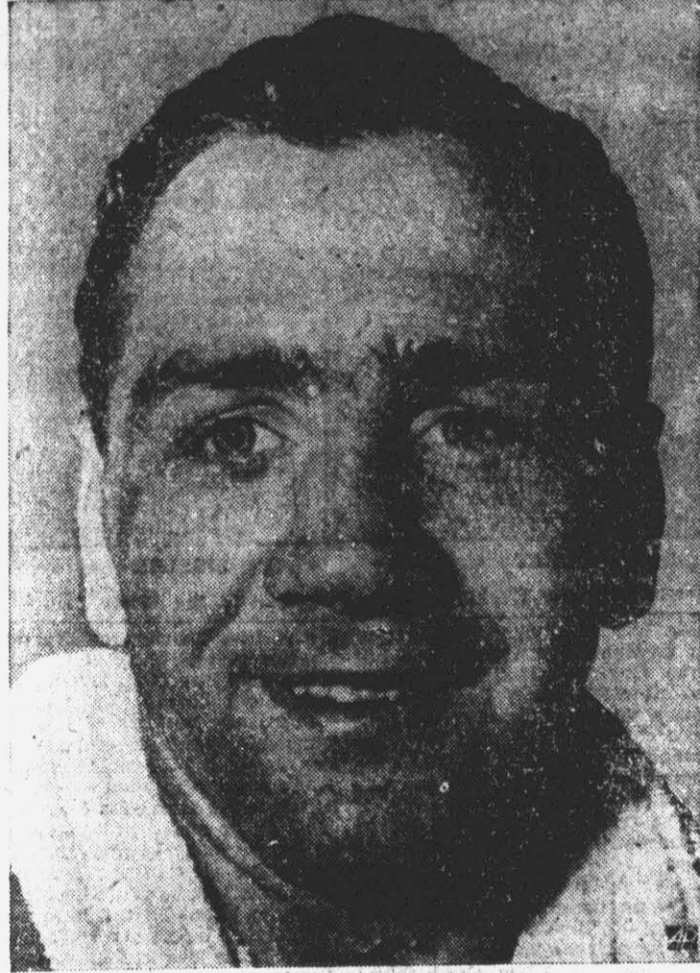
SWEAT OF HIS BROW —Gus Lesnevich of Cliffside, N. J., grins happily after winning the light-heavyweight title in New York from Tami Mauriello of the Bronx. But he got crown on points by a slim margin, so a return bout may be scheduled.