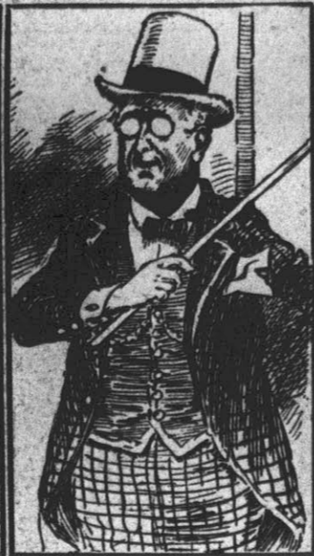
SPIELER Berryman in the Washington Star