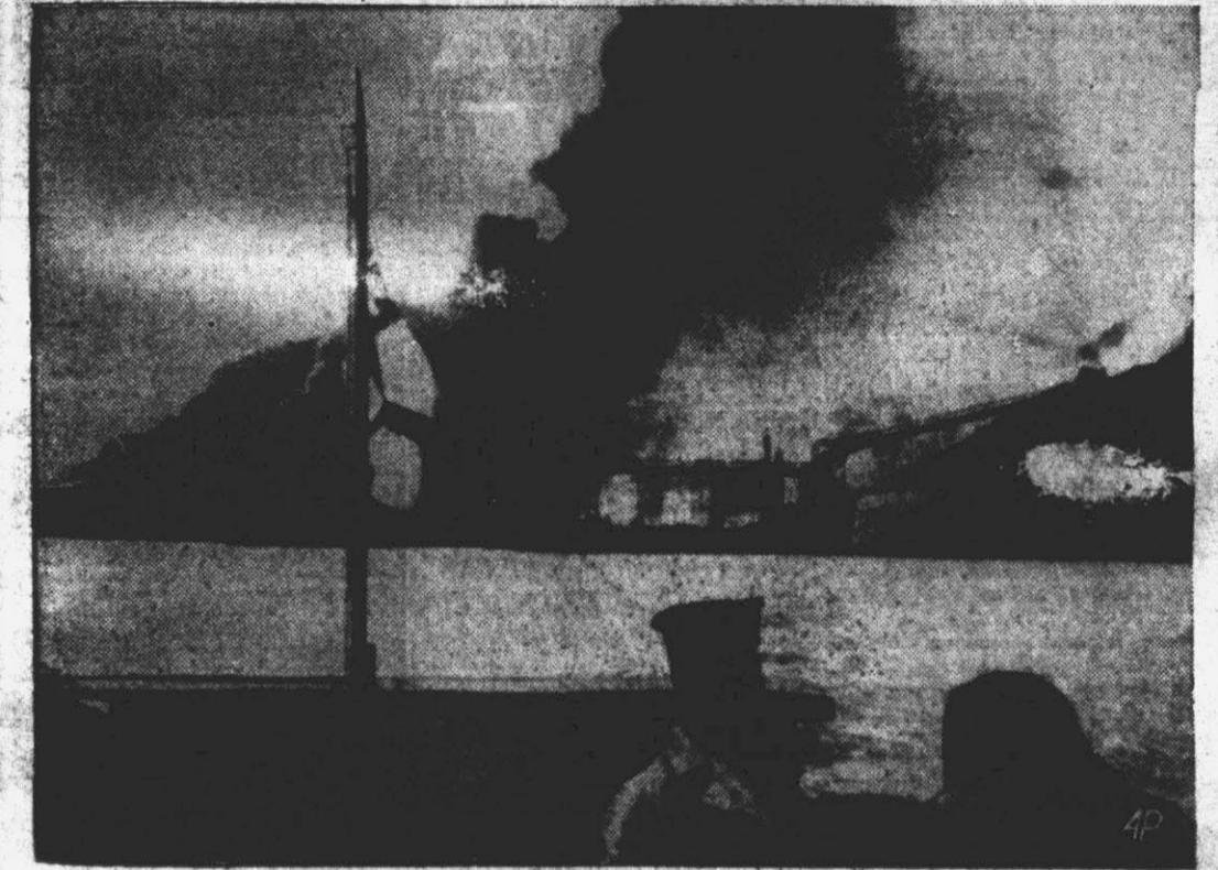
British sources say this picture shows coal and oil dumps blazing in Spitzbergen after a British, Canadian and Norwegian expeditionary force occupied that Arctic island and set fire to fuel production facilities to prevent them from falling into German hands.