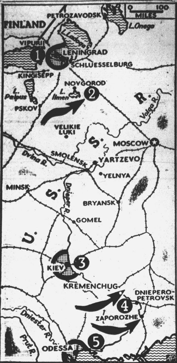
This map illustrates late developments in the Russo-German war. Russians claimed victory in a big night tank battle in the Leningrad area (1), but the Germans announced the defeat of three entire Russian armies south of Lake Ilmen (2). Moscow said fortifications of Kiev (3) had stood the test of fire. Germans claimed the seizure of unspecified bridgeheads on the lower Dnieper river (4) where arrows indicate previous German pushes. Odessa (5) was still holding out under siege.

New York Cotton New York, Sept. 17.—(AP)—Cotton futures opened four to seven lower. Late afternoon prices were up 16 to 22 points.