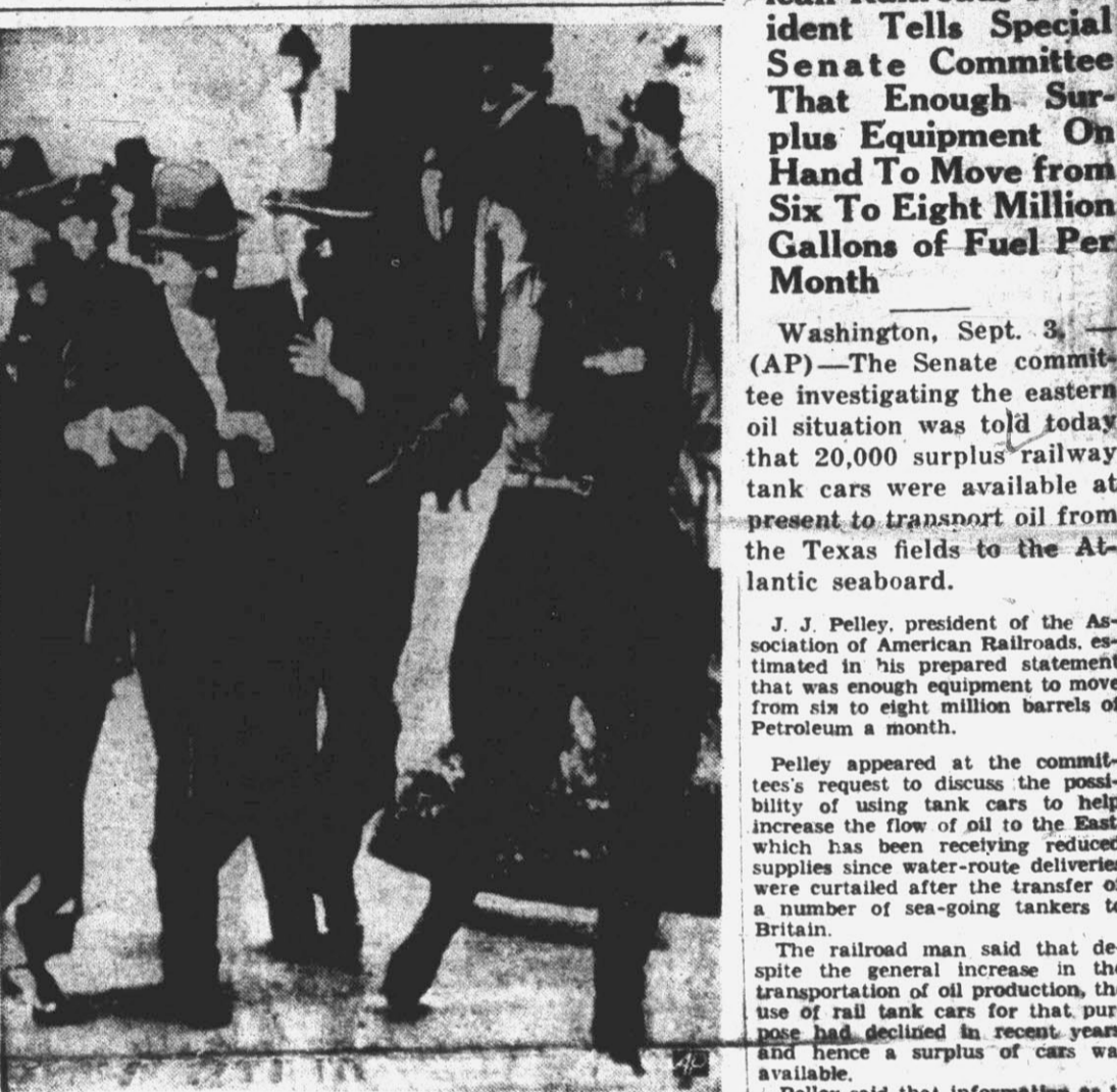
Pierre Laval (second from left) French statesman who was wounded by gunfire in an assassination attempt at Versailles, France, is led away from the scene by friends just after the attack. Late reports indicate he is recovering. This picture was radioed from Berlin.