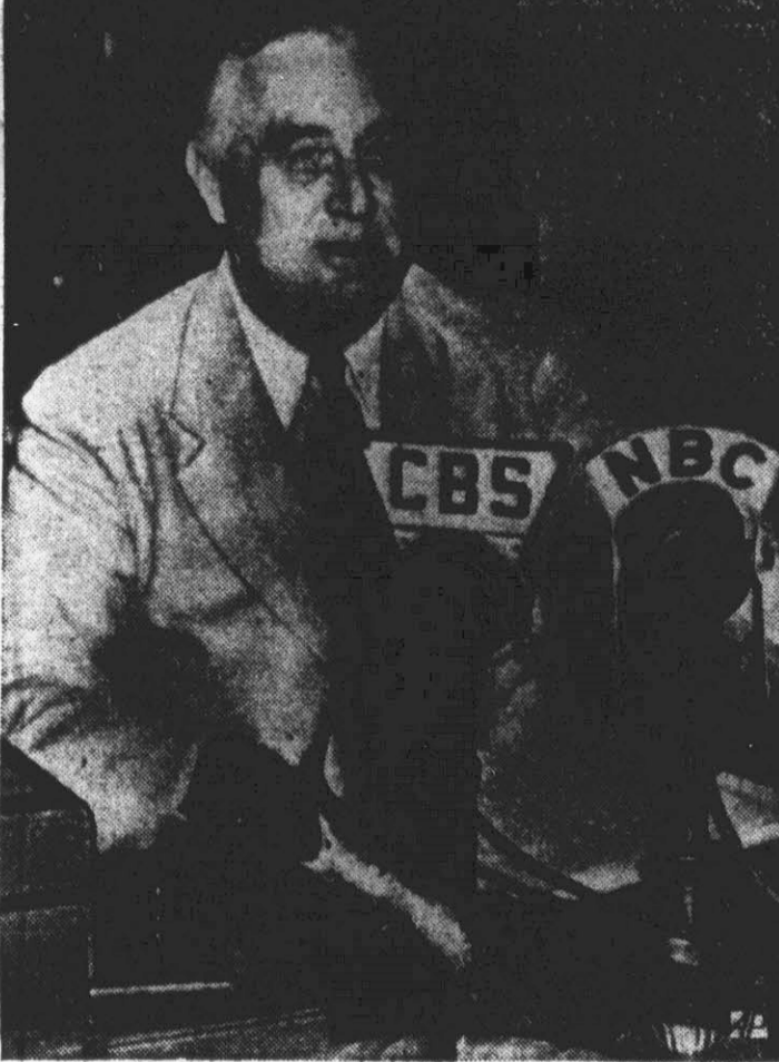
Broadcasting a Labor Day address to the American people from his home at Hyde Park, N. Y., President Roosevelt declared "we must do our full part" in conquering "forces of insane violence" let loose by Adolf Hitler. The President sits in front of microphones as he spoke.