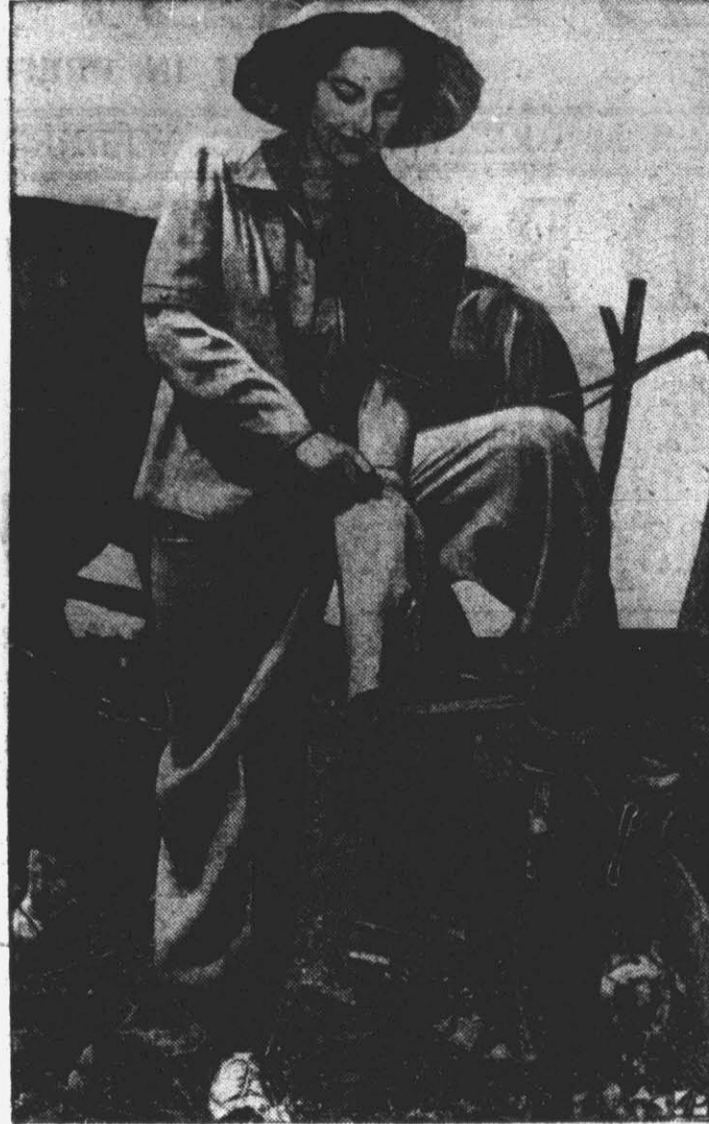
This fashionable farmerette buttons the trousers at the ankle. The outfit is in one-piece, with surplus closing, large pockets and plenty of room for movement. The U. S. Bureau of Home Economics suggests seersucker, which needs no ironing.