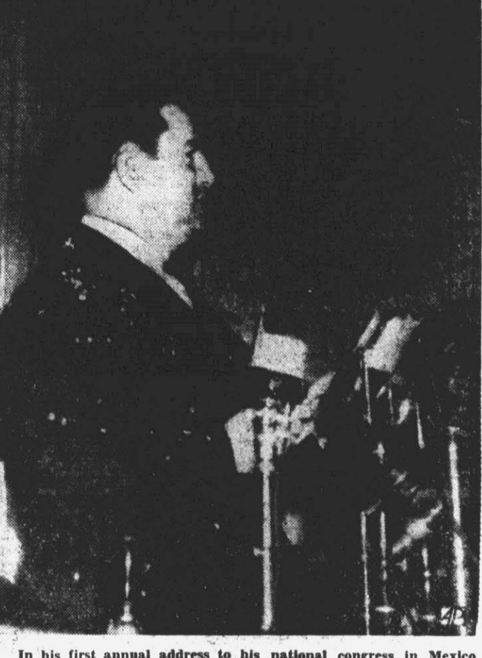
In his first annual address to his national congress in Mexico City, President Manuel Avila Comacho of Mexico stands before the microphones as he pledged Mexican arms to defend the western hemisphere and forecast continued cooperation between his country and the United States.