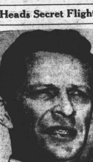
Mikhail Gromov (above), Russian air ace, is in command of two Soviet flying boats which landed at Nome, Alaska, en route to Washington, carrying 47 Russians on a secret mission. They are mostly veteran pilots, mechanics and radio operators. In 1937 Gromov flew a Soviet plane from Moscow to Southern California over the top of the world.

HEADS SECRET FLIGHT GERMANS DECLARED TO HAVE BEEN FORCED BACK AS MUCH AS 30 MILES IN DRIVE ON MOSCOW, WITH SIEGE RING AROUND LENINGRAD PUSHED BACK 3 MILES; INVADERS ARE HALTED AT GATES OF ODESSA