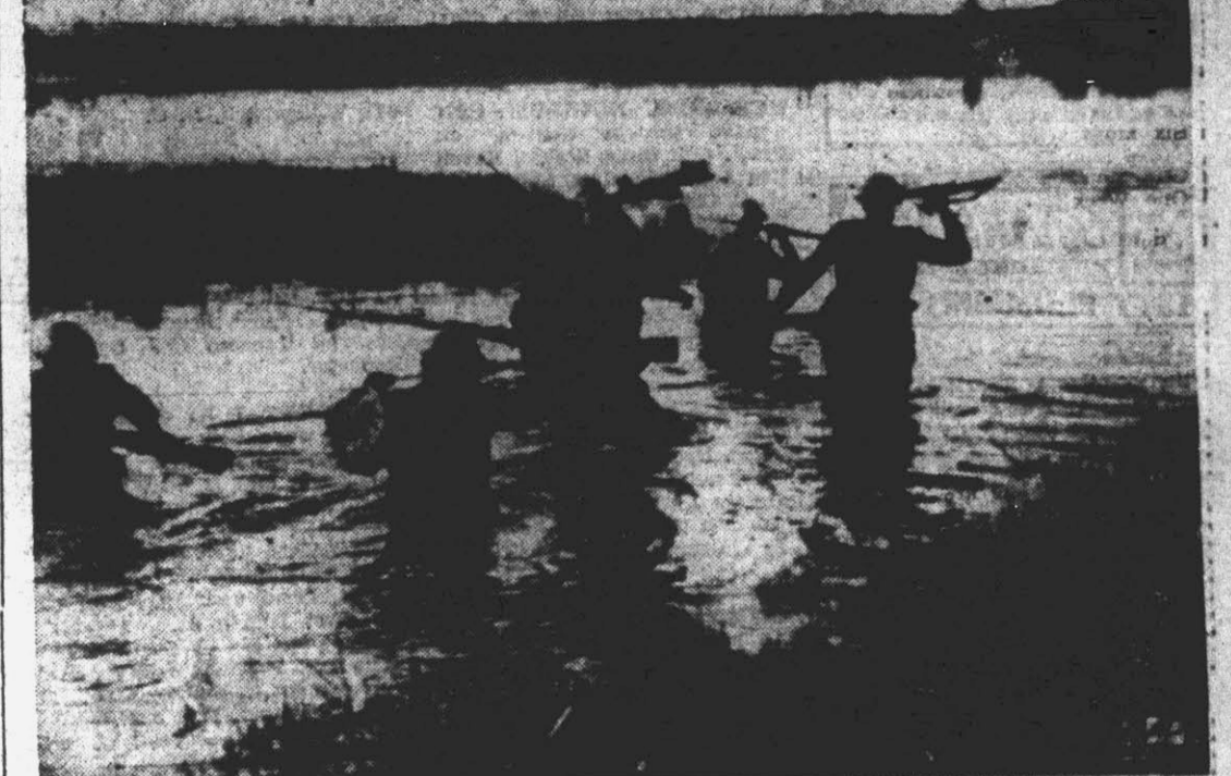
These troops, identified by Moscow sources as Russian infantrymen, make their way through a swamp in battling the Germans "somewhere on the eastern front." They are holding their guns above their heads to protect them from the water. The picture was radioed from Moscow.

The club officials yesterday fixed prices for the play-off series. Both men and women will pay 50 cents children under 16 years of age 20 cents and colored fans 20 cents, all prices including tax.