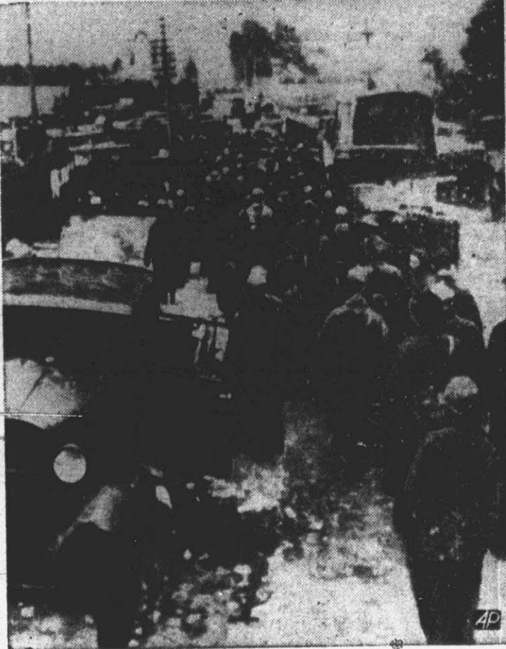
These men, according to German sources, are Russian prisoners trudging along a road in a suburb of Tallinn, Estonia. The automobiles were described as wrecked Russian vehicles. The German high command claimed 11,432 Russian prisoners were captured by the Nazis in the battle for possession of Tallin. The picture was radioed from Berlin.

"It's locked, Halia." I didn't try to be quiet, then, or to pretend I wasn't terrified. I felt wildly for the door. In my wet, sticky hand the knob was cold. I turned it and my hand slid aimlessly around while it stayed still. I put my coat over it and turned again. It was locked. I ran from one door to another and they would not budge. I turned and with my back up close against the door, I faced the stage. The light was coming down, into the orchestra pit; now it was starting up the aisle.