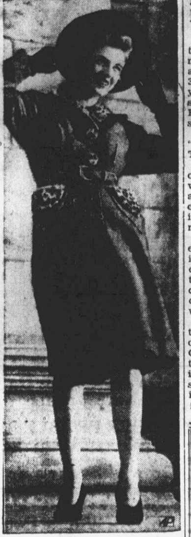
The new tapering silhouette developed in a leopard-trimmed town coat of a soft woolen in a rich tan shade called Rookie. Sleeves are deep, shoulders full. Matching dress.