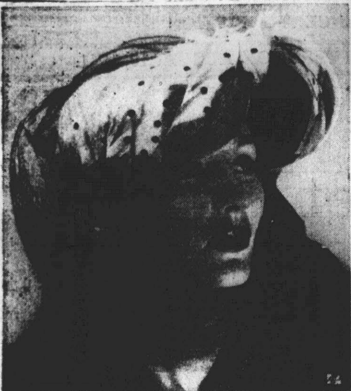
The casque silhouette, harking back to the helmets crusaders wore, was important in Lilly Dache's collection. Done here in pink coque feathers studded with black sequins.