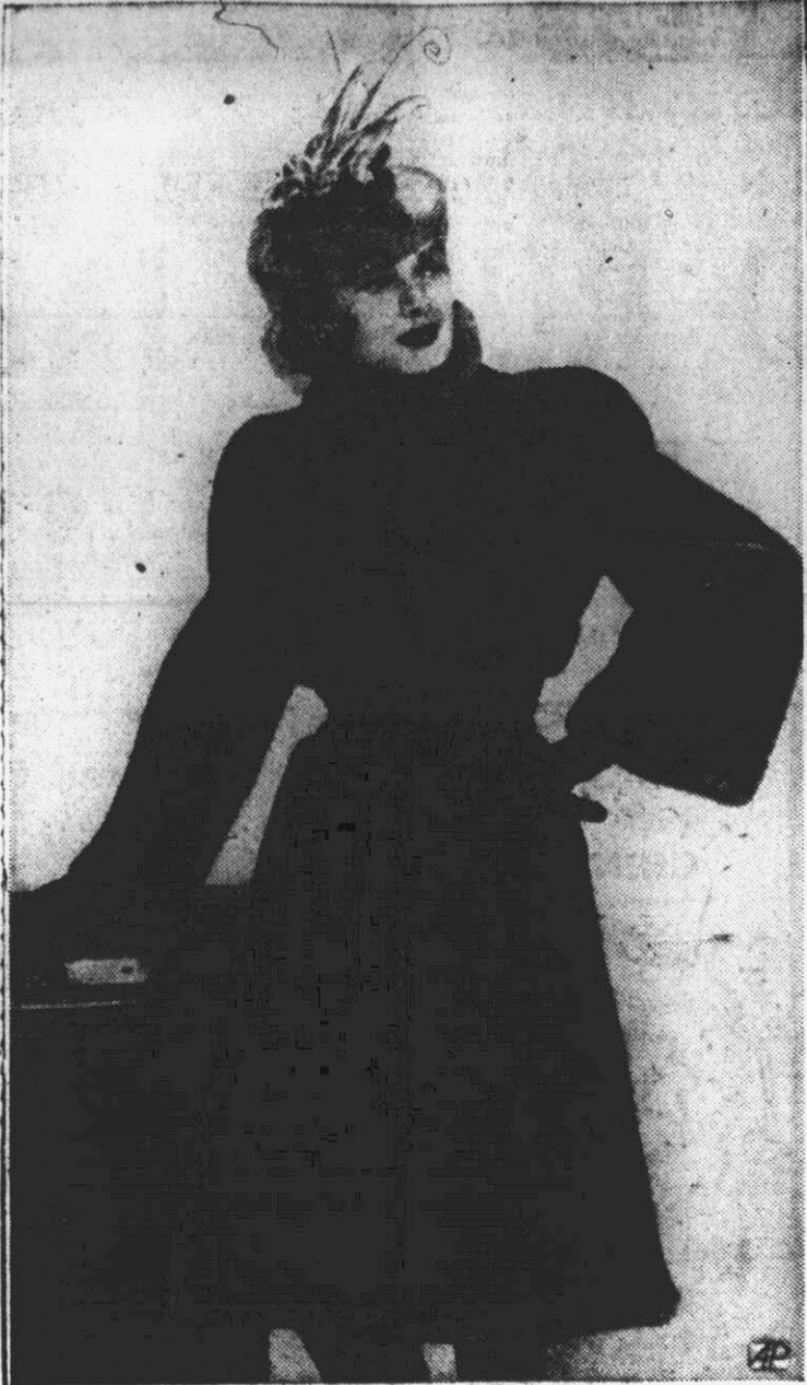
Laskin mouton is a less expensive cousin to beaver, handsome in this full length coat with wide set-in belt of matching suede cloth. Since it costs not much over $100, mouton is the solution for college girls and budgeteers. It comes in light brown, or deep logwood.