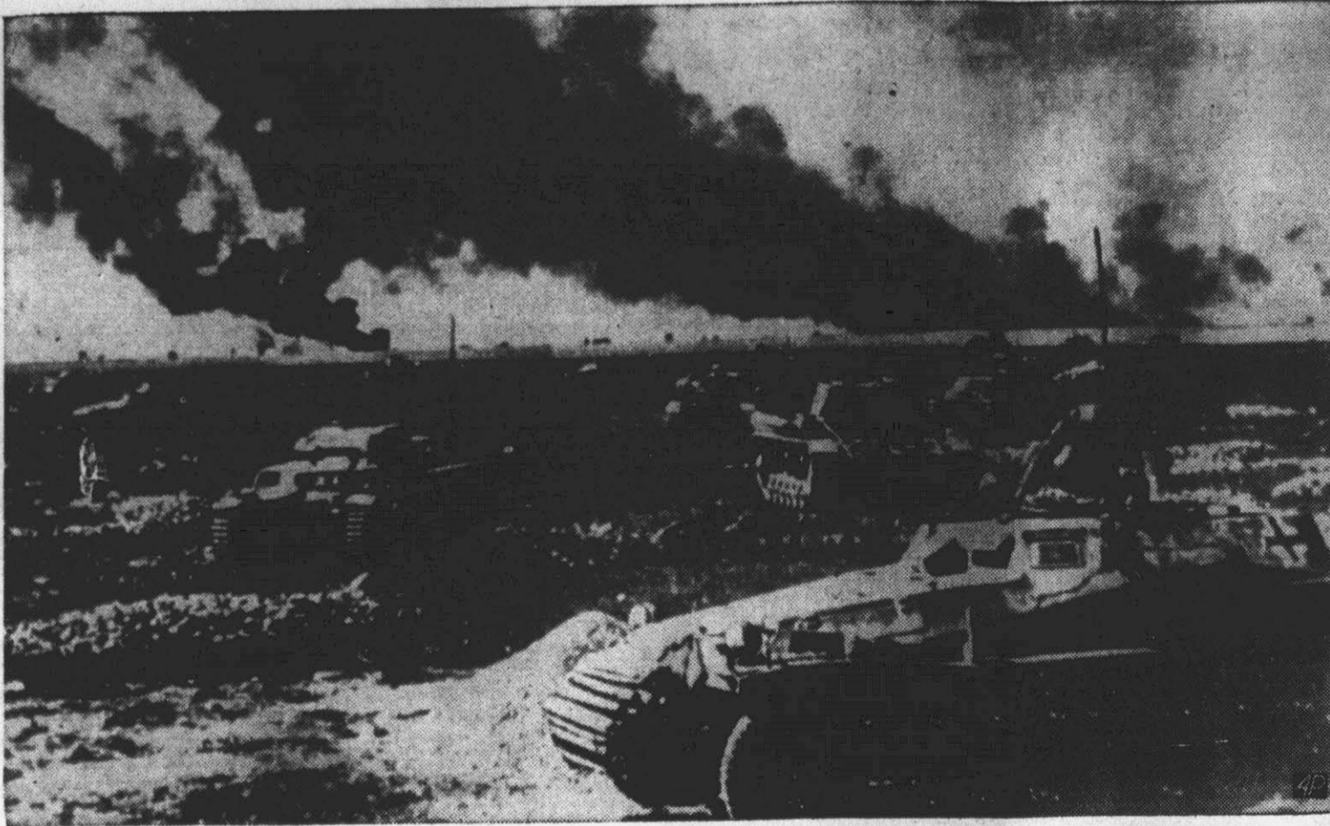
These German tanks are described by Nazi sources as assembling on a Russian battle field for "an attack on burning Sluk." Maps of Russia indicate the town of "Sluk" may be Sluzk which lies 6 miles south of Minsk in the Russo-German fighting zone. Radioed from Berlin.

WANTS Rates 15c per word, minimum charge 35c for 25 words, one insertion; six insertions $1.25; one month $7.00. Indented lines known as classified display, or larger than regular size type, double price.