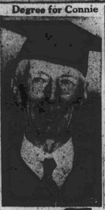
Connie Mack, manager of the Philadelphia Athletics, wears cap and gown at annual commencement exercises of Pennsylvania Military College, Chester, Pa., which conferred upon him the degree of Doctor of Physical Education.

BELK-TYLER OCTAGON SOAP, Spec. ... 5 for 18c OCTAGON POWDER, Spec. ... 5 for 28c OCTAGON TOILET ... 3 for 18c OCTAGON CLEANSER ... each 4c