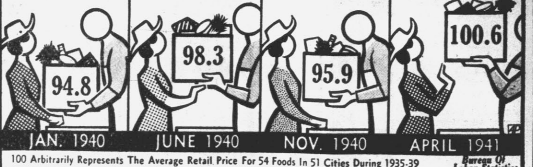
100 Arbitrarily Represents The Average Retail Price For 54 Foods In 51 Cities During 1935-39