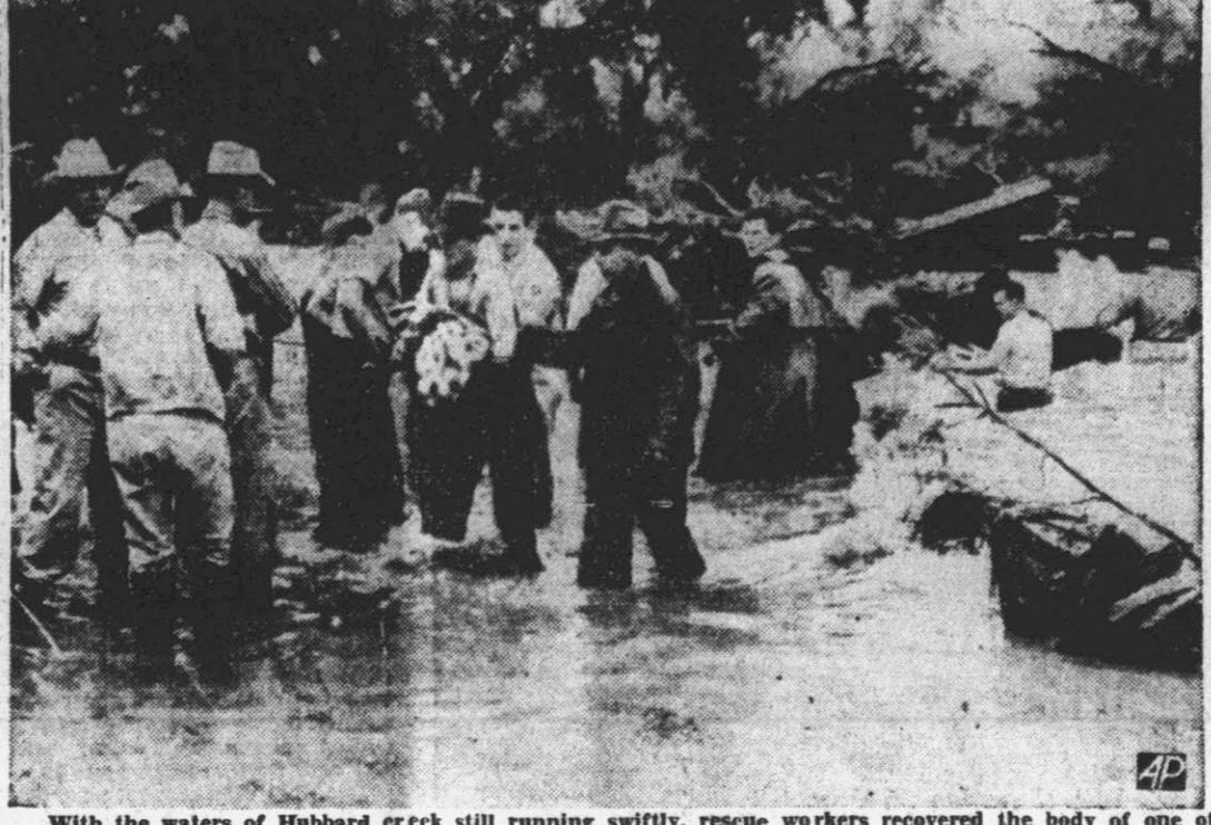
With the waters of Hubbard creek still running swiftly, rescue workers recovered the body of one of 12 persons drowned in a flash flood that surged upon their homes at Albany, Tex. The torrent came after