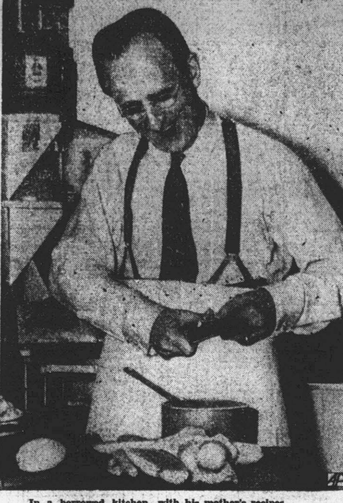
In a borrowed kitchen, with his mother's recipes.

Cook two pounds squash with three medium sized onions in salted water until done. Drain, mash, season with salt and pepper to taste. Fry in bacon fat until brown. Kay Kyser has been cooking ever since he left mud-pie days behind. He is a whiz with a banana pie. And his fried chicken is as southern as his "Evenin', folks, how y'll."