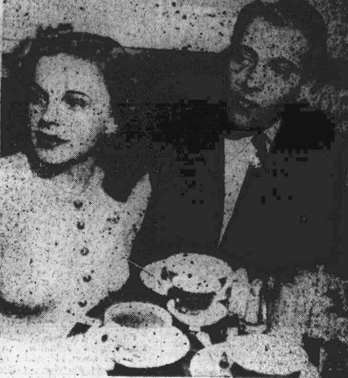
Movie Starlet Judy Garland has let it be known she will announce her engagement to Song Writer Dave Rose at a delayed birthday party June 15. She was 19 June 10. Here are Judy and Rose at a party in Hollywood.

with Merle Oberon in "Illusions." He's a resourceful gent, this Joe. Having just turned 34 on May 15 he's done practically everything in and out of acting. Blue-eyed, square-jawed, with curly light brown hair, he's the current object of the lady fan mag writers' devotion. The acting bug bit him hard back in Petersburg, Va., his home town, and from the time he was 16 he began doing things about it. Periodically, between mundane jobs, he began trekking to New York. In Miami, Fla., where he worked occasionally as a reporter, he joined a little theater group, each summer pounding Broadway pavements. He hit New York, permanently by walking into David Belasco's sanctum and getting a job. A letter from a Miami dramatic critic did the trick—"the only time I ever heard of a letter of introduction going any good." Belasco made him understudy to Lynne Overman in "Dancing Partners," later to Melvyn Douglas in "Tonight or Never." Then came 56 weeks of stock in Boston—hard but good training.