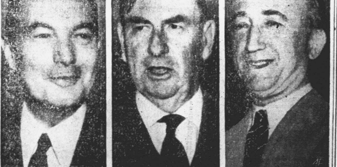
Here are the three men nominated by President Roosevelt, to fill vacancies on the United States Supreme Court bench. Justice Harlan F. Stone (center) was chosen for elevation to the seat of Chief Justice succeeding Charles E. Hughes, retired. Robert H. Jackson (left), Attorney General, was nominated for the vacancy left by Justice Stone's elevation. Senator James F. Byrnes (right), Democrat of South Carolina, was chosen for the vacancy created by the retirement of Justice James Clark McReynolds.