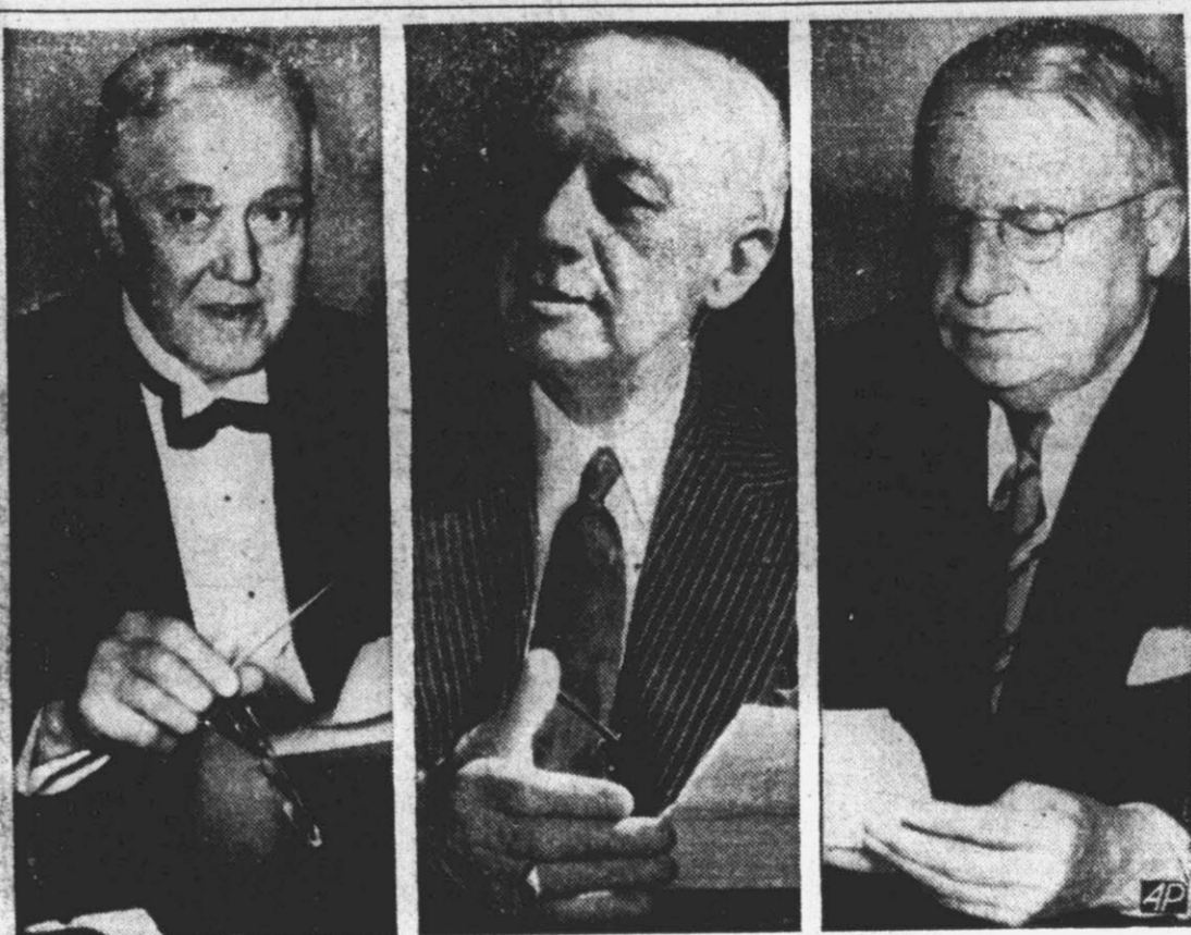
In radio broadcasts to the country, three former Democratic presidential nominees appealed for national unity during the emergency proclaimed by President Roosevelt. John W. Davis (left), 1924 nominee spoke from Albany, N. Y. Alfred E. Smith, nominee of 1928, (center), broadcast from New York. And James M. Cox (right), 1920 nominee and publisher of the Atlanta Journal and Miami Daily News, spoke from Dayton, Ohio.