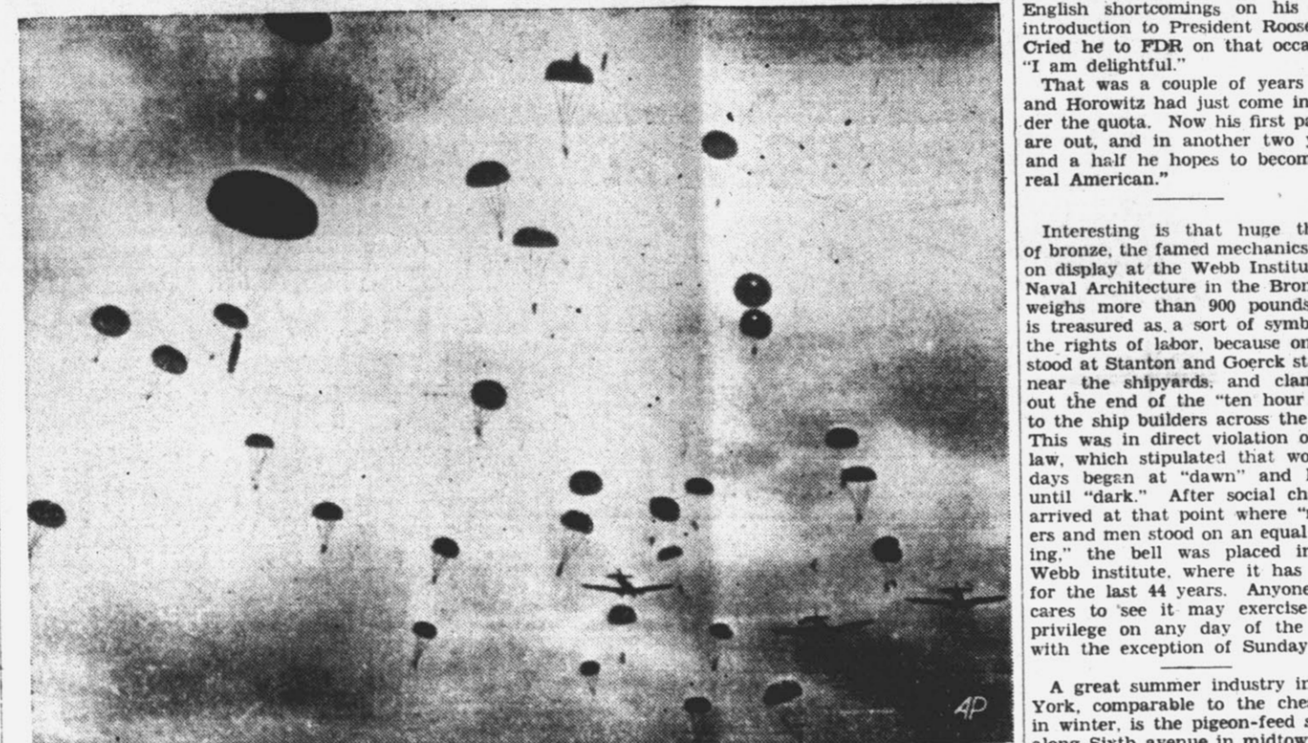
German parachutists float from planes over Corinth, Greece, April 26 in the closing days of the Nazi seizure of Greece. This action resulted in the capture of Corinth. The picture has just been released in Berlin and was radioed to the United States. Similar strategy was used in carrying troops to the island of Crete.