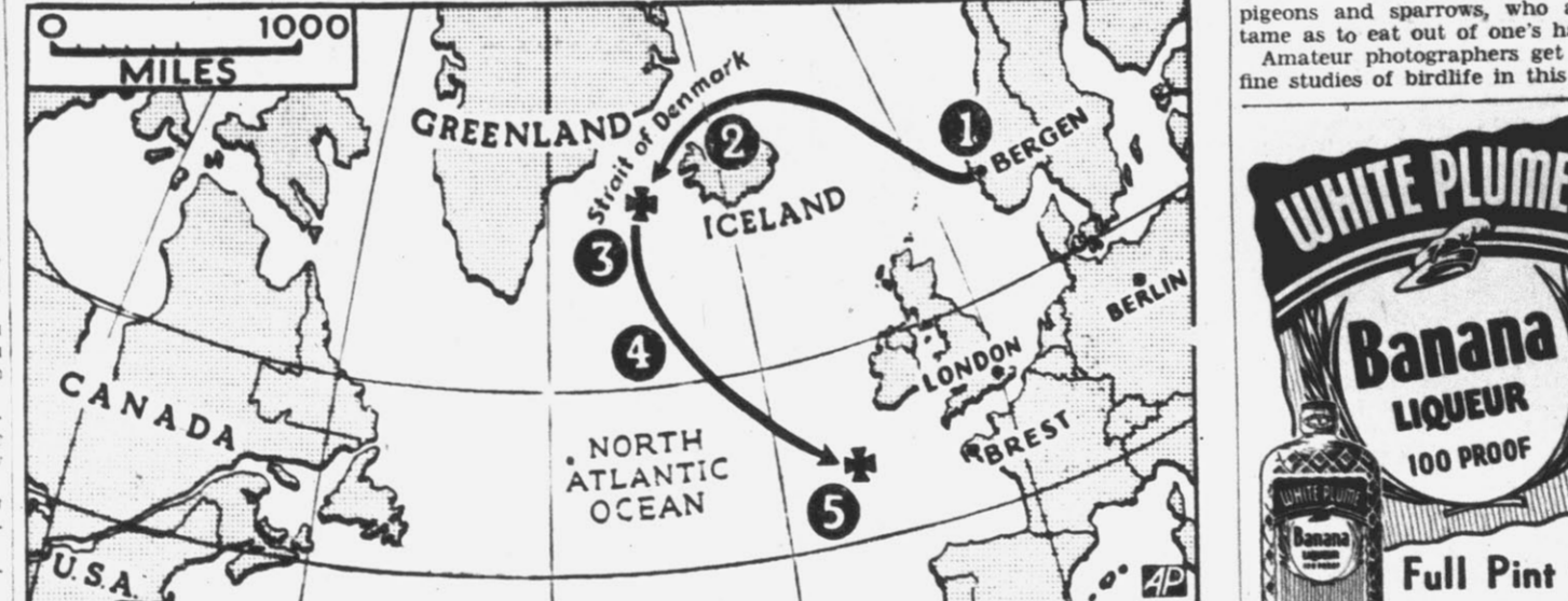
This map indicates the route of the German battleship Bismarck from the time she was first observed off Bergen, Norway, until she sank under a combined air and sea attack by the British 400 miles west of Brest, France. First discovered by British scouting planes May 21 at Bergen (1), the Nazi war ship was next seen by the British fleet as she passed through the Strait of Denmark off Iceland (2). At dawn May 24 the British battle cruiser Hood intercepted the Bismarck, which sank the Hood off Greenland (3). The British fleet began pursuit and the Bismarck, slowed down by a hit on the bow in the Hood action, was slowed still more by an aerial torpede hit (4). Then, with British aircraft and war ships closing in on her and with her running gear smashed by more aerial torpedoes, the Bismarck went down (5) under furious fire.