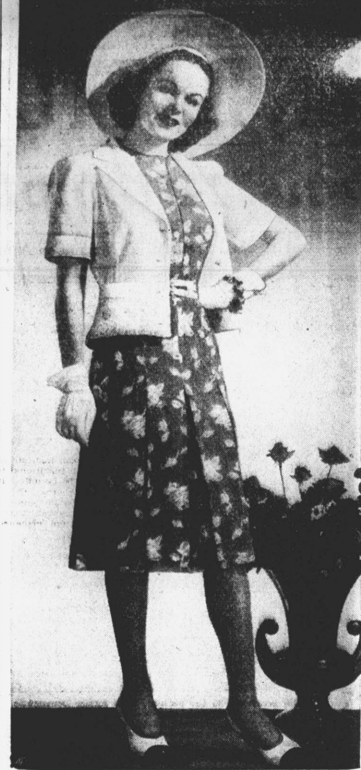
Roses copied from life bloom on some of the prettiest new summer frocks. Here's a rose-sprinkled spun rayon with a crisp white jacket to increase its usefulness. It's priced under $0. Seen at rose parade fashion show.