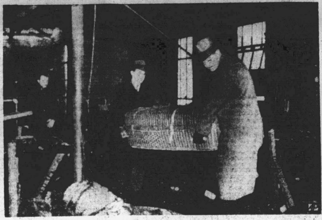
Ten employees of the New Haven (Conn.) Quilt and Pad Company died swiftly in a fire which turned a room filled with baled cotton into a charred, blackened ruin. All victims were burned beyond recognition.

ective until it actually drops its nose for a dive. After that, it is almost invincible. It's going too fast for anti-aircraft guns to set their fuses and fire, or fighter planes to catch. Maximum speed is around 430 miles an hour or better at the bottom of its steep diving "V." At that point the pilot lets go his bomb and sets his controls to come out of the dive. He sets his controls in advance because he's likely to "black out" on the climb. The human machine all but gives up under the sudden pull of gravity. A pilot usually comes to in less than a minute. The reason these ships perform with uncanny accuracy, is because the bomb is in the nose, and the nose is aimed at the target. Thus the bomb, when released, continues the line of flight. Surprise Is Big Help The dive bomber is particularly deadly in close quarters where it can surprise the enemy before fighter planes get up. That's why it was such an overwhelming success against the French last year, and that's why it's playing hob with British convoys in the Sicilian channel. Based at Pantelleria, the Italian naval base, and at Catania on the island of Sicily, bomber flying times to the British convoy routes through the channel are 6