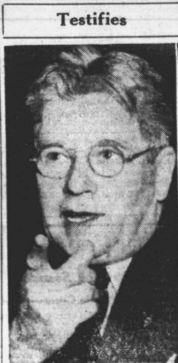
Testifies Testifying before the Senate Foreign Relations Committee in opposition to the aid-to-Britain bill, former Gov. Philip F. La Follette of Wisconsin (above) said Premier Edouard Daladier of France told him in 1939 that France expected the United States to aid it with "money, materials and men."