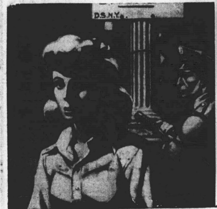
She was aware of a policeman's glance.

go on that way any more. Much of Gert's and Ring's trouble had been over her, her extra mouth to feed her extra body to clothe. That would stop tonight.