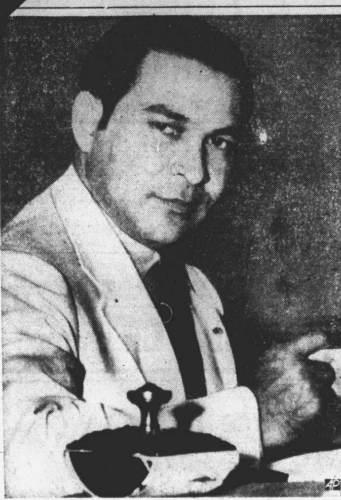
President Fulgencio Batista (above) of Cuba took personal command of the country's army, navy and national police force after removing the heads of those departments. Batista said the replaced men were showing attitudes regarded as openly seditious. Shortly before the announcement was made, army guards threw up sand bags at strategic points inside the presidential palace at Havana and mounted machine guns at the entrance.