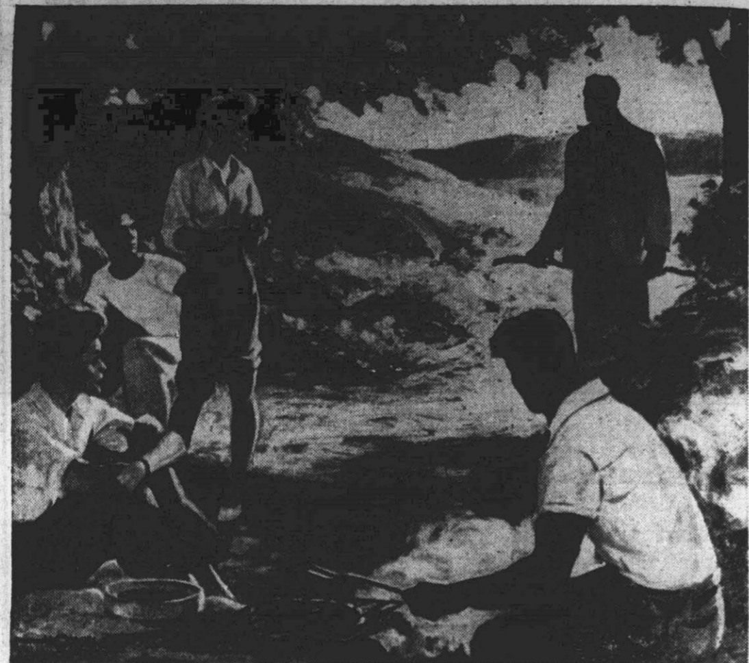
THEN ROGER'S EYES WERE MEETING LOVELY'S.