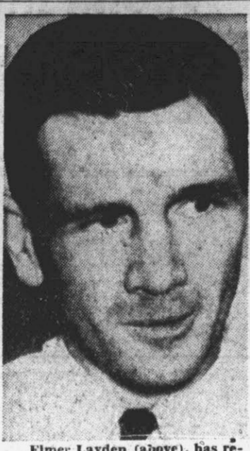
Elmer Layden (above), has resigned as Notre Dame's head coach and director of athletics to become commissioner of professional football at a salary of $20,000 a year. His duties as boss of the National Football League and several minor circuits are comparable to those of Commissioner Kenesaw Mountain Landis, czar of baseball.