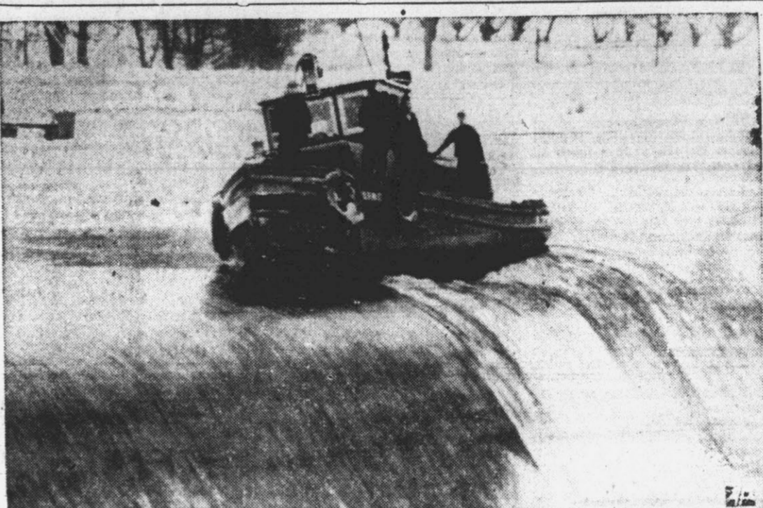
When the motor launch Spalpeen II broke from its moorings at Oswego, N. Y., and perched itself precariously on the brink of a 40-5 foot power dam, its four-man crew had to wait four jittery hours for rescue. The men here calmly await arrival of a Coast Guard crew which took them to safety. The rescuers could put out a rowboat only after water in the Barge canal had been shut off.