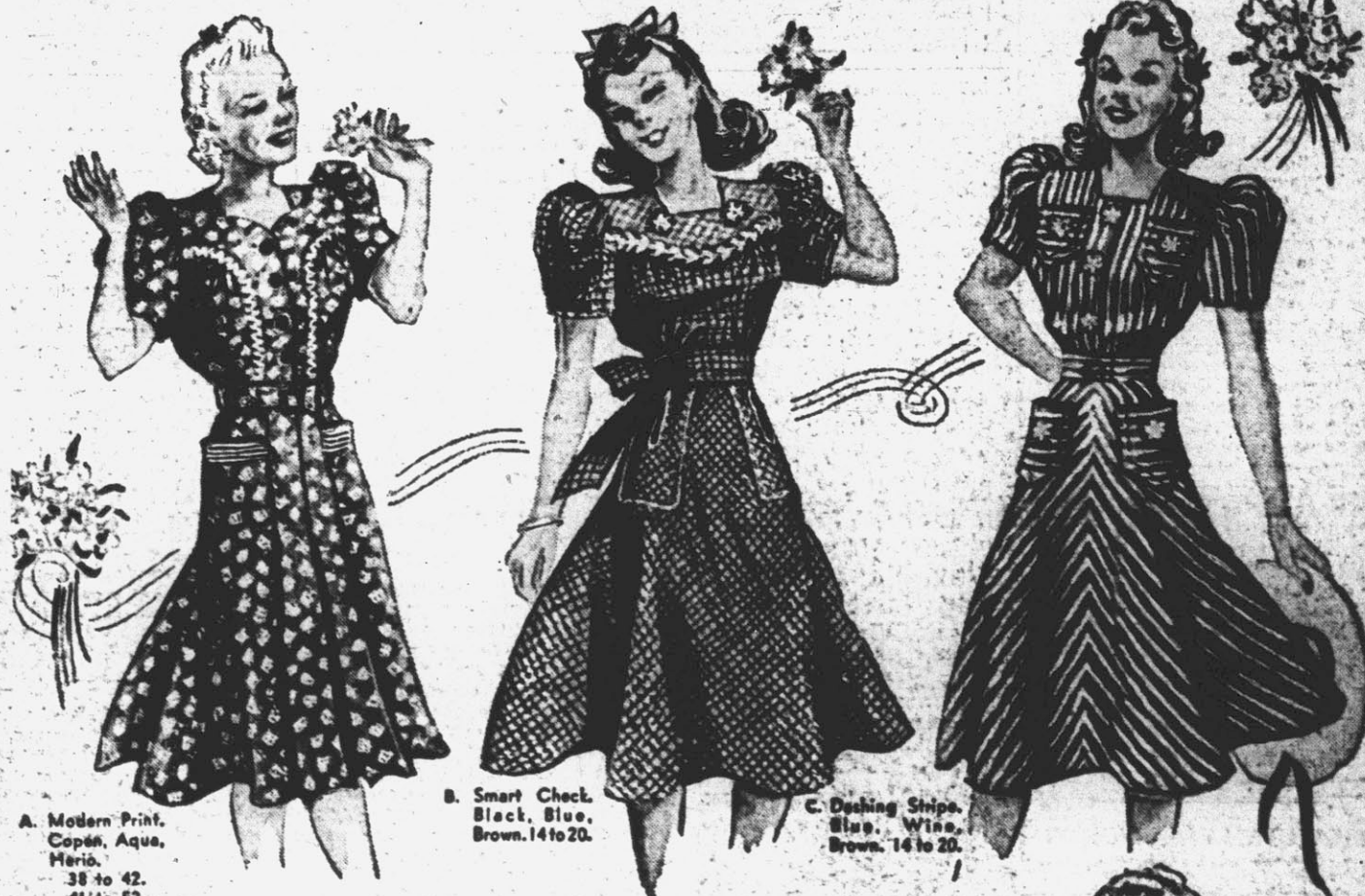
A. Modern Print. Capes, Aqua, Meris. 38 to 42. 44 to 52.

It also prohibits use of any public buildings for any such purpose. First violation would be a misdemeanor, second a felony.