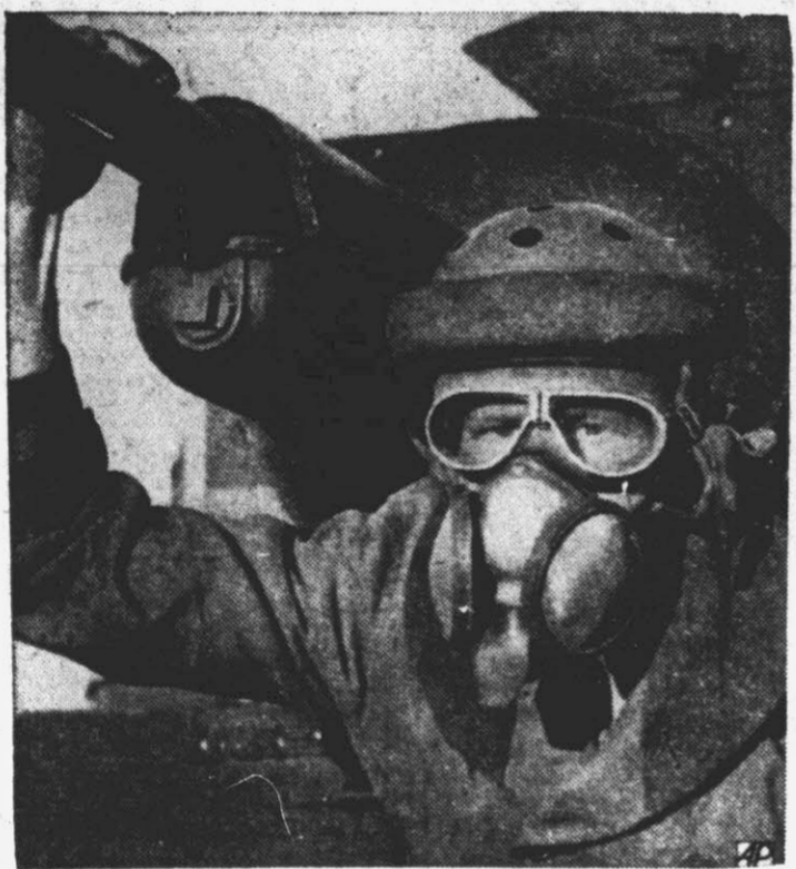
Dusty roads, long a plague to the army's tank crews, now is solved by this man-from-Mars-looking contraption which this private of the 68th armored division at Fort Benning, Ga., is wearing. The new dust masks, fashioned somewhat after masks used by miners, utilizes the disks on the side of the mouthpiece as dust filters.