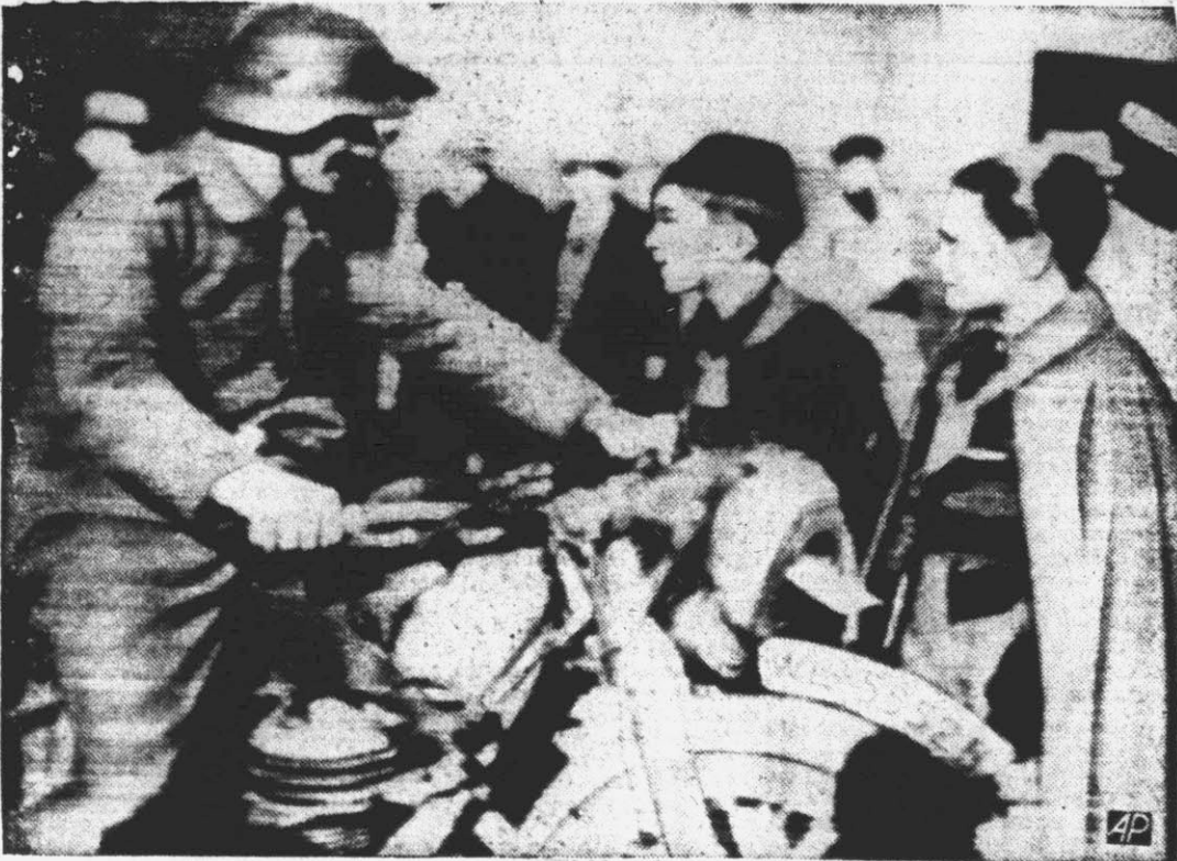
This picture of a German air force soldier motorcycleing through an unidentified Italian city, is the first photo to reach the United States of Nazi aviation forces sent to Italy to join in the battle against Great Britain in the Mediterranean area. The picture was telephotoed from Rome to Berlin and then radioed from Berlin to New York.