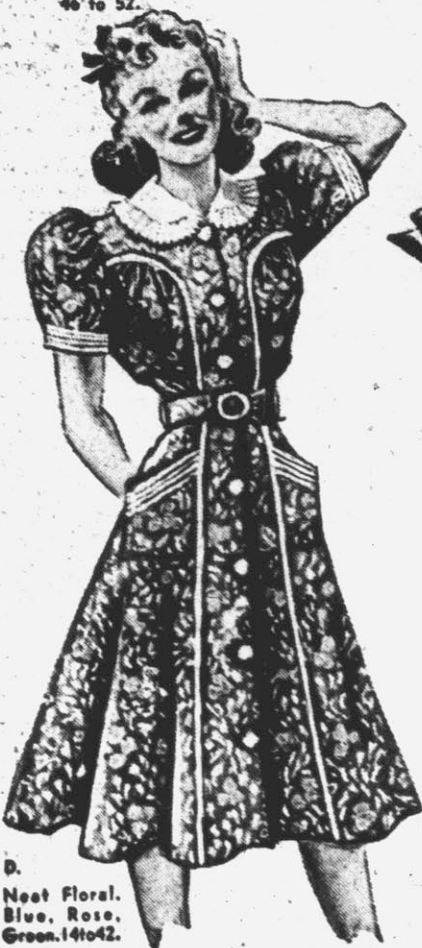
D. Nest Floral. Blue, Rose, Green. 14 to 42.

They're the gayest wash frocks we've seen in ages! They fairly sparkle with singing prints in garden-fresh colors! New as the first robin's song... alive with new details and crisp trims... marvelous with tiny, nipped-in waists and full swishing skirts! Come in and see our whole new collection of Fruit of the Loom Percales... these illustrated are just a few of the exciting styles that will bring you compliments galore!