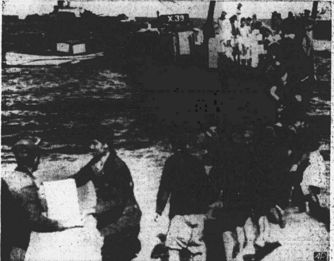
After the British took Sidi Barrani supplies were poured into the town to maintain the rapid advance made into Italian territory. Here Italian prisoners are put to work unloading freight under supervision of Australian troops. Note British war ship in background.