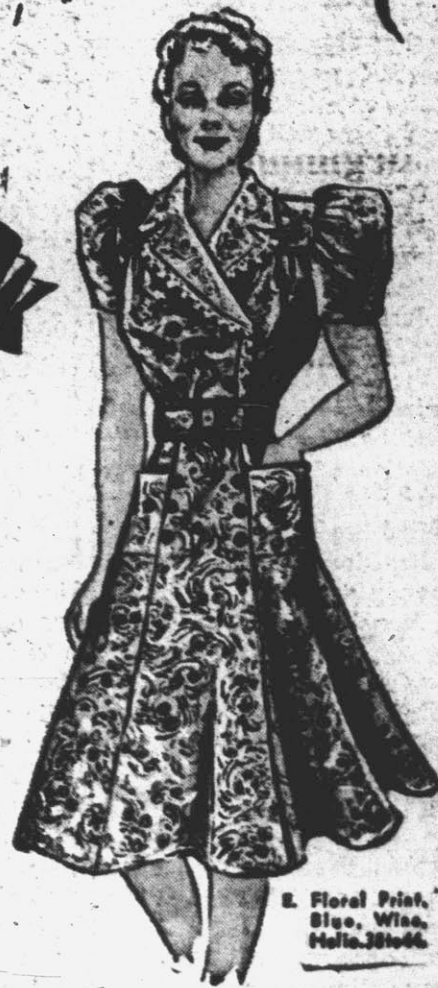
E. Floral Print. Blue, White, Yellow. 38 to 44.