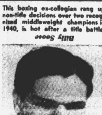
This boxing ex-collegian rang up non-title decisions over two recognized middleweight champions in 1940, is hot after a title battle.