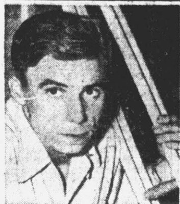
This lad from Louisville was one of the most talked of rookies in big league baseball until a broken heel-one caused this sad face.