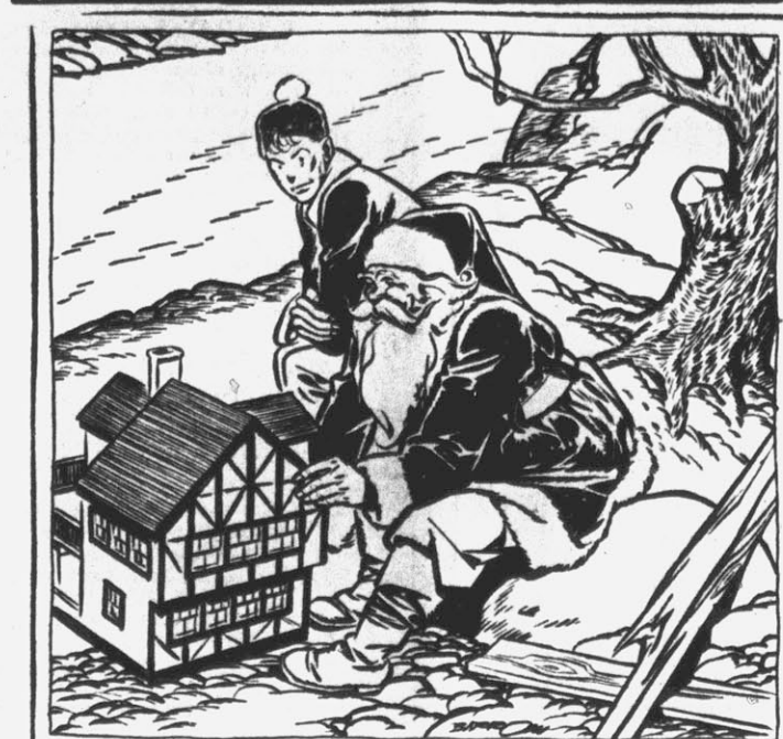
'LOOK,' SAID SANTA, 'THIS DOLL HOUSE IS VERY SPECIAL.'

THE STORY SO FAR: Eric, a fisherman's son, sets out to capture a second giant who has bewitched the kingdom of the good. Gray Queen. He gets help from a magic locket.