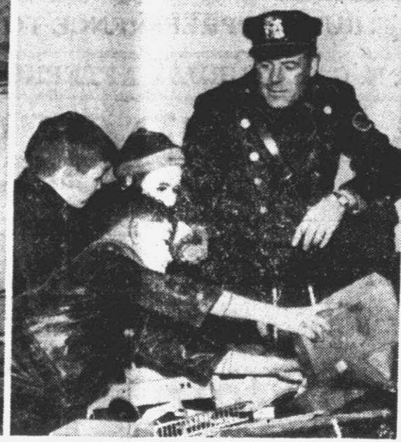
Playing St. Nicholas is an old story to every New York policeman.