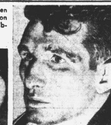
His lightning-like blows brought this wiry Texan, almost unknown until 1940, the lightweight boxing crown Lou Ambers had worn.