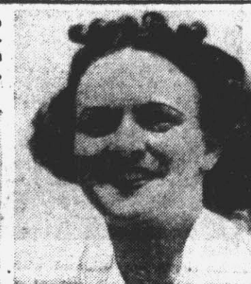
Her play against veteran Helen Jacobs in the national singles tennis championships focused attention on this Californian.