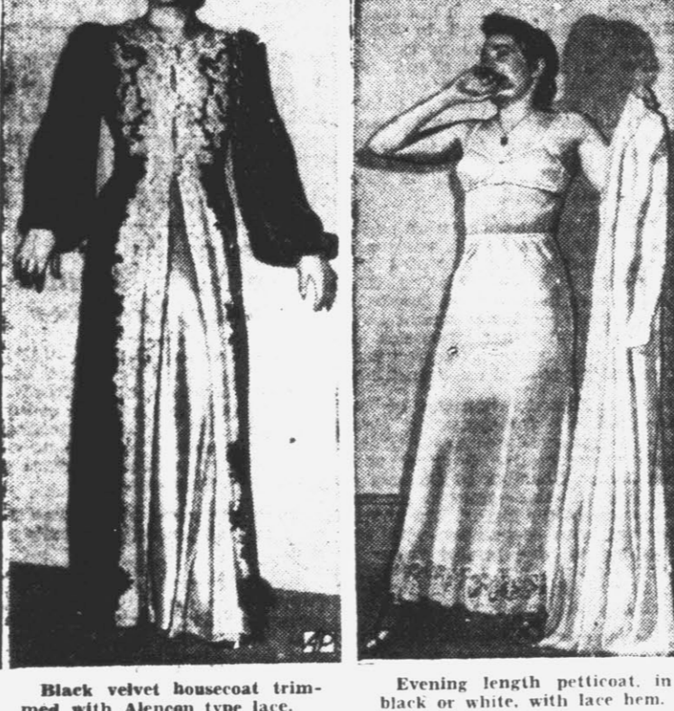
Black velvet housecoat trimmed with Alencou type lace. Evening length petticoat, in black or white, with lace hem.

Pretty lingerie is offered in abundance this year, in spite of the fact that no more lace is imported from France. Domestic lace-makers have been working overtime.