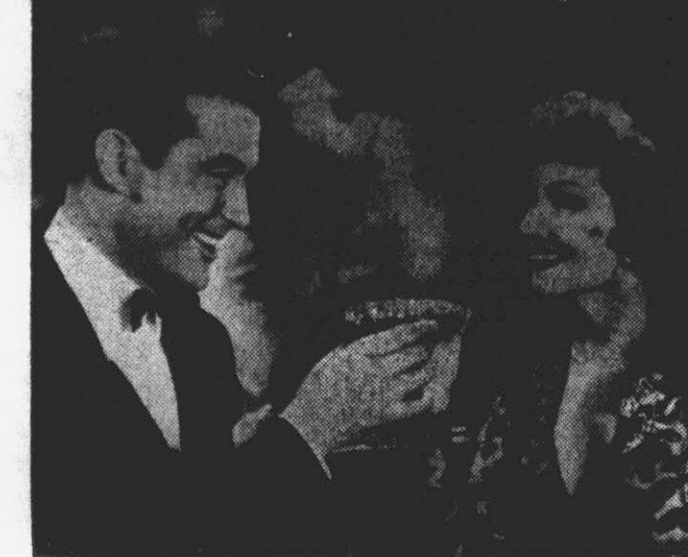
Scene shows Ray Milland with Claudette Colbert co-starred in cheery screen hit playing at the Pitt today through Monday

father always felt a man's standing in his community depended upon whether he was an employer or an employee. Any young man who wants to become an employer should be encouraged to get into business for himself.